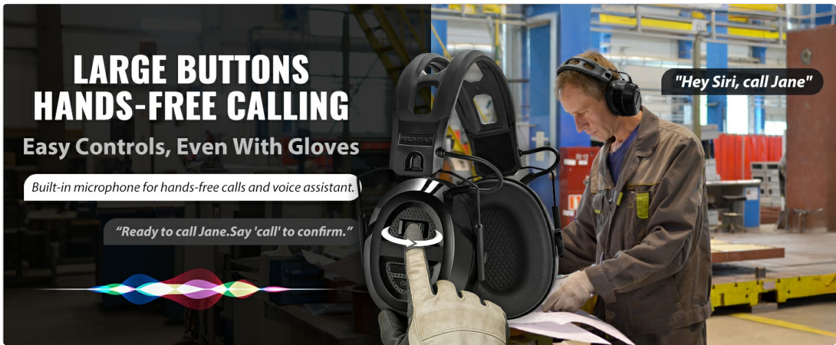
Image: The large, tactile buttons are designed for easy use, even when wearing work gloves.