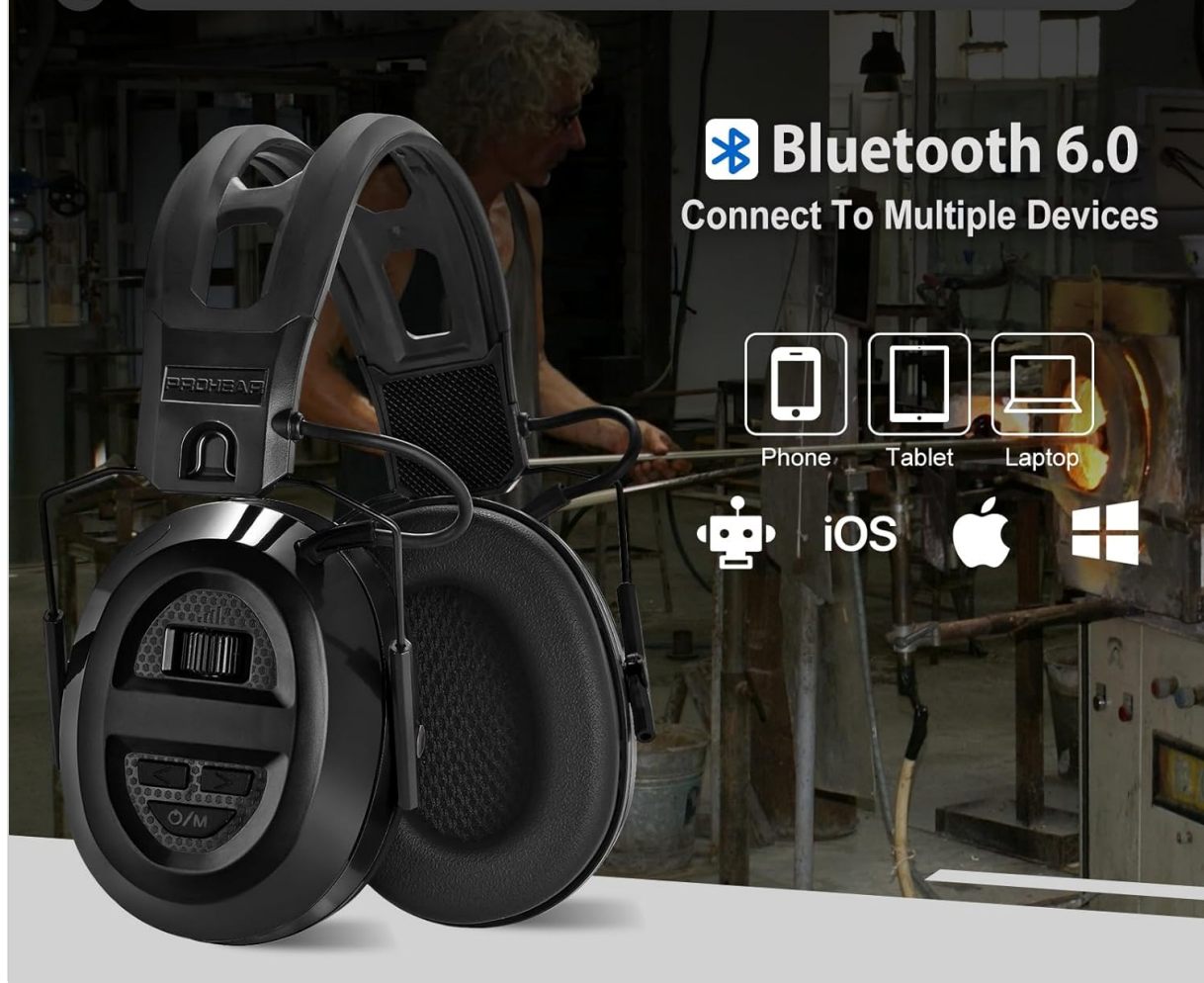
Image: The headphones can connect to various Bluetooth 6.0 enabled devices, including phones, tablets, and laptops.

A Yes – Seamless Bluetooth 6.0 pairing with phone, tablet & computer.