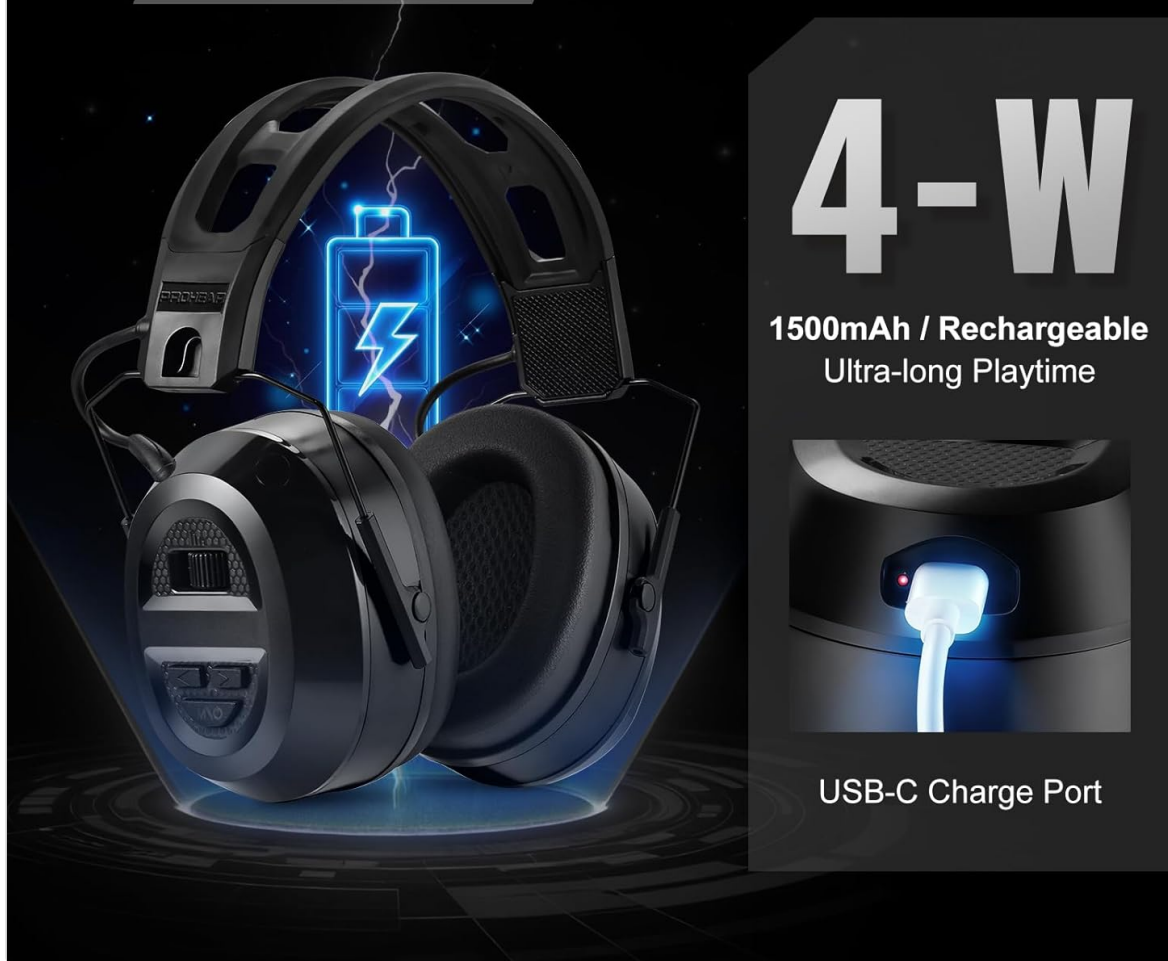
Image: The USB-C charging port is located on the bottom of the right earcup. A lightning bolt icon indicates charging status.

Rechargeable for all-day & multi-day use