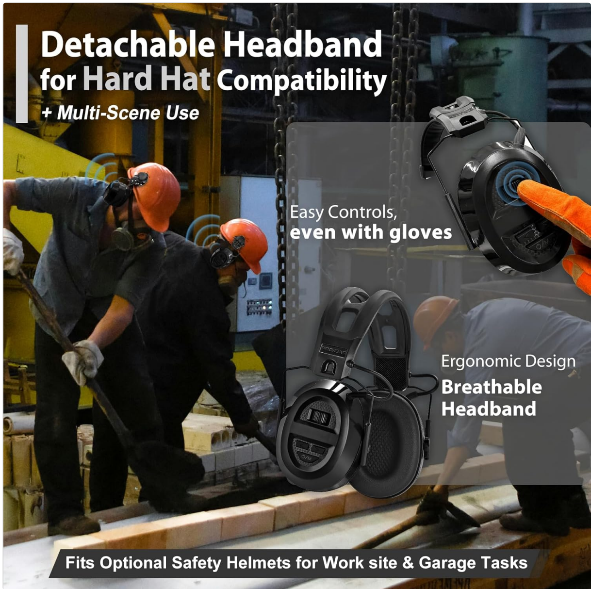
Image: The detachable headband allows for easy integration with hard hats, making the headphones suitable for various work environments.