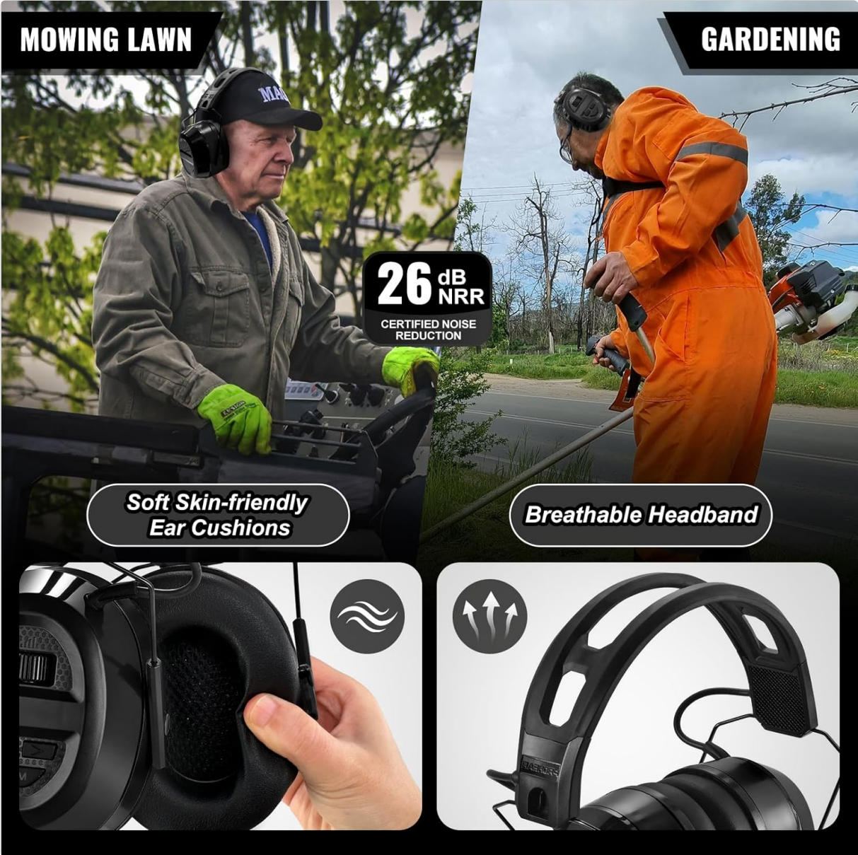
Image: Features like soft ear cushions and a breathable headband enhance comfort during extended wear.