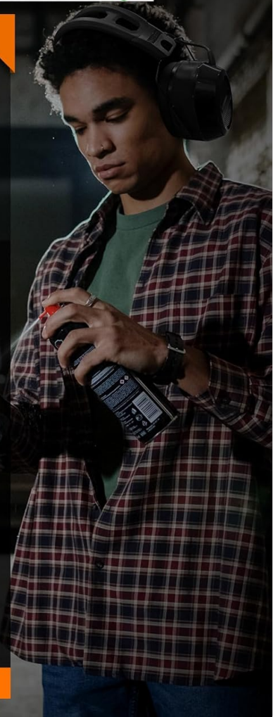
Image: Certified 26dB NRR ensures effective hearing protection, compliant with OSHA standards, as indicated by various certifications like RoHS, FC, MSDS, CE, and Prop 65.

Tested to meet U.S. and international safety standards.