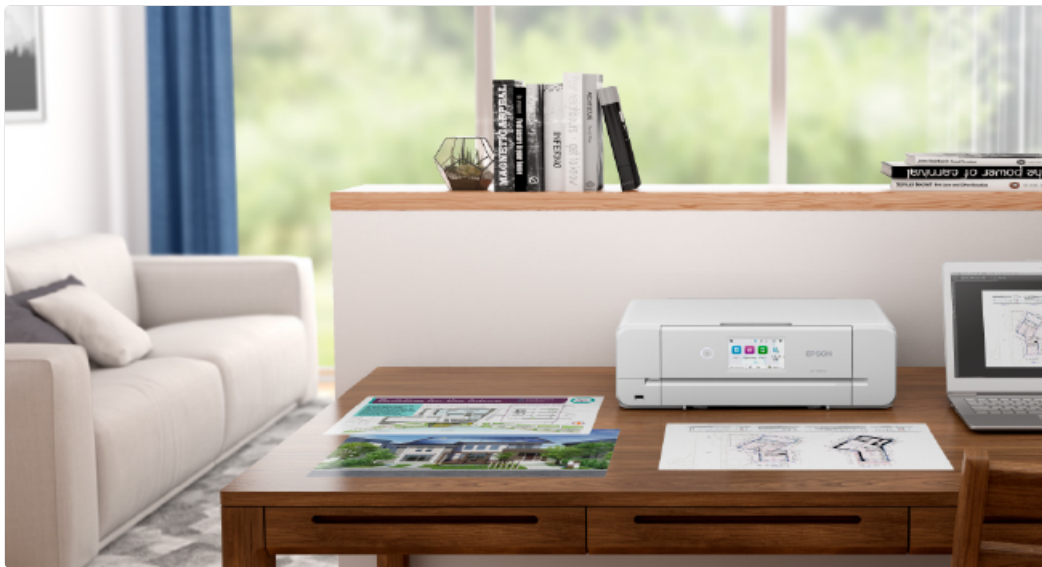
Image: A smartphone connected to the printer via the Epson Smart Panel app, demonstrating wireless control over print, copy, and scan operations.