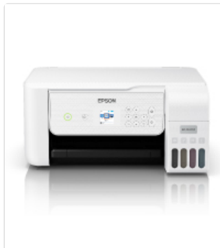
Image: The Epson EP-988A3 printer displayed with a package of genuine Epson ink cartridges, emphasizing the recommendation to purchase spare ink.

When an ink cartridge runs low or is empty, a message will appear on the LCD screen. Replace the empty cartridge with a new, genuine Epson ink cartridge. It is recommended to have spare ink cartridges on hand to avoid interruptions.