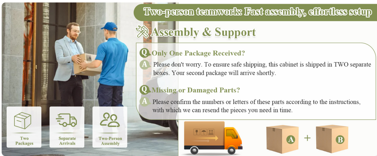
Image 3.2: Visual guide recommending two-person assembly for efficient and safe setup.