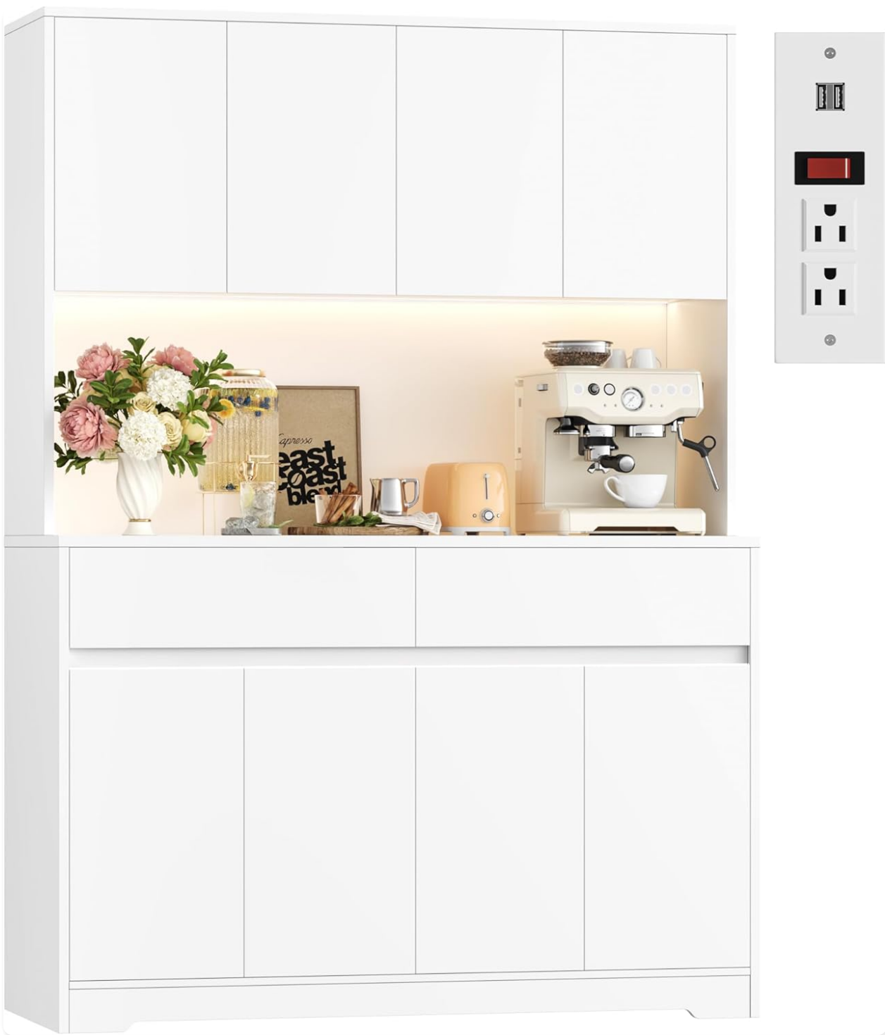
Image 1.1: The FINETONES 71-inch Tall Pantry Cabinet, showcasing its design and functionality in a kitchen environment.