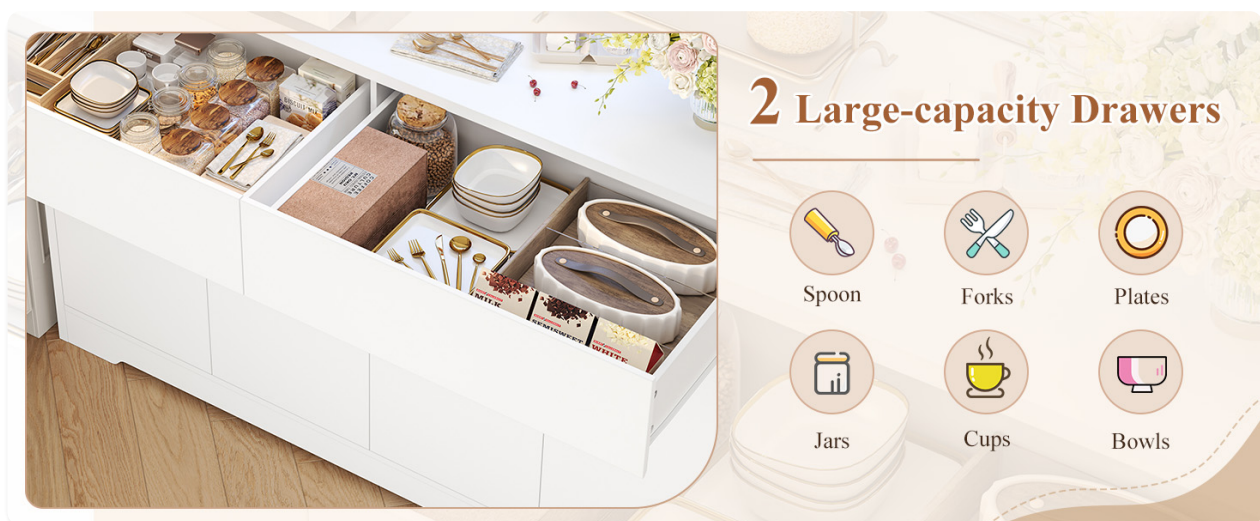
Image 4.5: Detailed view of the two smooth-gliding, large-capacity drawers, demonstrating their storage potential for kitchen essentials.