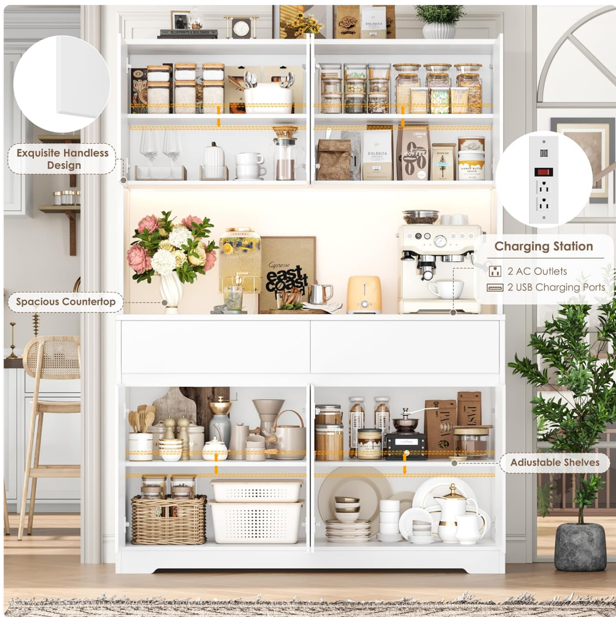
Image 4.4: An open view of the pantry cabinet's interior, highlighting the adjustable shelves, charging station, and ample countertop space for various items.