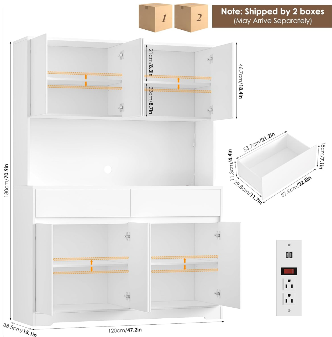
Image 3.1: Overview of product dimensions and packaging, indicating shipment in two boxes.