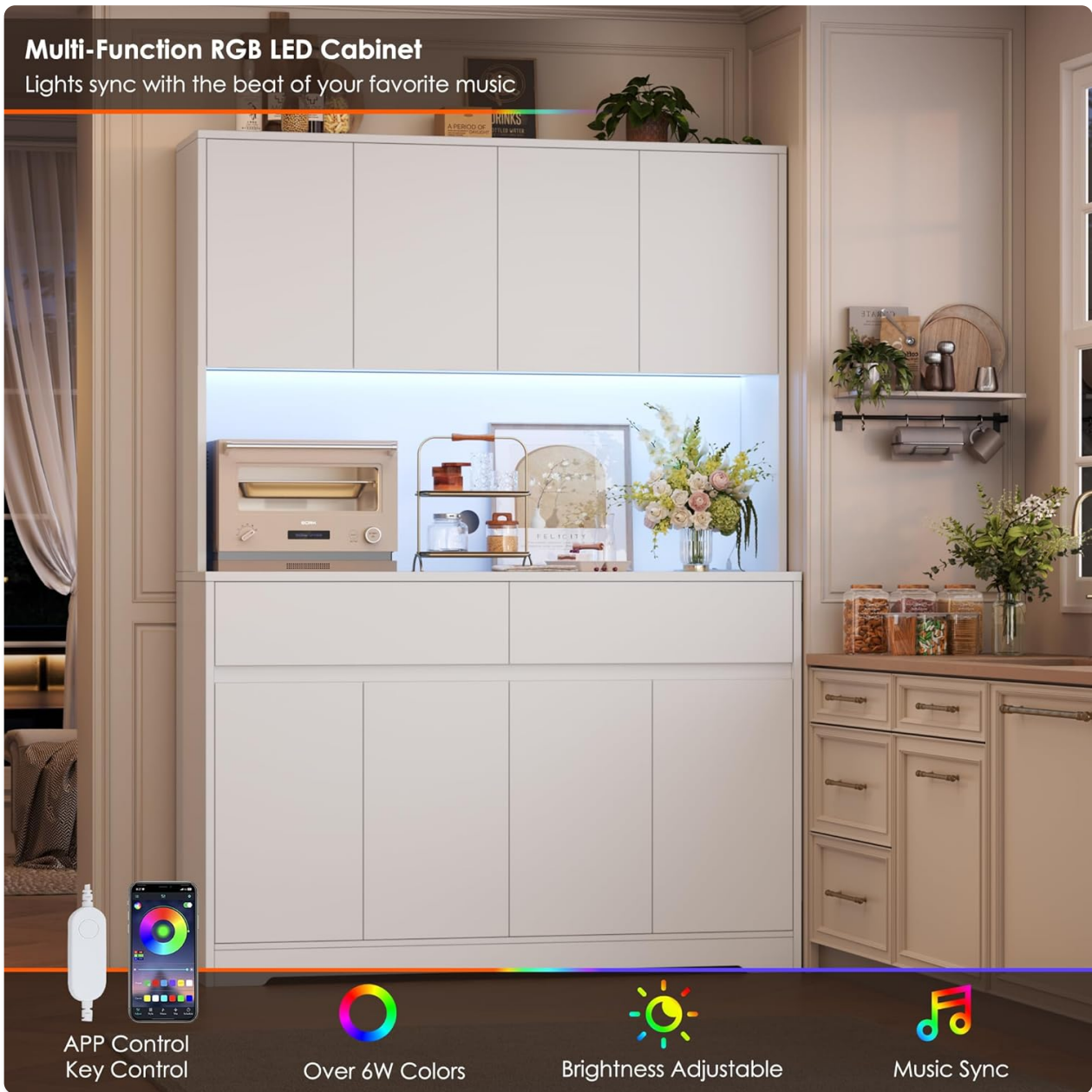
Image 4.2: The multi-function RGB LED cabinet lighting, illustrating app control, color options, brightness adjustment, and music sync capabilities.

Lights sync with the beat of your favorite music