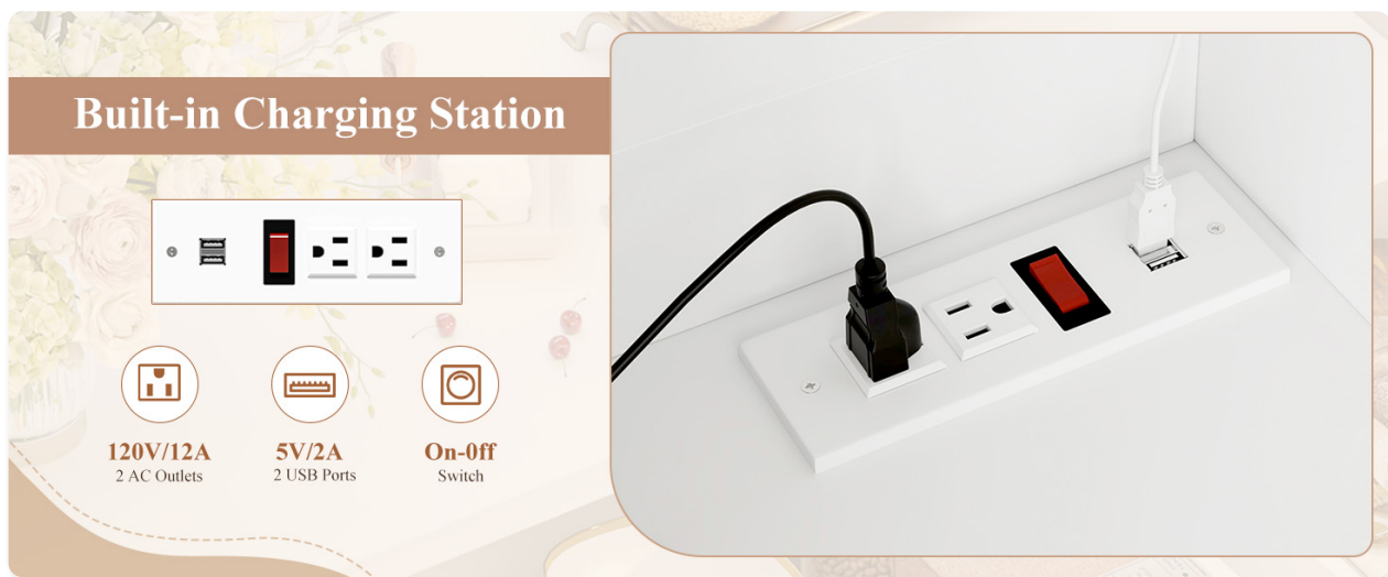
Image 4.3: Detailed view of the built-in charging station, featuring two AC outlets and two USB ports with an on/off switch.