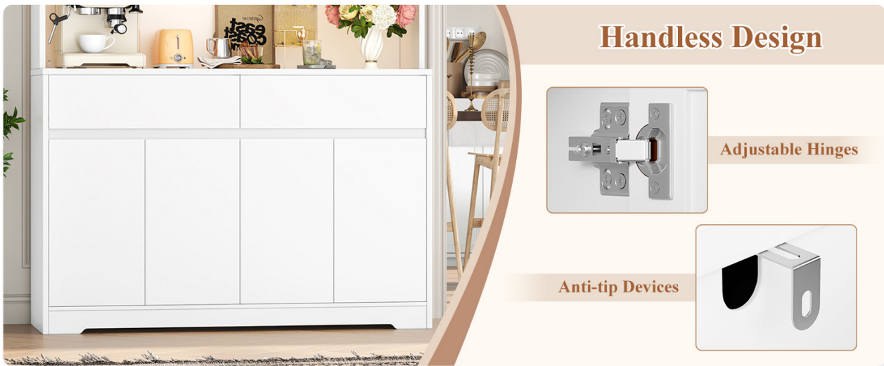
Image 2.1: Illustration of the anti-tip device and adjustable hinges, highlighting key safety and functional components.