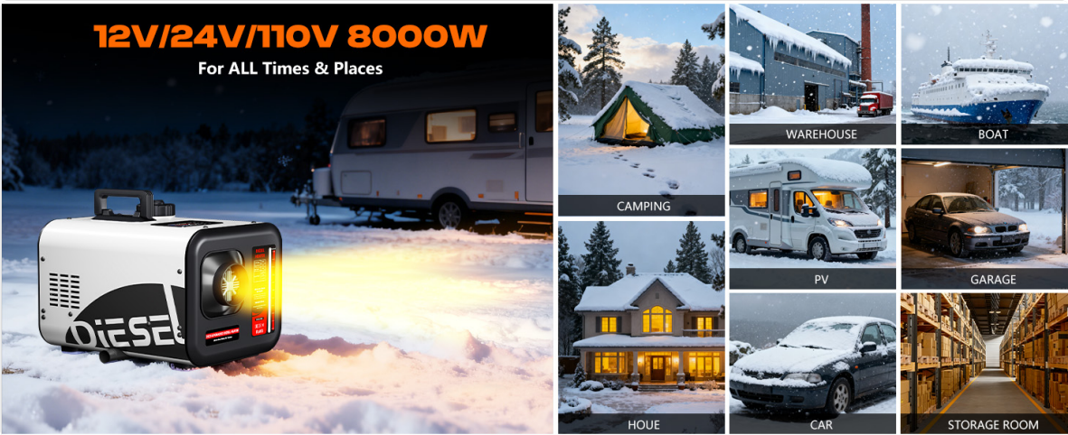
Figure 10: The robust design ensures the heater is resistant to rain and snow, suitable for outdoor use.

The heater features a rain/snow proof design, allowing for outdoor placement.