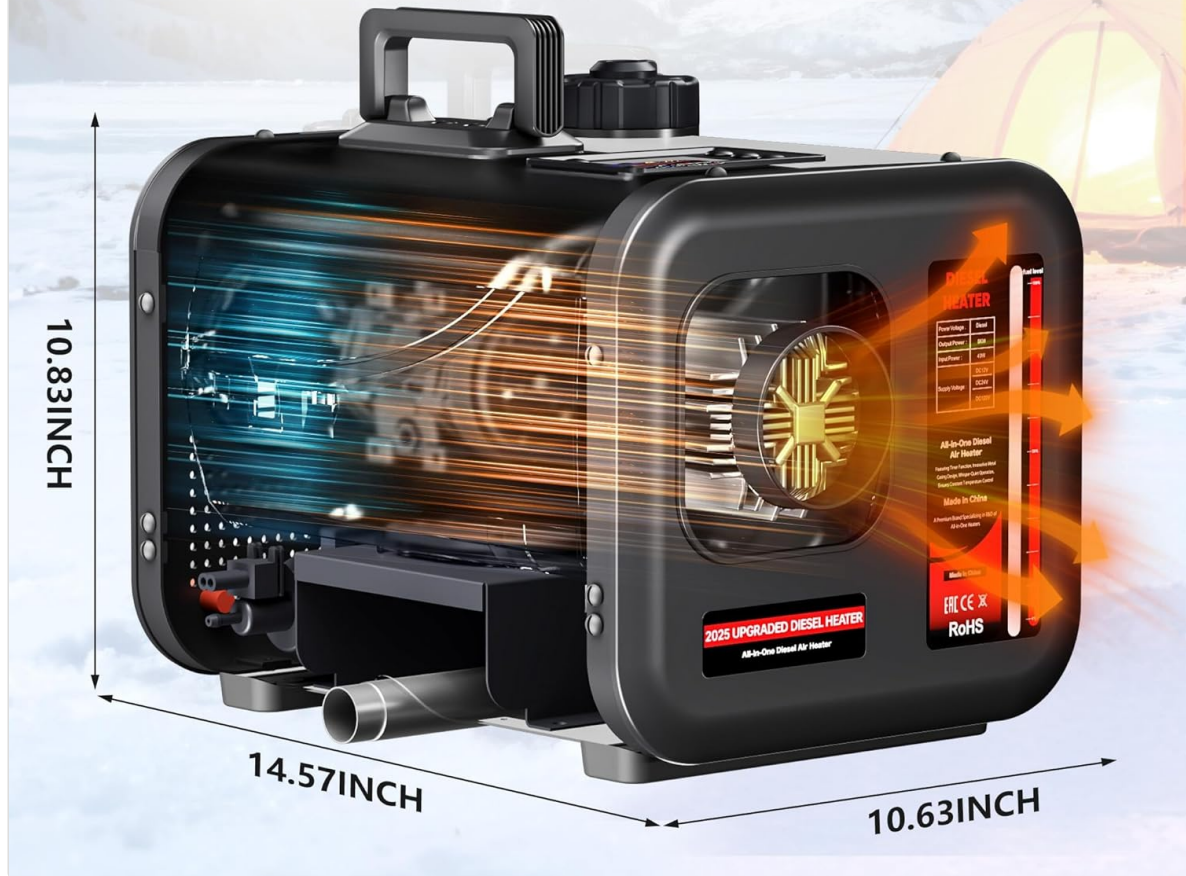
Figure 3: Diagram illustrating the heating mechanism, with cold air drawn in and heated air expelled from the outlet.

Cold air is drawn in through the air inlet, flows past the heated aluminum body to be warmed, and then the heated air is expelled from the air outlet