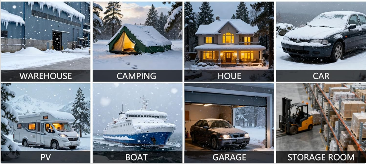
Figure 9: Examples of the heater's diverse applications, including recreational vehicles, homes, and workshops.