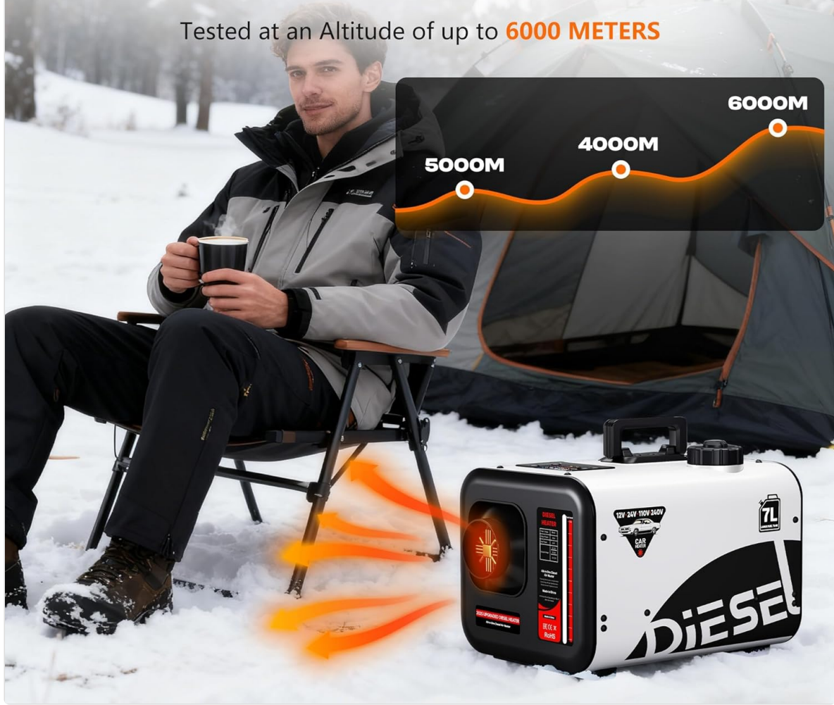
Figure 8: The heater maintains performance in low temperature or high altitude areas, tested up to 6000 meters.

Tested at an Altitude of up to 6000 METERS