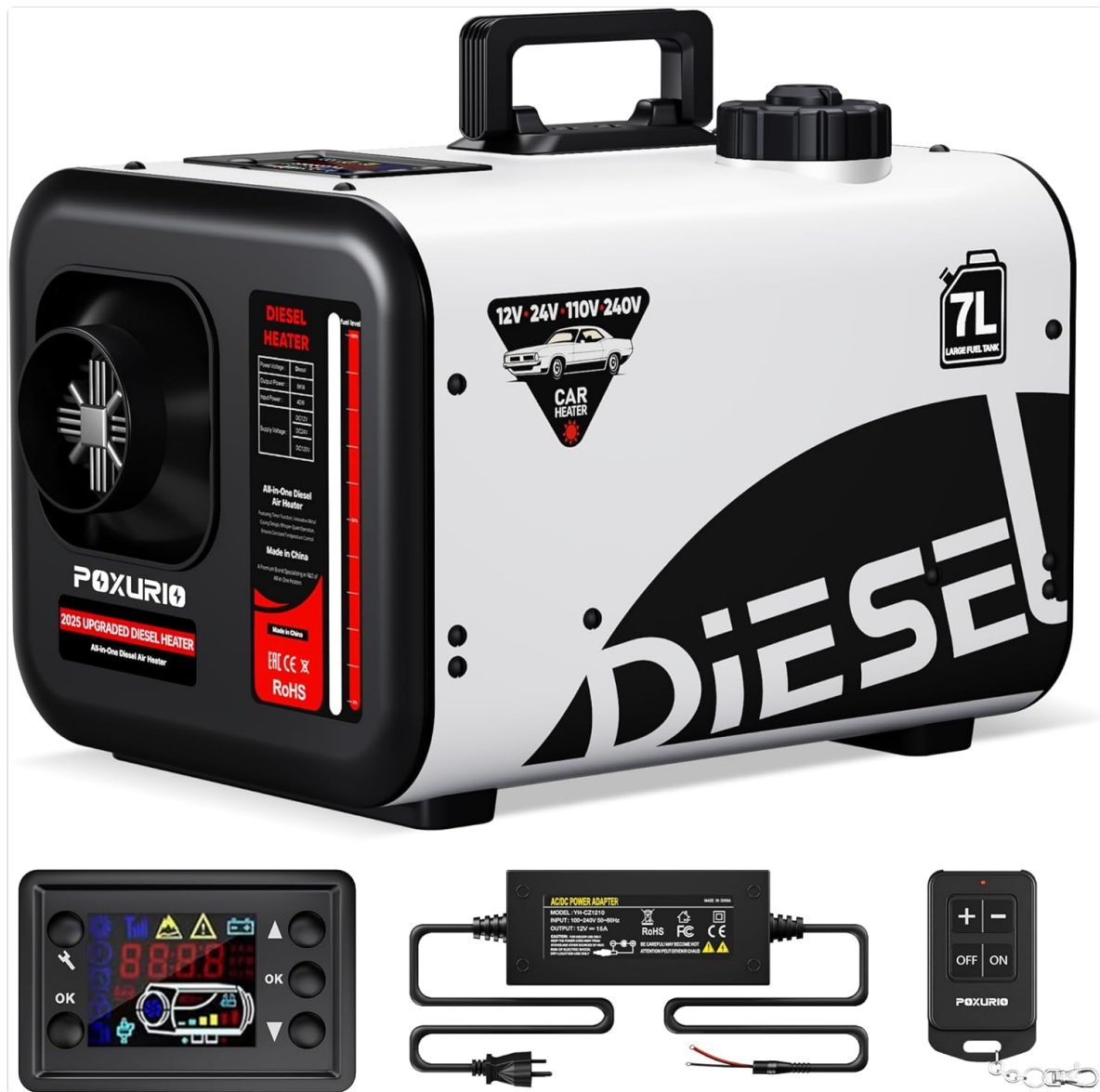
Figure 2: The 7L large capacity fuel tank ensures extended operation.