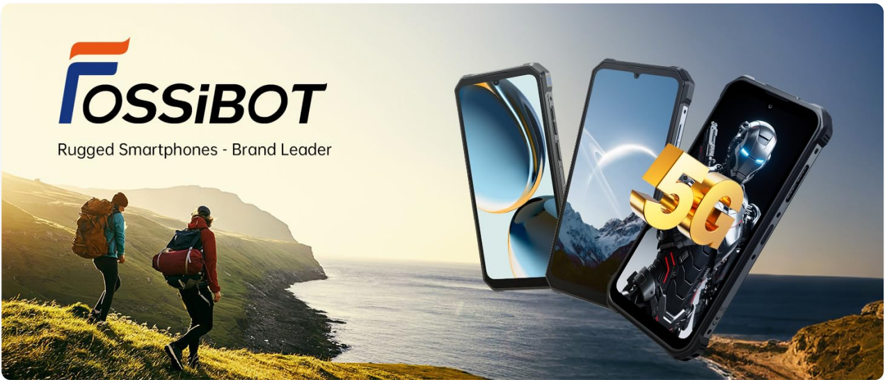
Image: The FOSSIBOT DT3 displaying the Android 15 interface with various applications.