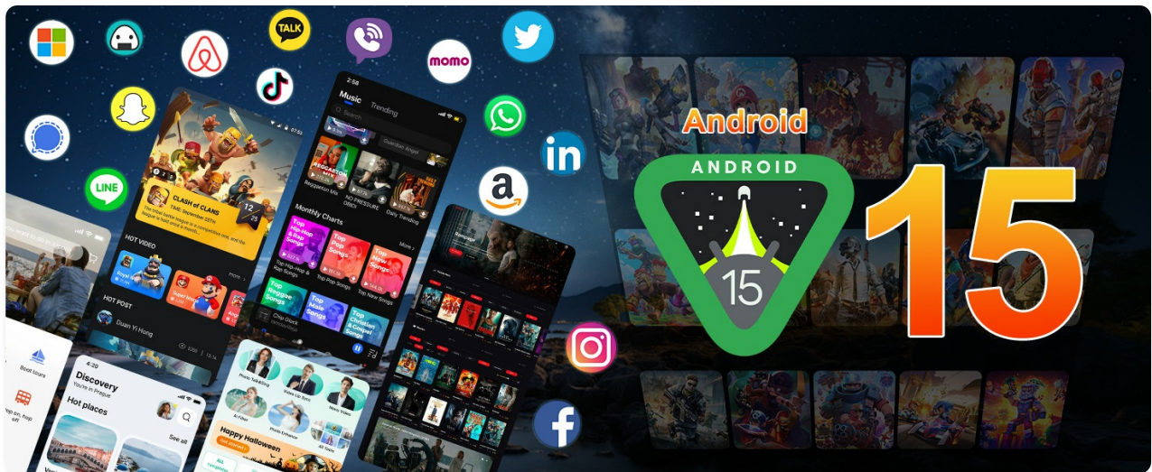
Image: The FOSSIBOT DT3 displaying vibrant content on its 10.4-inch 2K IPS screen.

The FOSSIBOT DT3 features a brilliant 10.4-inch 2K scratch-resistant IPS display, optimized for outdoor visibility. Enjoy crisp visuals with a 1200x2000 MP resolution.