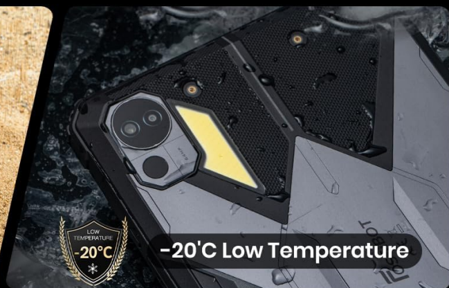
Image: Close-up of the rear of the FOSSIBOT DT3, highlighting the 64MP main camera and the 1W camp light.