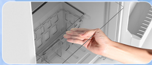
Removable Glass Shelves