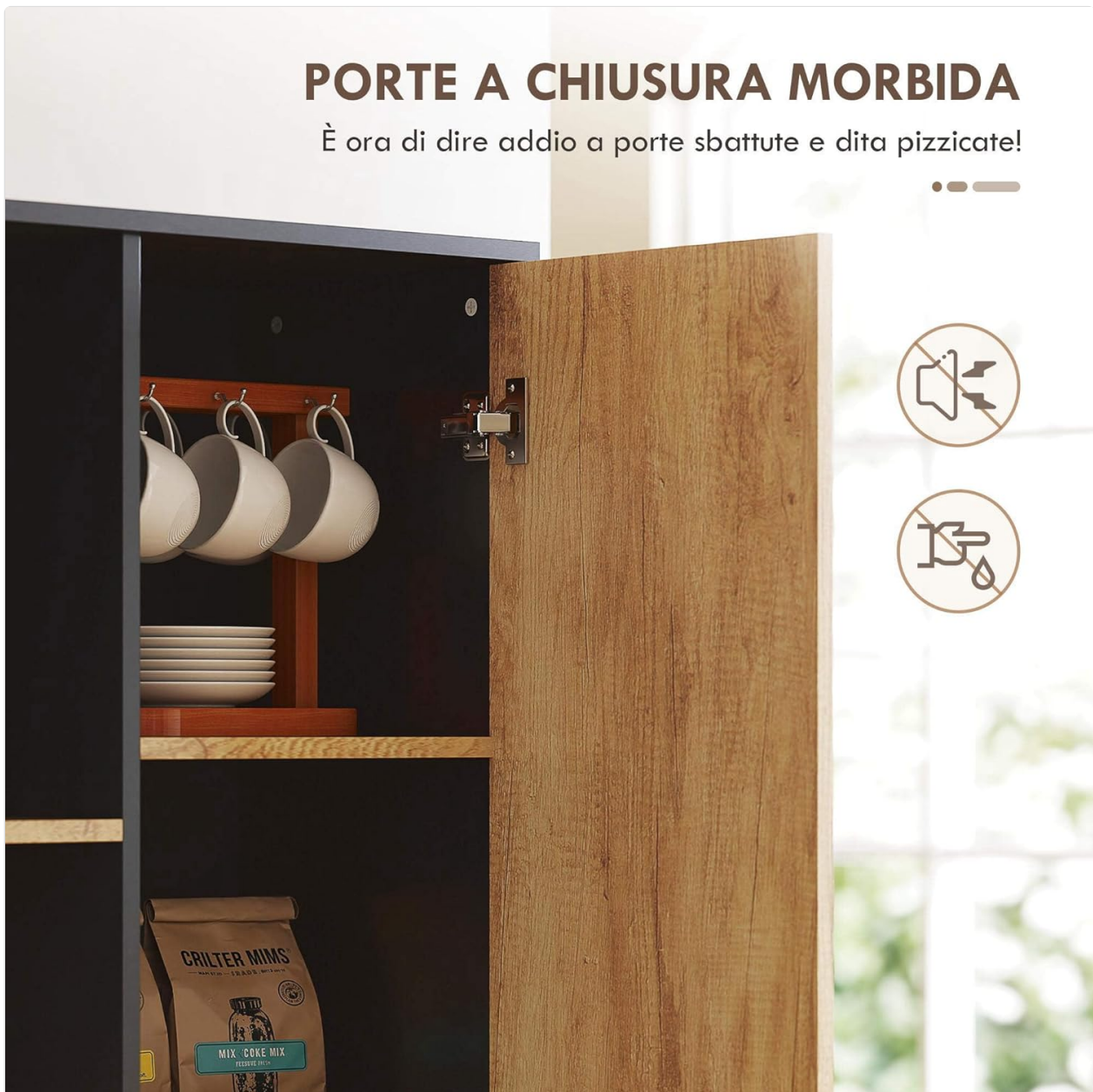
Image: The sideboard displaying its various storage options, including open shelves for a coffee machine and toaster, and closed compartments for dishes and pantry items.