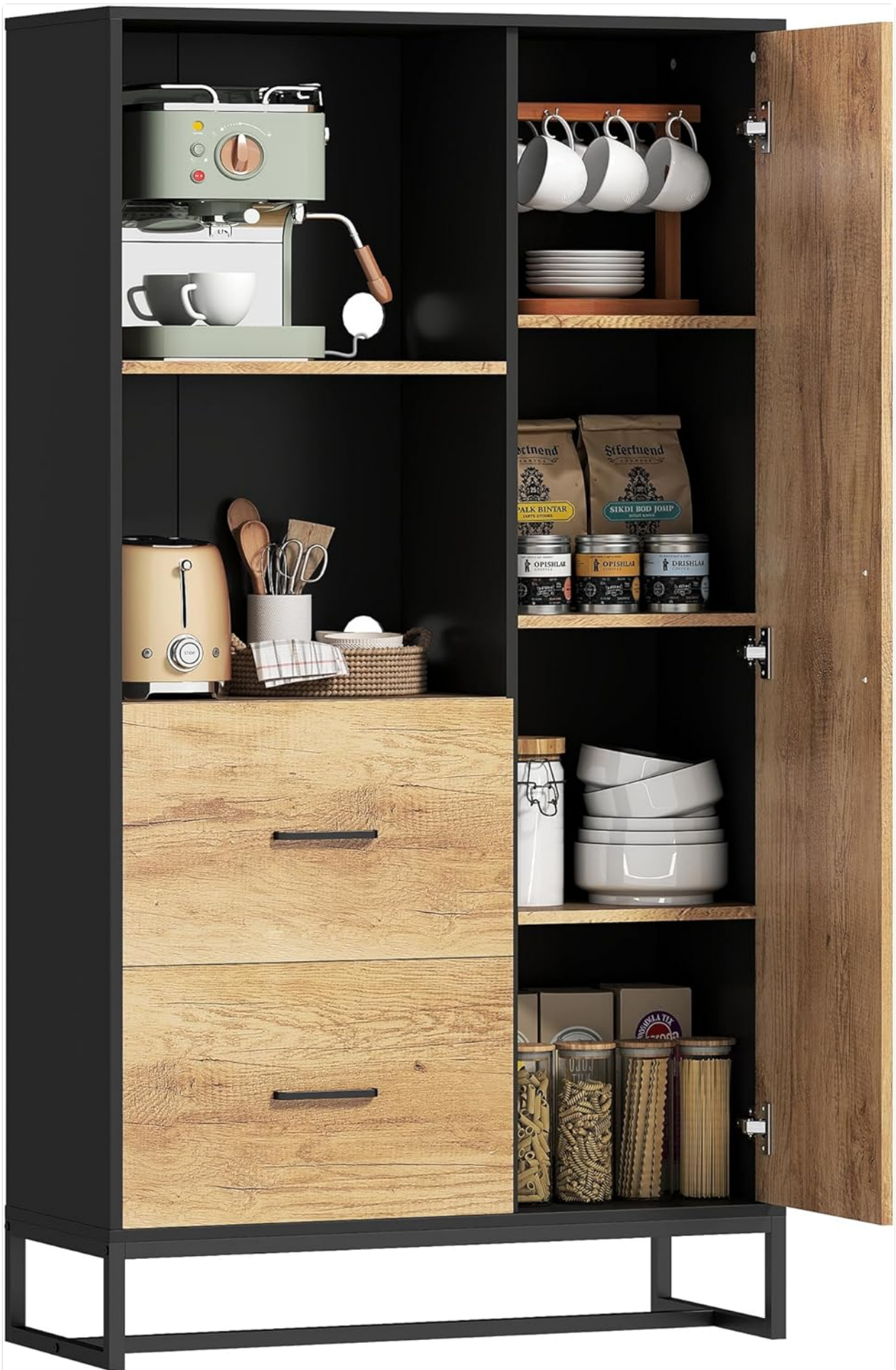
Image: Front view of the HOMCOM Kitchen Sideboard Cabinet, showcasing its black and wood finish with open shelves, drawers, and a closed cabinet.