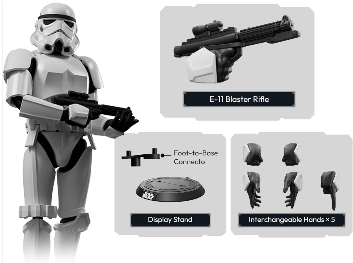
Image 3.2: Close-up of the E-11 Blaster Rifle, interchangeable hands, and display stand.