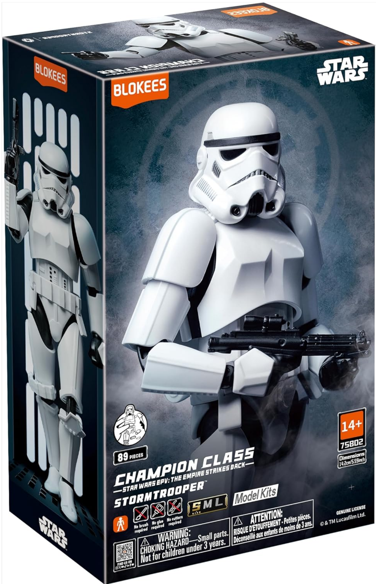
Image 1.1: Packaging of the BLOKEES Star Wars Champion Class Stormtrooper Model Kit 75802.