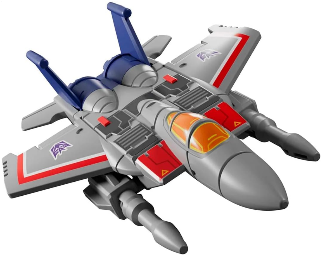
Figure 4: Example of a BLOKEES figure in an alternate vehicle mode.