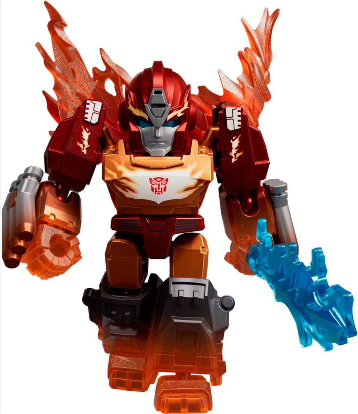
Figure 2: An example of a fully assembled BLOKEES figure.

Assembly is required for your BLOKEES figure. Carefully open the package and identify all components. Follow the included instructions sheet to connect the articulated parts and form your Transformer figure. Ensure all connections are secure but avoid excessive force.