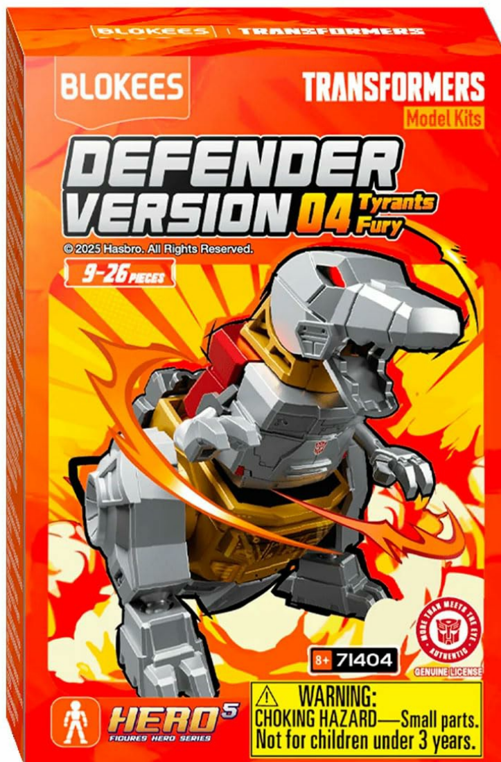
Figure 1: Example of an assembled BLOKEES Transformers Defender Version 04 figure.