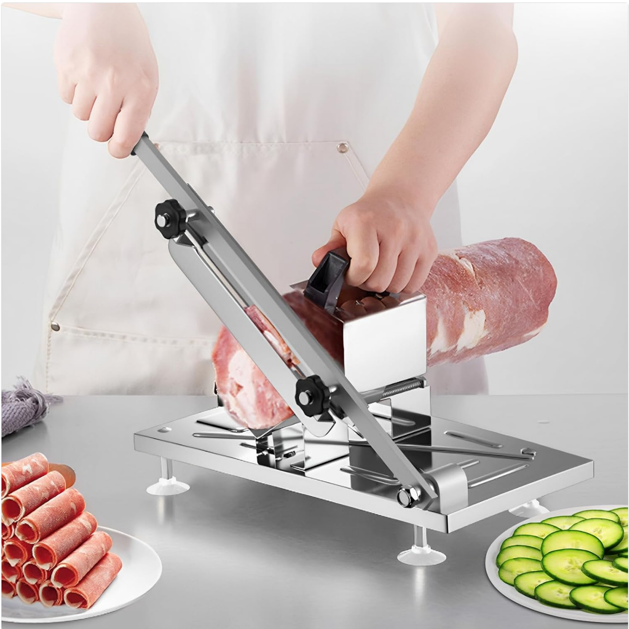
Image: A user operating the manual meat slicer, demonstrating the slicing motion with a large cut of frozen meat. Plates of thinly sliced meat rolls and cucumbers are visible, showcasing the slicer's output.