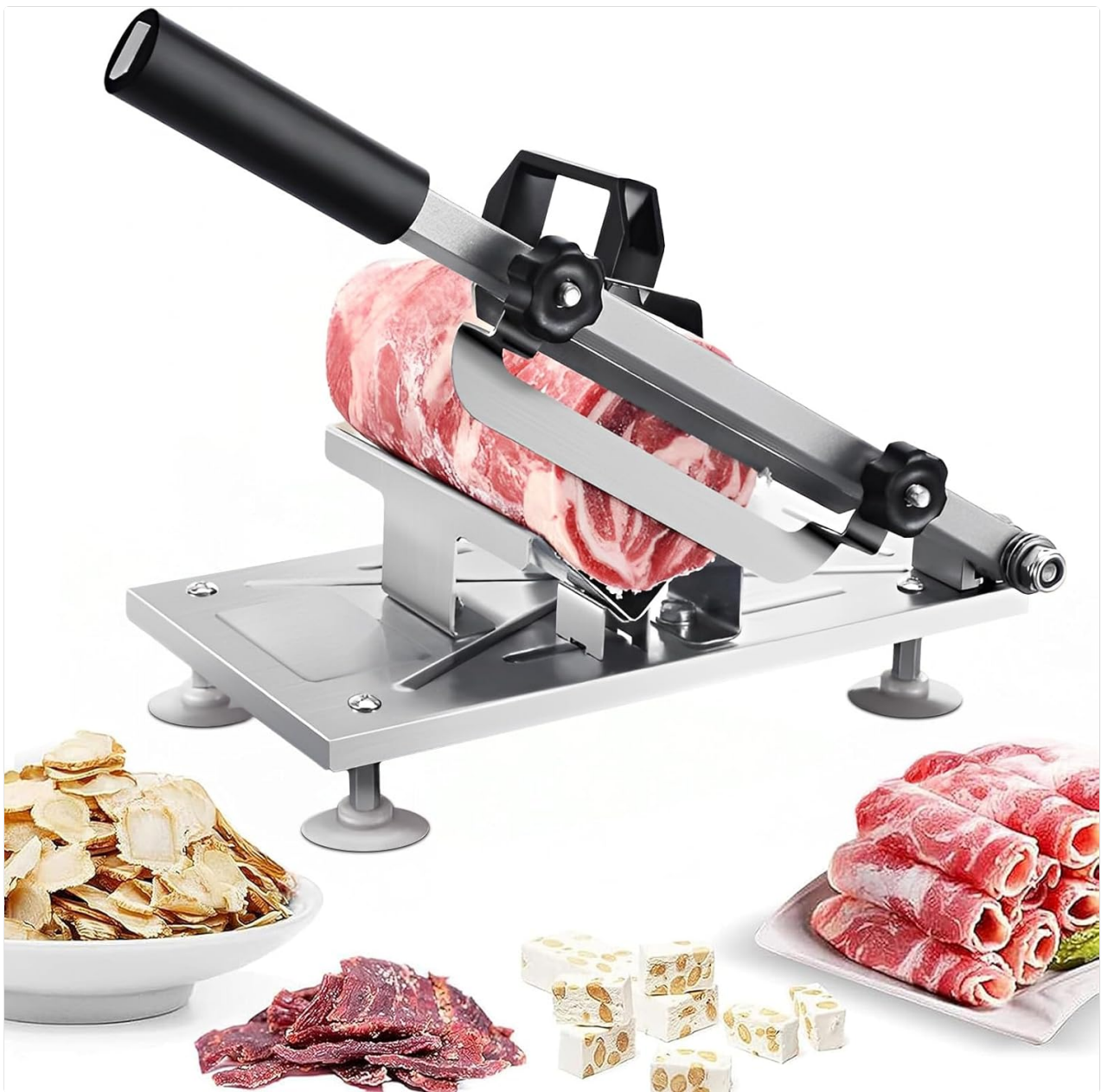
Image: The slicer displayed with a variety of prepared foods, including thinly sliced ginseng, beef jerky, nougat pieces, and neatly rolled frozen meat slices, demonstrating its wide range of applications.