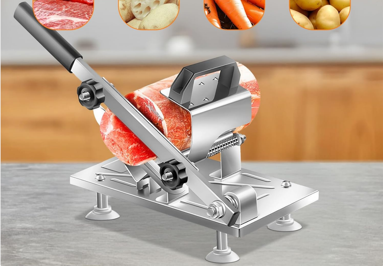
Image: The slicer base with its four suction cup feet securely holding it to a surface, ensuring stability during use.