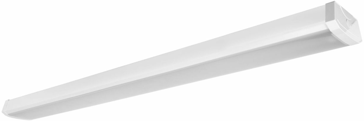
Image: Key specifications of the Luminus LED Wrap Light, detailing its 4600 lumens brightness, 40W energy consumption, selectable color temperatures (4000K, 5000K, 6500K), 50,000-hour lifespan, and non-dimmable feature.