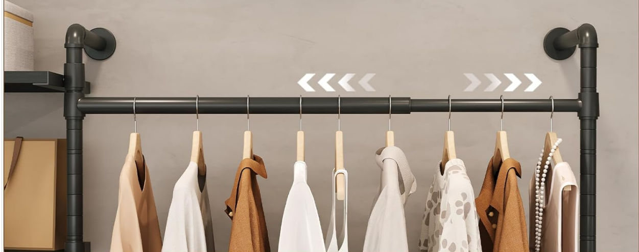
Image 5.1: Visual comparison of a telescopic rod's capacity before and after extension, illustrating how it can hold more garments.