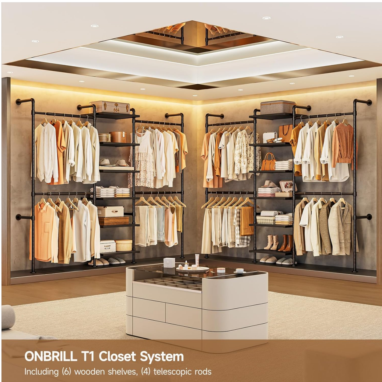
Image 1.1: The ONBRILL T1 Wall Mounted Closet System installed in a room, demonstrating its capacity for clothes and various items.