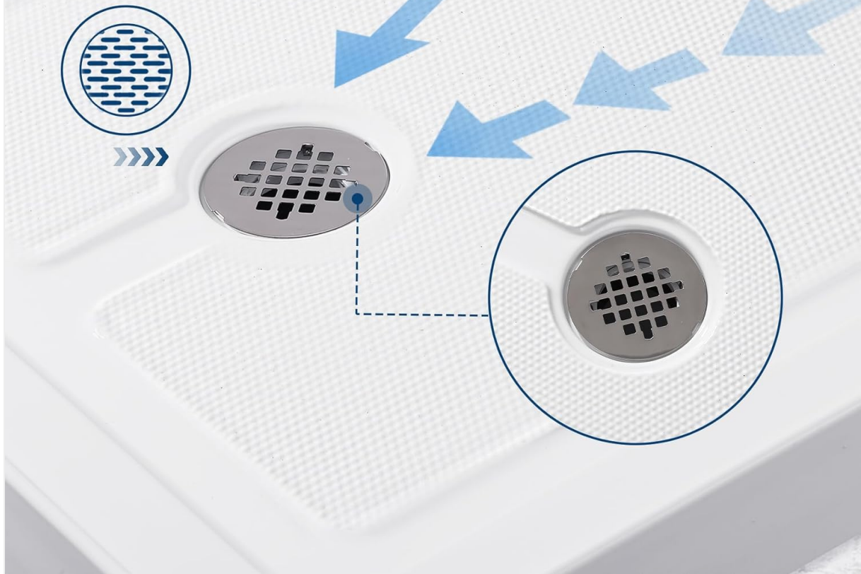
Figure 3: Non-Slip Texture Detail. This image provides a close view of the textured surface designed for enhanced safety.

Shower Base with Drain strainer We have equipped you with Stainless Steel Strainer