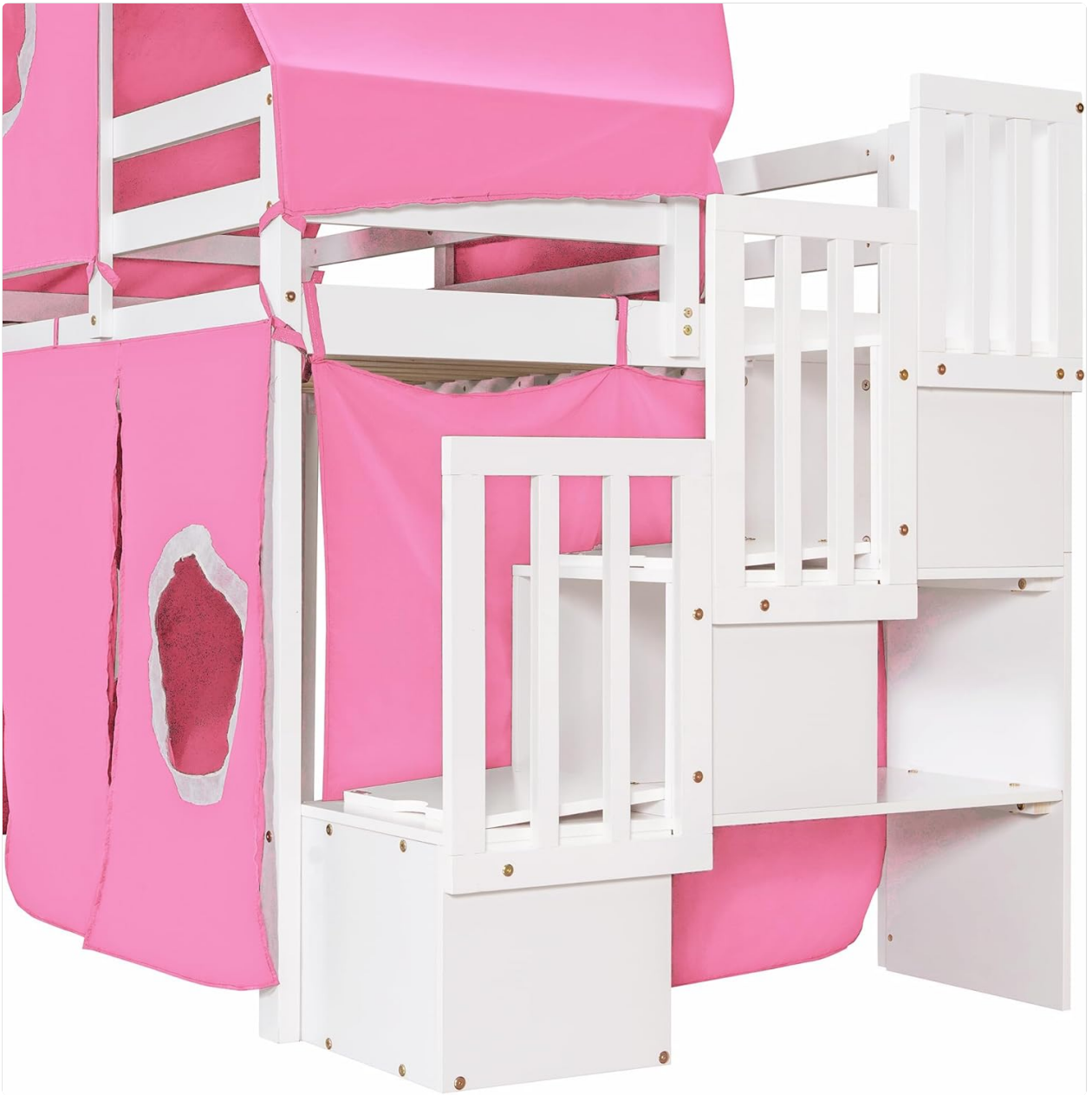
Image 3: Detail of the staircase unit, highlighting the storage compartments.