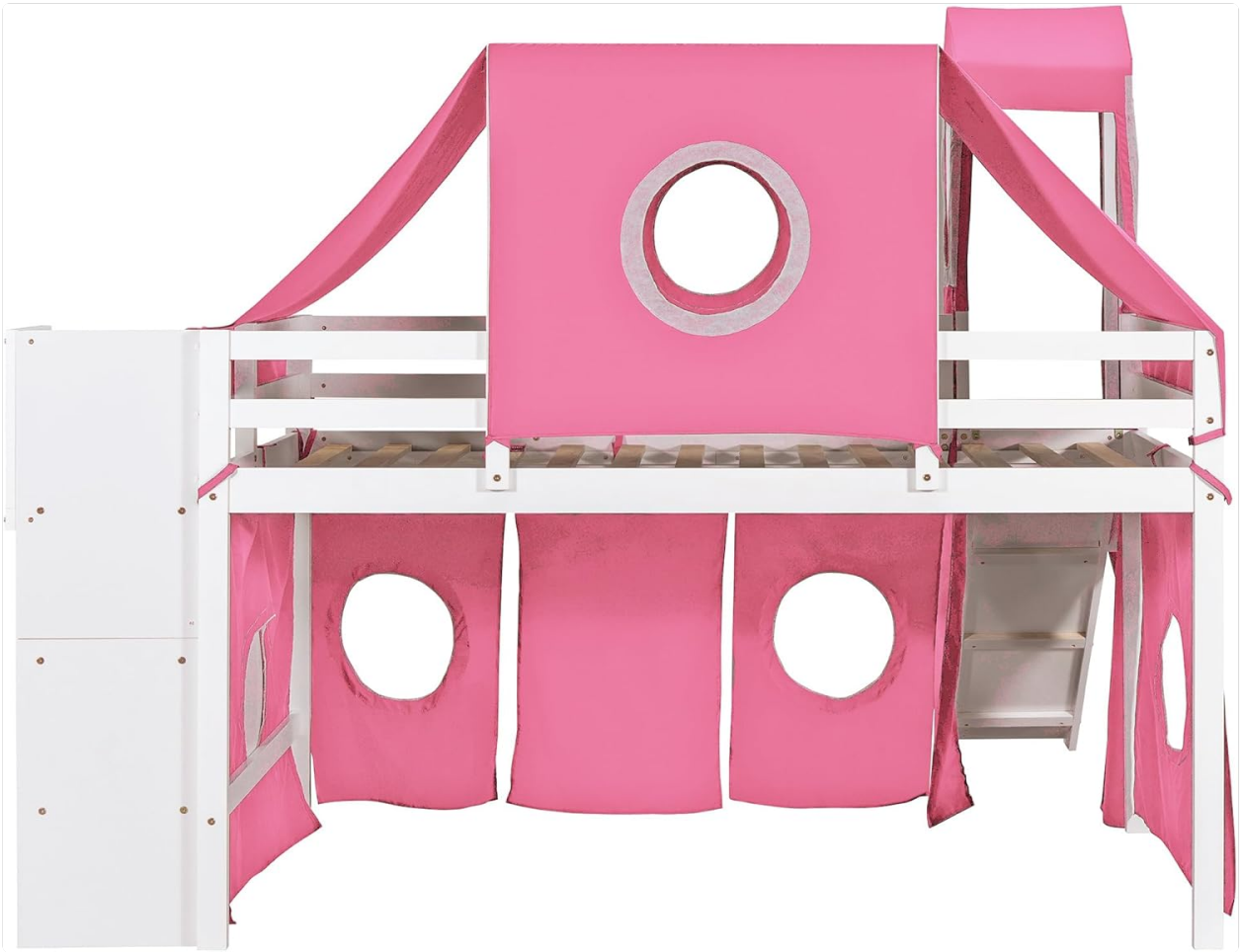
Image 2: Front view of the assembled bed frame, illustrating the under-bed space.