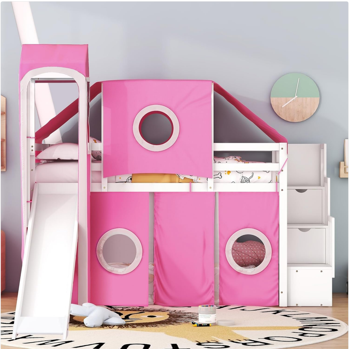
Image 1: The Linique Twin Size Castle Loft Bed with Pink Tent and Tower, showcasing its design within a bedroom environment.