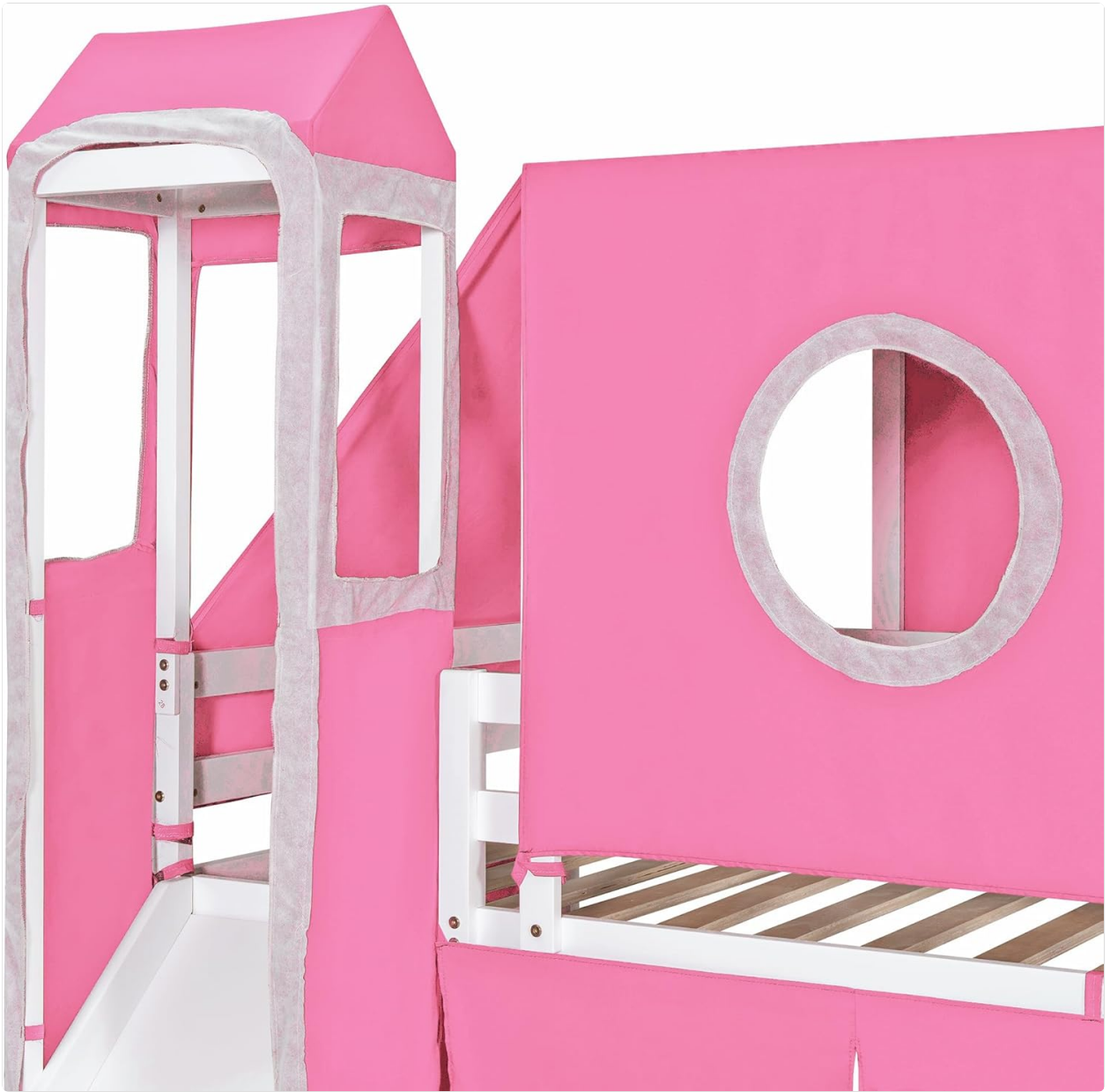
Image 5: Detail of the tent and tower fabric, showing attachment points and window design.