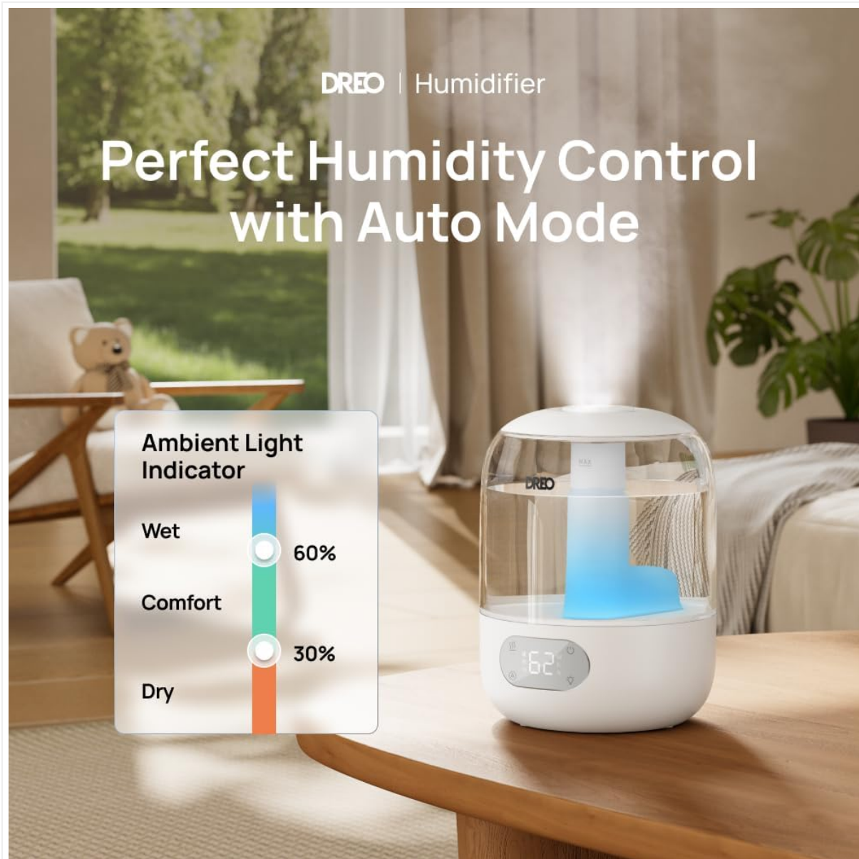
Figure 3: Control panel and ambient light indicator for humidity levels.

The Dreo HM-306 features a user-friendly touch control panel with a digital display.