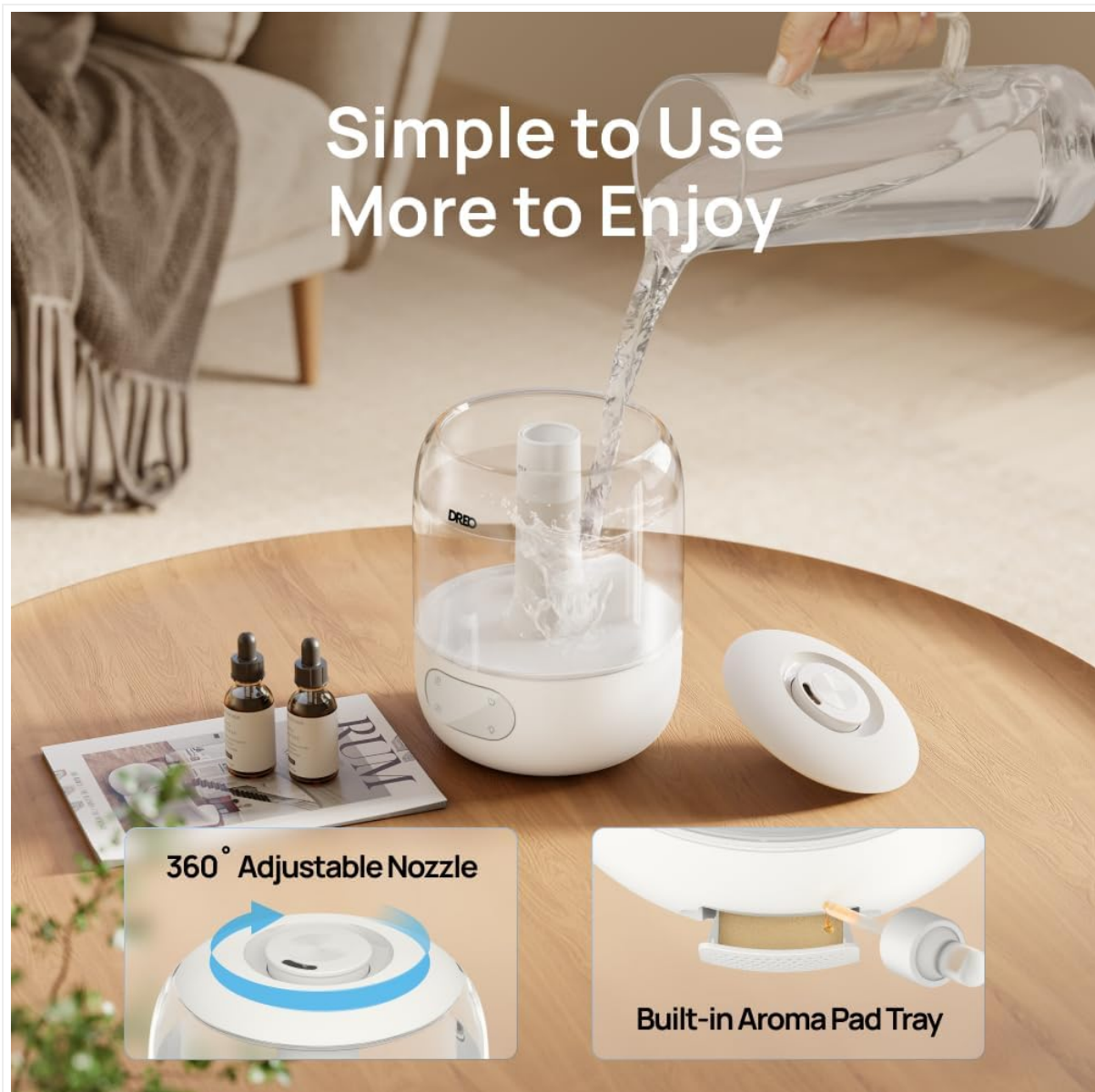
Figure 2: Illustrates the top-fill design and the aroma pad tray for essential oils.