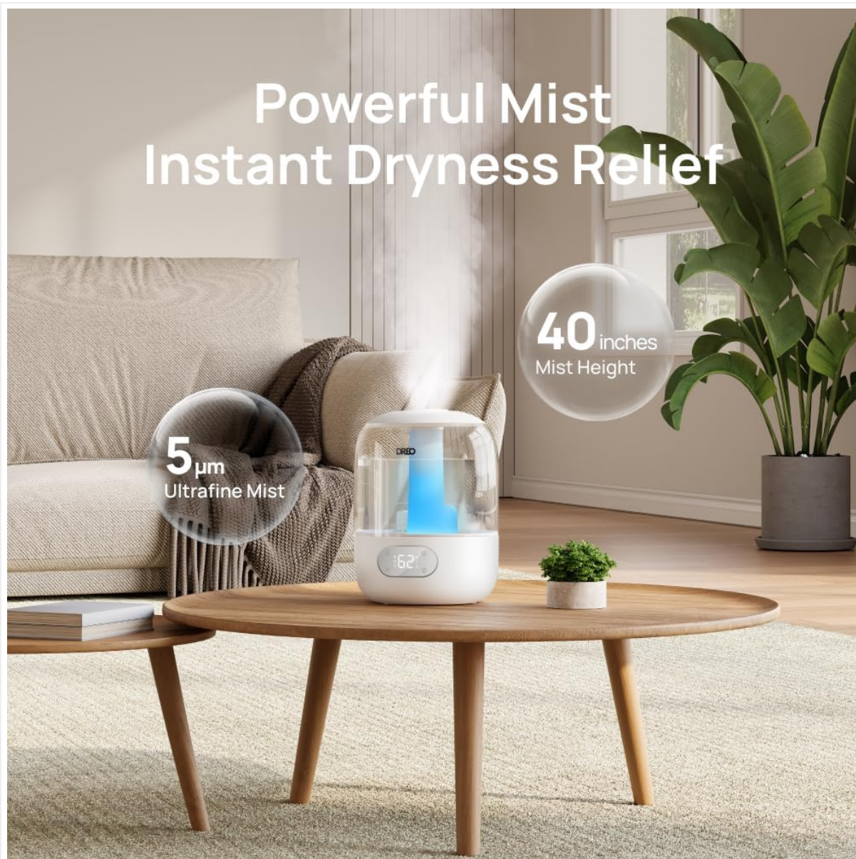
Figure 5: The humidifier projects mist up to 40 inches high for wide coverage.