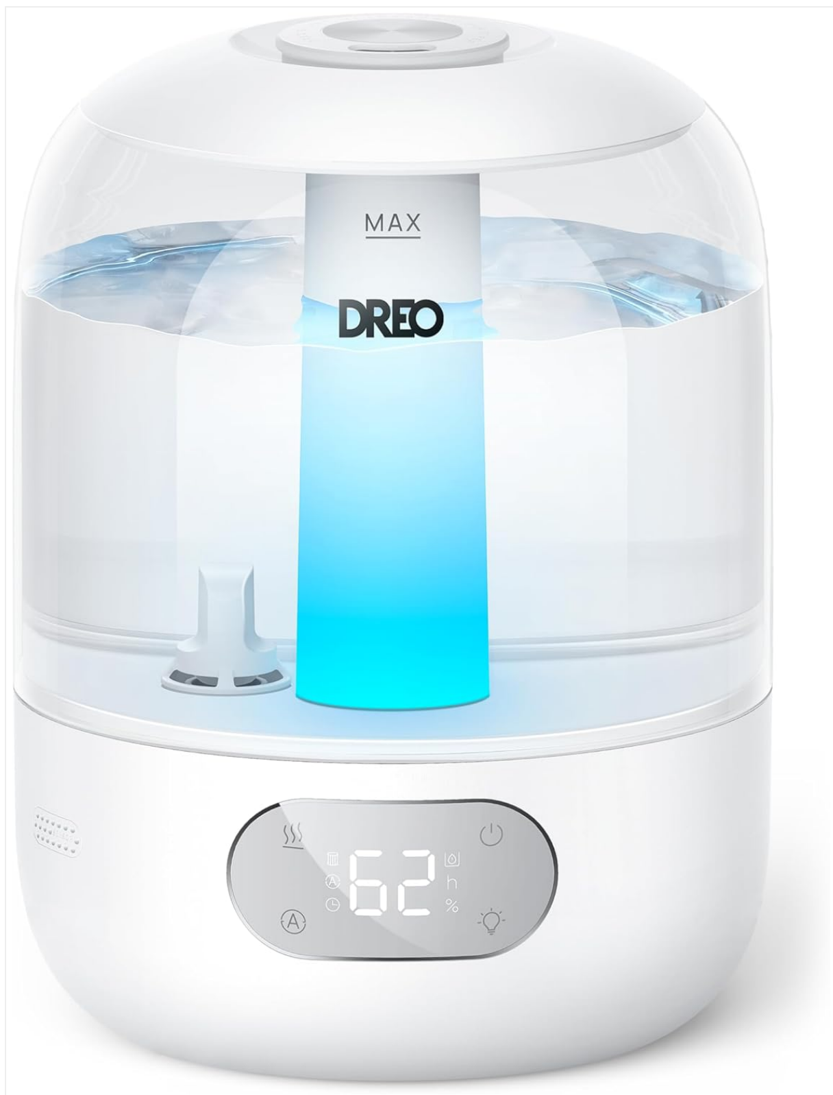
Figure 1: Main view of the Drezo HM-306 3L Top-Fill Cool Mist Ultrasonic Humidifier.