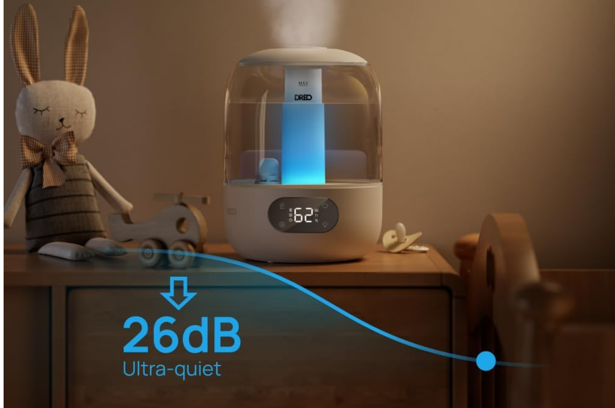
Figure 4: The humidifier operates quietly, making it suitable for bedrooms and nurseries.