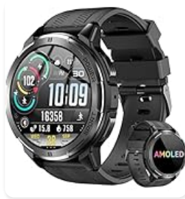
Image: The OUKITEL Smartwatch showcasing different menu styles and customizable watch faces, including options to use personal photos.

Personalize your smartwatch with over 100 built-in watch faces. You can also upload your favorite photos to create unique custom dials through the companion app. The watch supports 6 different menu styles.