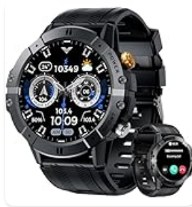
Image: A composite image showing the smartwatch interface for making/receiving calls, displaying app notifications, and interacting with the AI voice assistant.