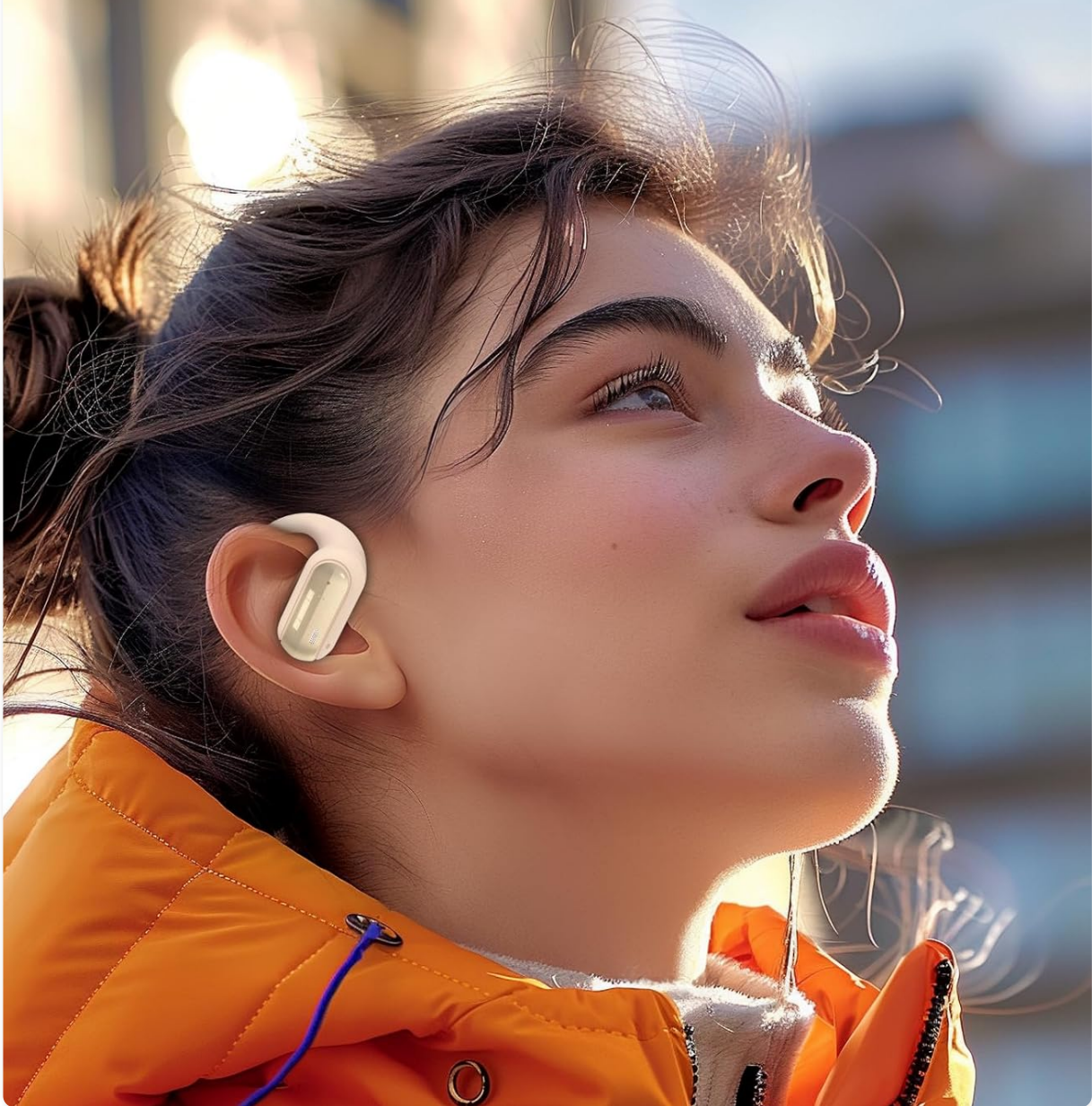
Image: Proper wearing of the open-ear headphones.