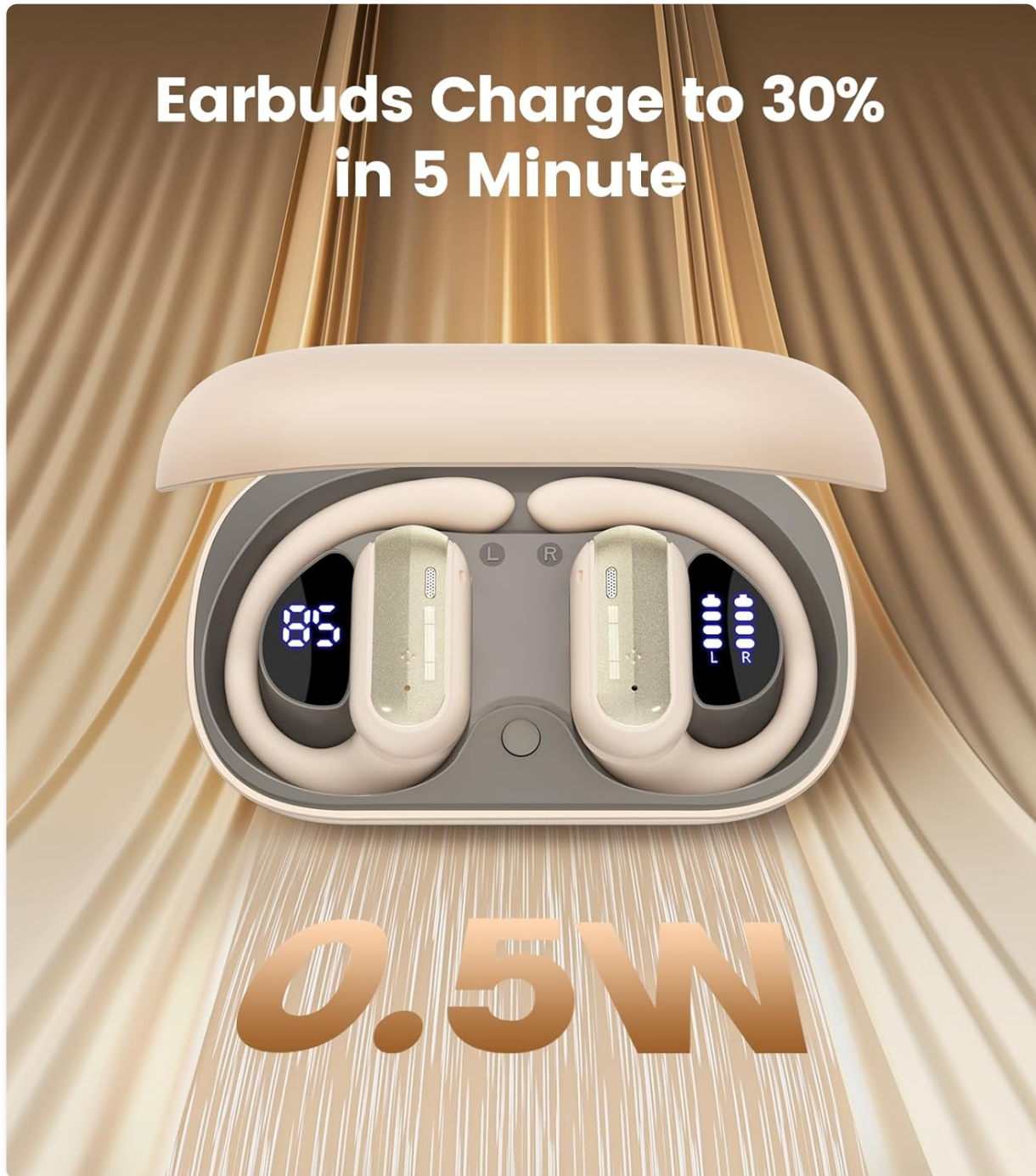
Image: Earbuds charging in their case, indicating fast charging capability.

Fast Charging: A 5-minute charge can provide approximately 3 hours of listening time.