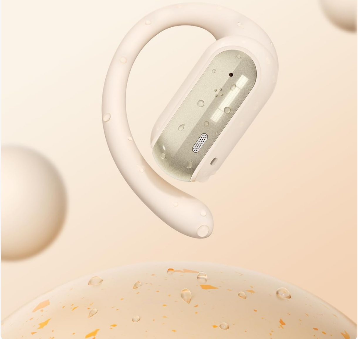
Image: Earbud demonstrating IPX7 water resistance.