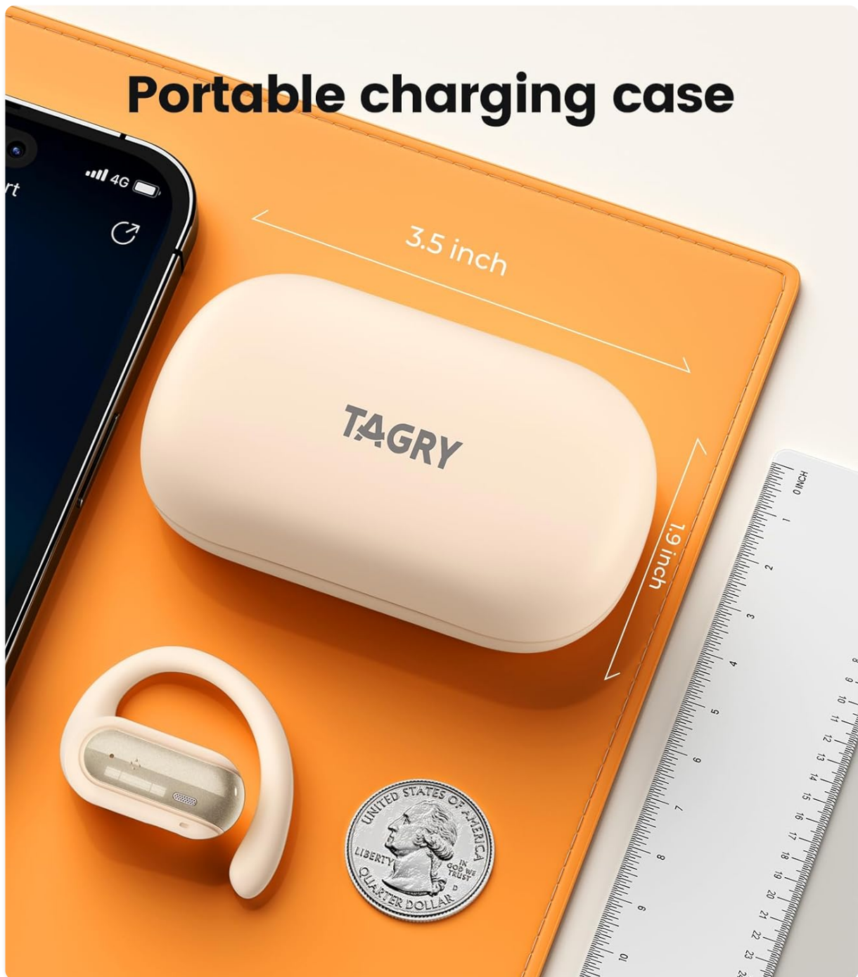
Image: Portable charging case dimensions.