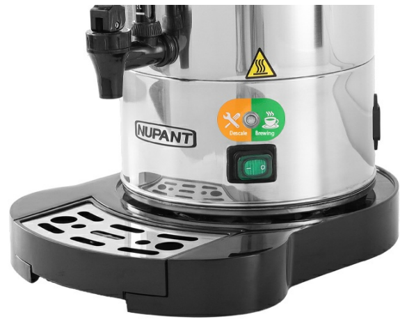
Image: Proper installation of the removable drip tray.