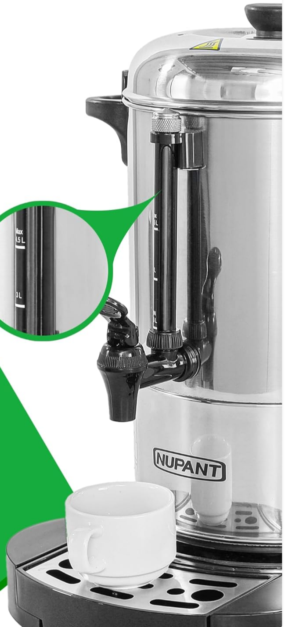
Image: Key functional components of the NUPANT Coffee Urn.

THE GREEN LIGHT INDICATES THAT THE COFFEE HAS BEEN EXTRACTED INDICATOR YELLOW INDICATES WATER SHORTAGE OR SCALE REMOVAL