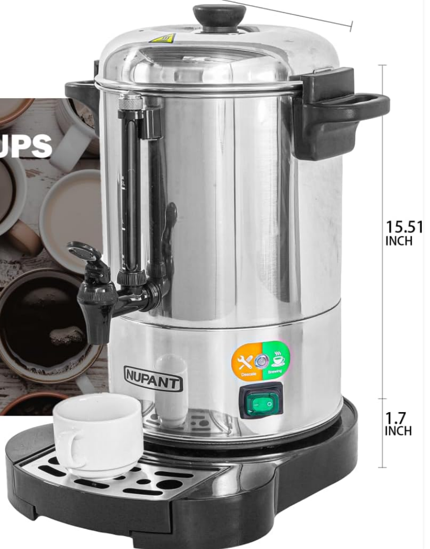
Image: Dimensions of the NUPANT 30-Cup Coffee Urn.