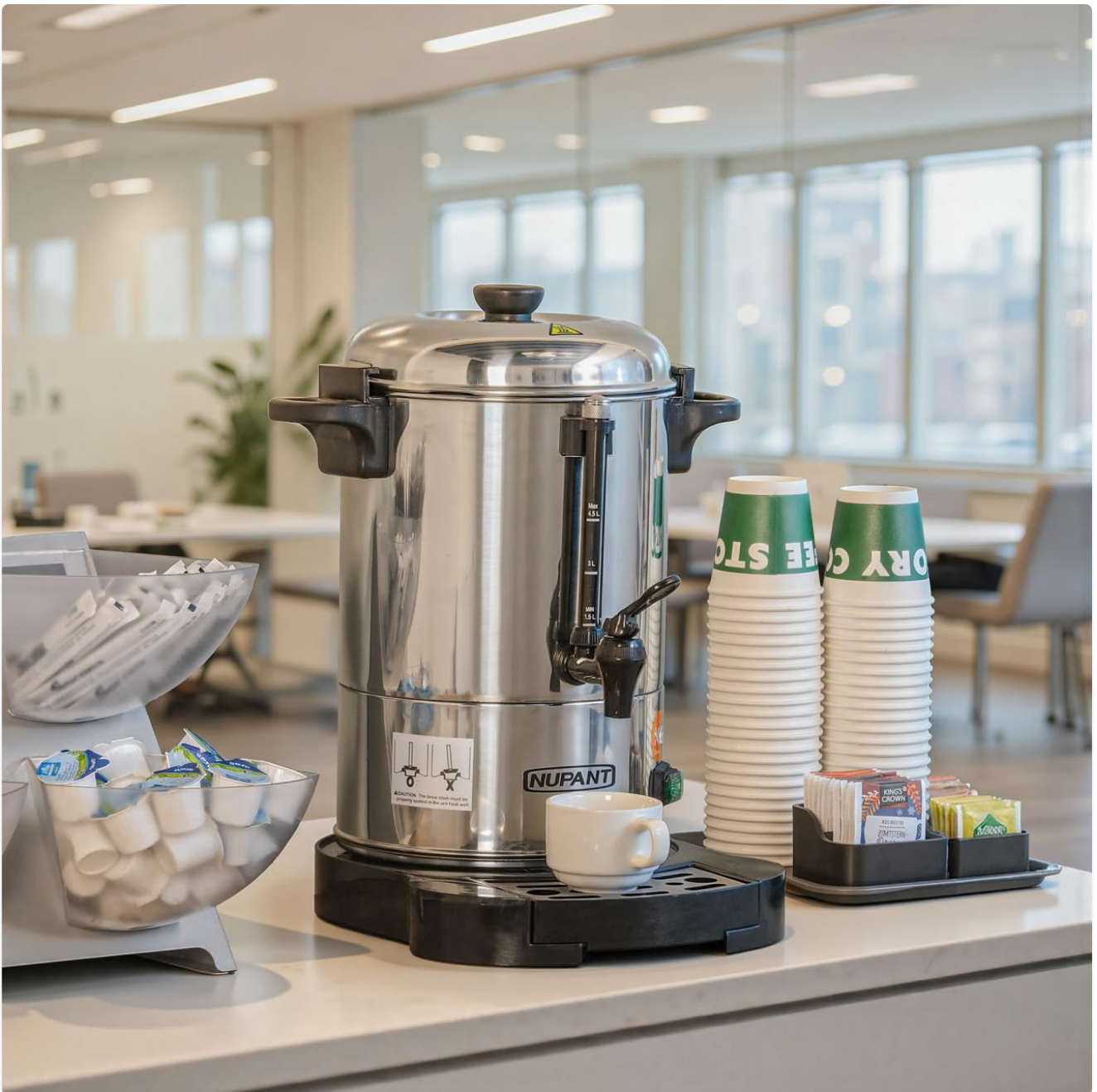
Image: NUPANT Commercial Coffee Urn (Model PC-225) in a typical office or catering environment.