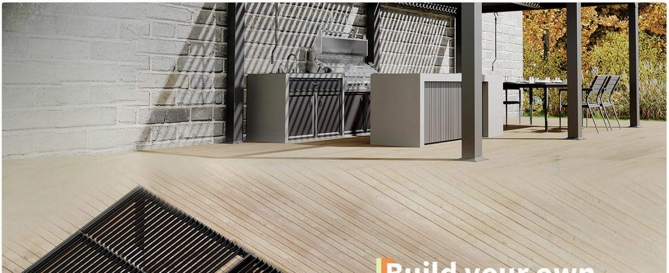
Image: Close-up of louvers in open and closed positions.