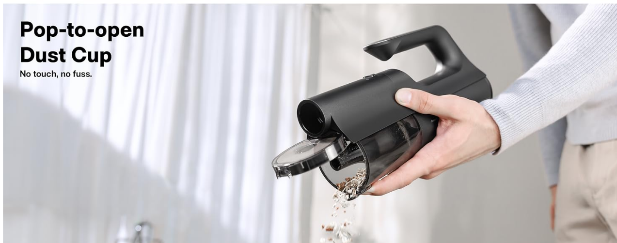
Image: The one-click pop-open dust cup allows for quick and touch-free emptying.