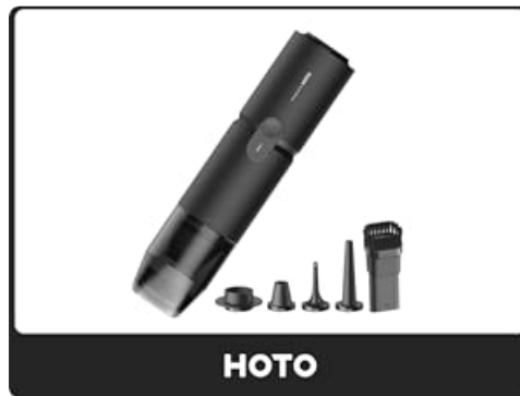
Image: The quadruple filtration system ensures thorough cleaning and can be easily disassembled for washing.