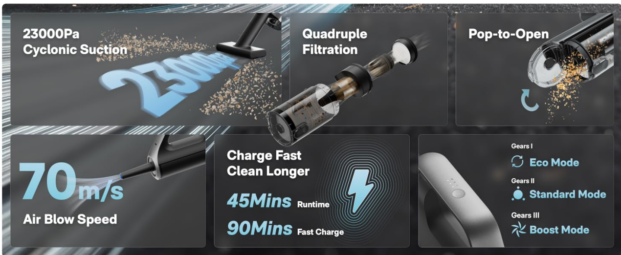
Image: The HOTO BlowVac functions as both a vacuum and a blower.

The HOTO BlowVac is a versatile 2-in-1 cordless handheld vacuum and electric compressed air duster. It features a powerful 225W brushless motor, 3 suction modes, and a quadruple filtration system for efficient cleaning in various environments.