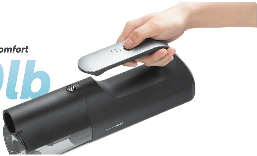
Image: The ergonomic handle and balanced 2.09-lb design ensure comfortable one-handed use.