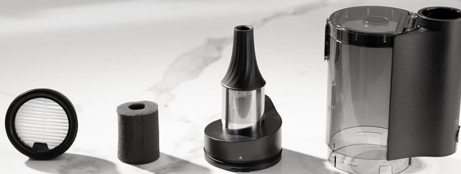
Image: Maintenance tips for cleaning the dust cup and filters to ensure optimal performance.

03.It is recommended that the filter and sponge be replaced every 3 months.