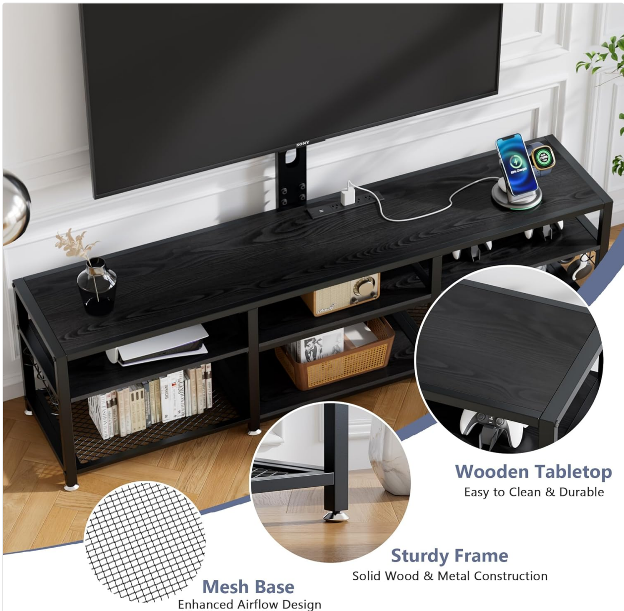
Image: A close-up view of the VECELO TV Stand's construction, emphasizing the easy-to-clean wooden tabletop, solid wood and metal frame, and enhanced airflow mesh base.