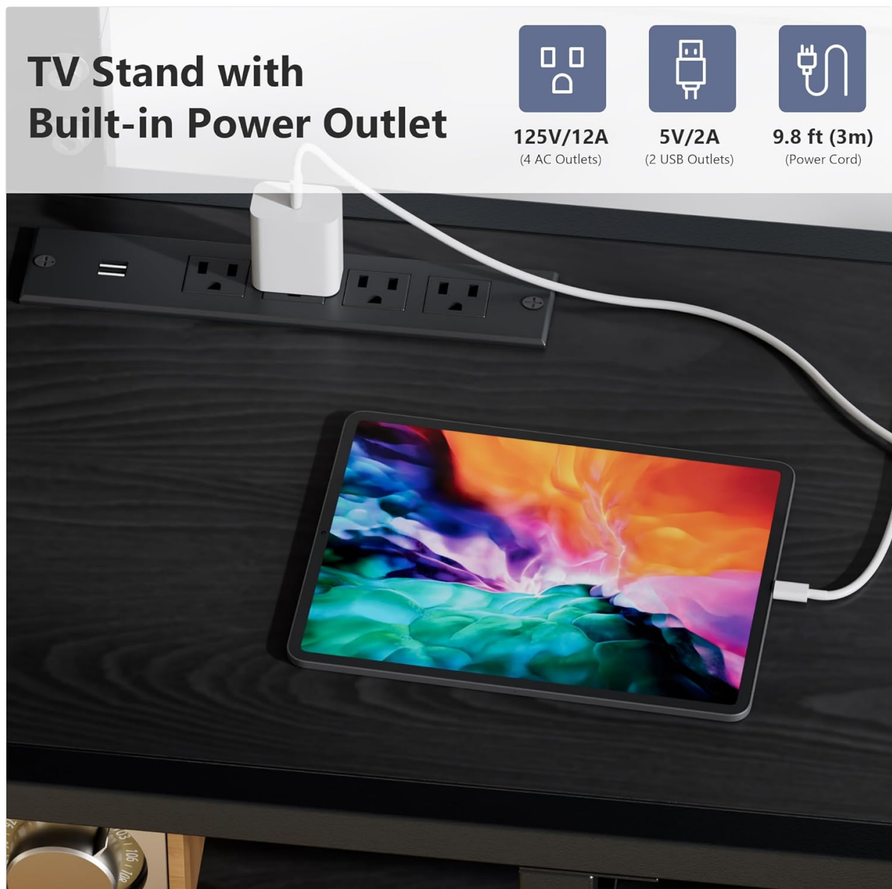
Image: A detailed view of the built-in power strip, featuring four AC outlets and two USB ports for convenient