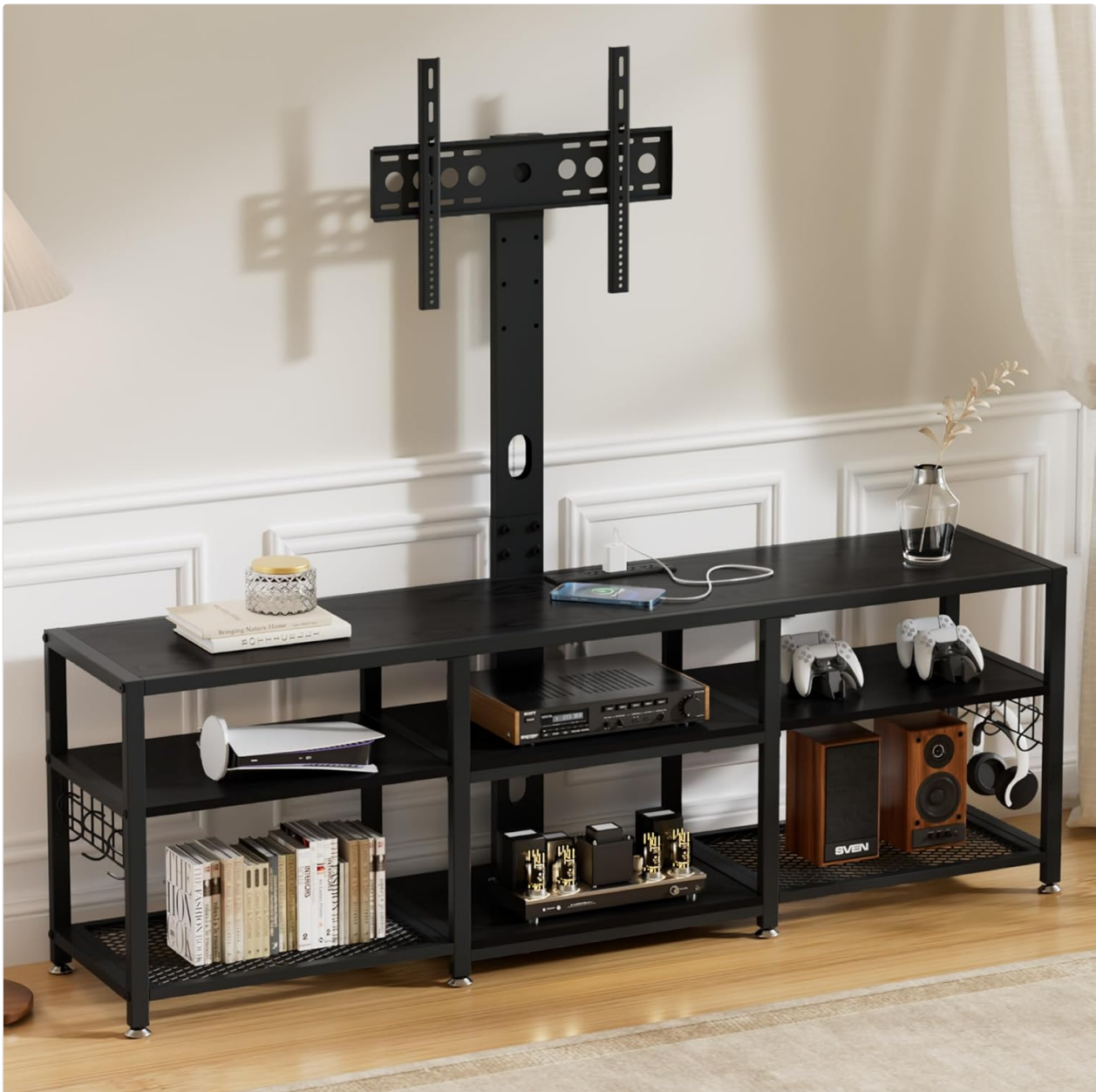
Image: The fully assembled VECELO TV Stand, showcasing the TV mount, multiple storage shelves, and the integrated power strip.

Note: TV mounting hardware (screws for attaching brackets to TV) is not included. Please ensure you