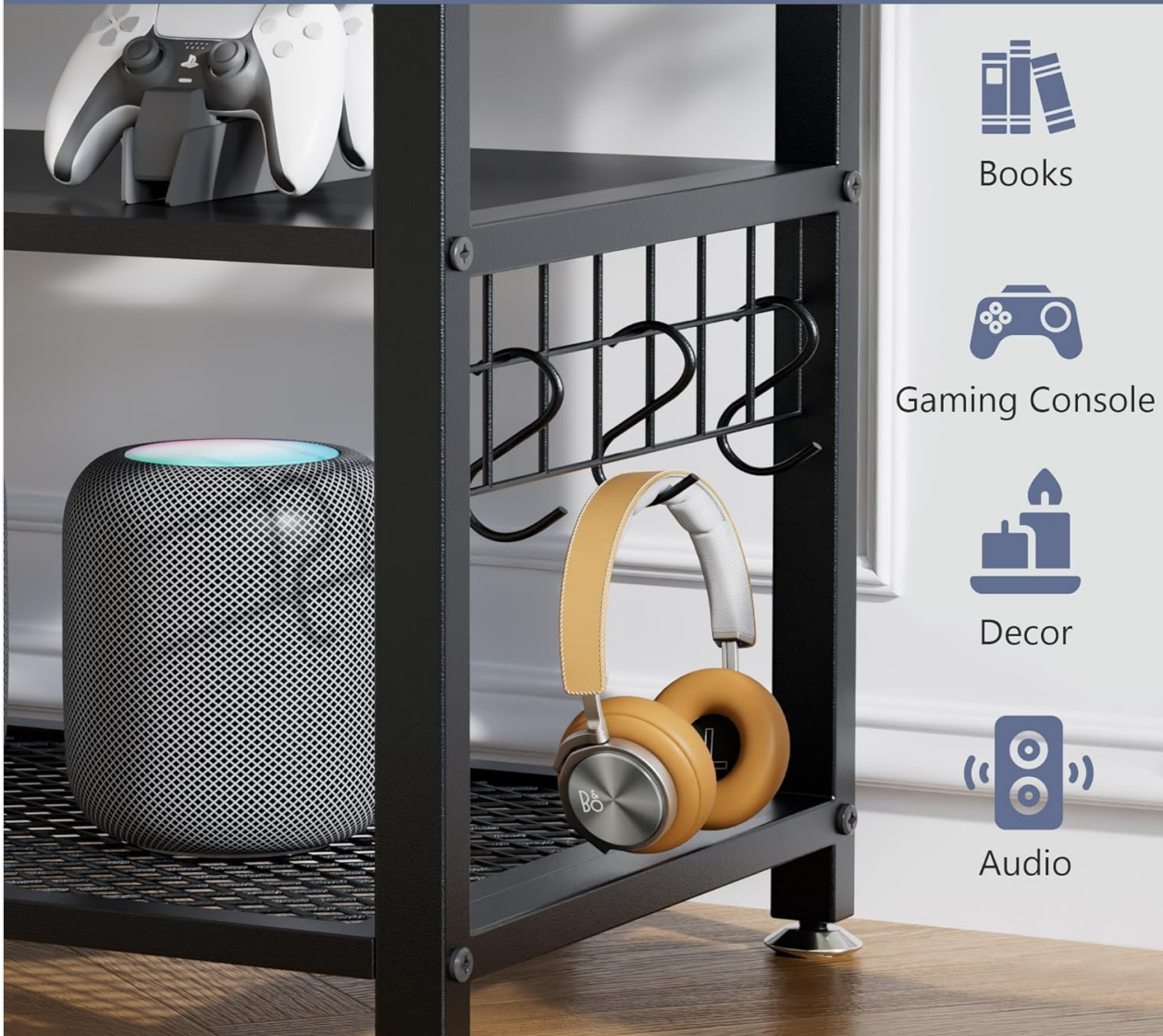
Image: The side storage area of the TV stand, featuring mesh shelves and convenient S-hooks for organizing items like headphones or gaming controllers.