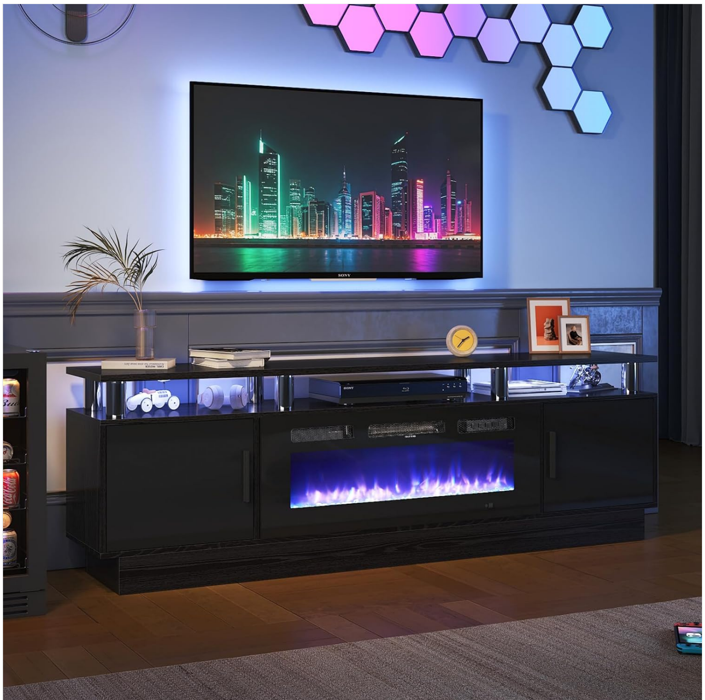
Image 7: The Aoxun TV stand illuminated with blue LED lights and matching blue electric fireplace flames, demonstrating the customizable ambient lighting feature.