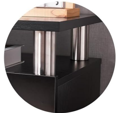
Stainless Steel Bracket much more storage space