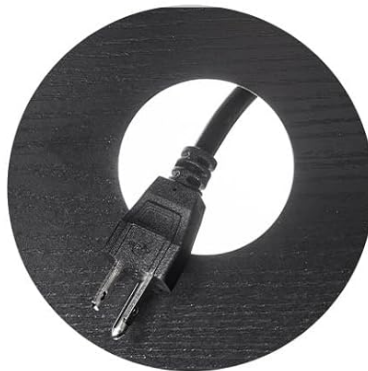
Cable Management Hole keep clean & tidy