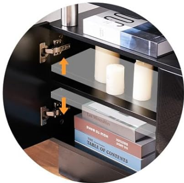
Storage Cabinet with shelves & hinged doors