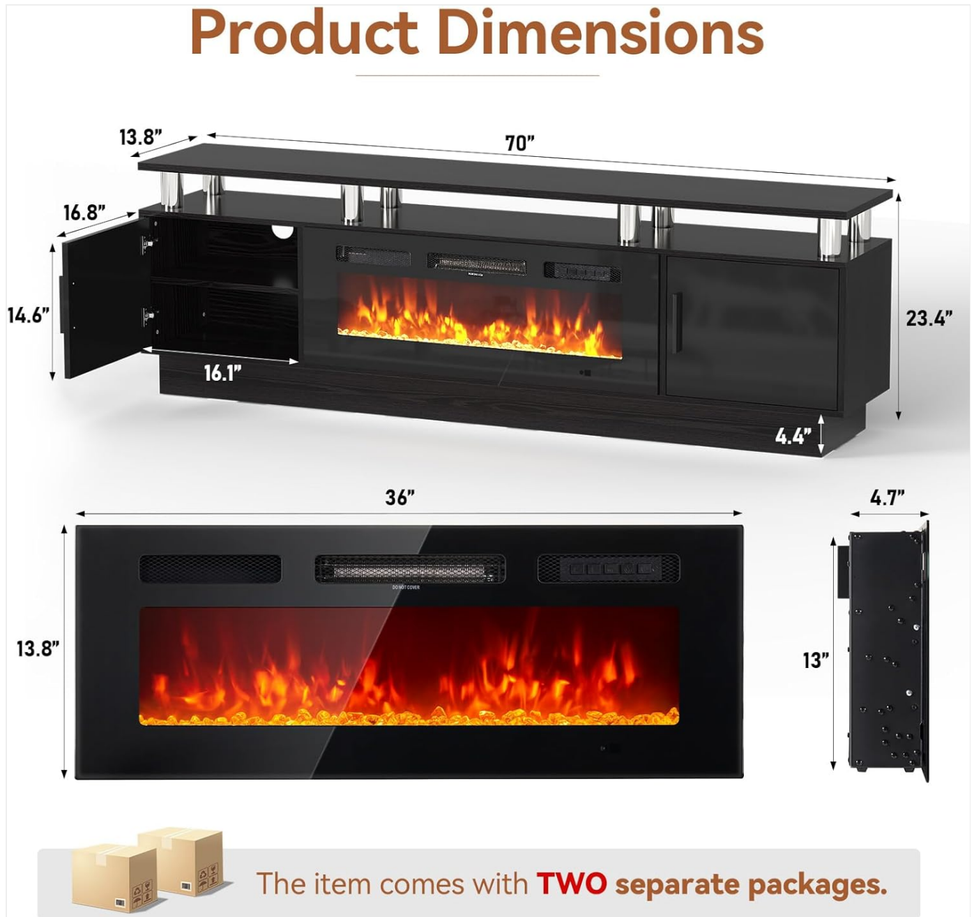
Image 3: A detailed diagram showing the dimensions of the Aoxun TV stand and the separate fireplace insert. The TV stand measures approximately 70 inches in width, 16.8 inches in depth for the main base, and 23.4 inches in total height including the top shelf. The fireplace insert is 36 inches wide and 13.8 inches high.

Refer to the diagram below for detailed product dimensions to ensure proper fit in your desired location.