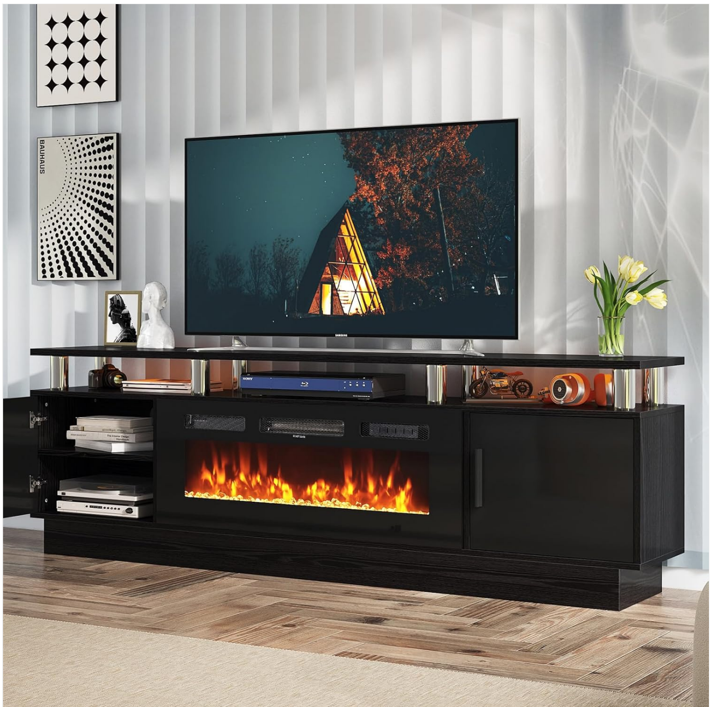
Image 1: Aoxun 70-inch Fireplace TV Stand with a television on top, showcasing the integrated electric fireplace and various storage compartments. The stand is black with metallic accents.