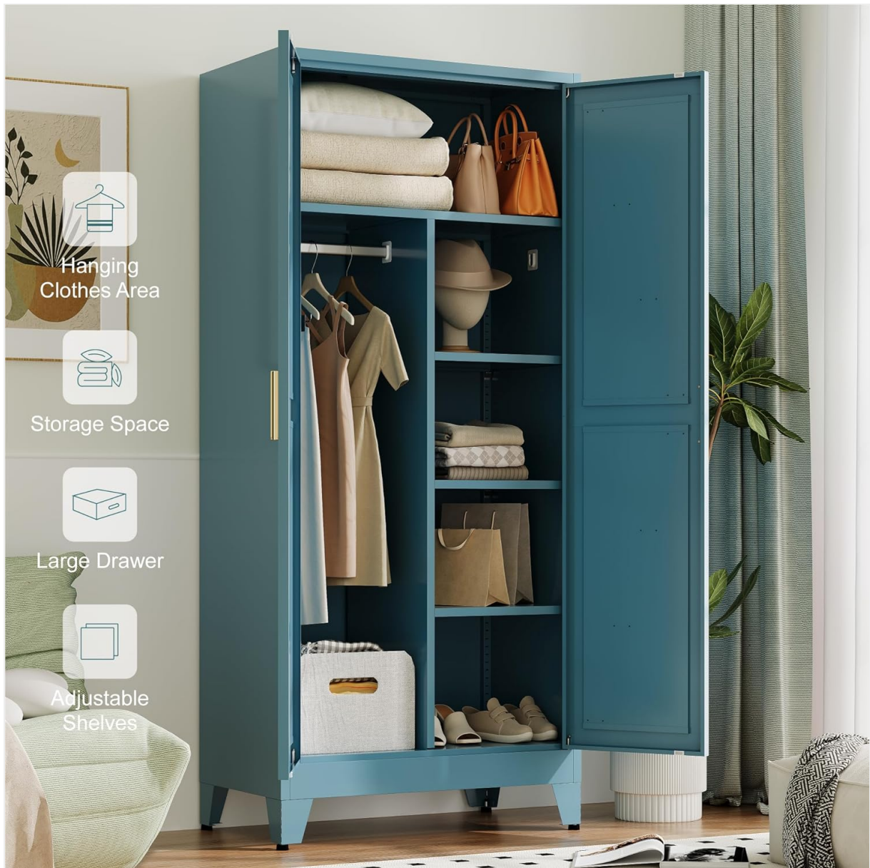
Image 5.1: The wardrobe in a bedroom setting, highlighting the hanging clothes area, general storage space, and the large bottom drawer for organized storage.