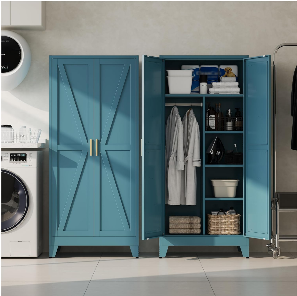
Image 5.2: The wardrobe utilized in a laundry room, demonstrating its capacity to store towels, cleaning supplies, and other items.