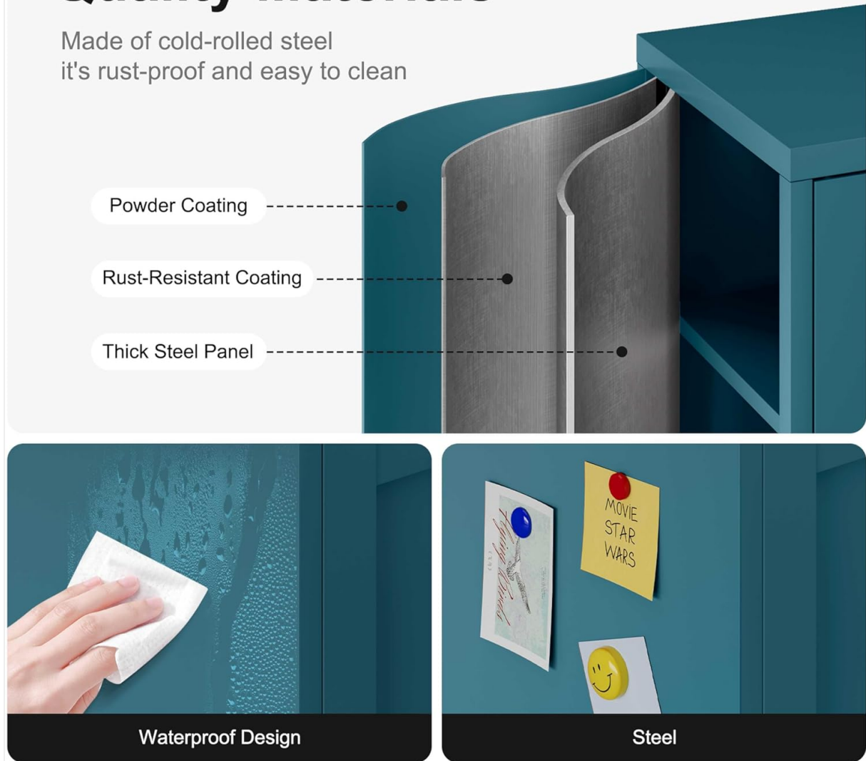
Image 6.1: Details on the quality materials, including cold-rolled steel with powder and rust-resistant coatings, highlighting the waterproof design and magnetic properties of the steel surface.

Made of cold-rolled steel it's rust-proof and easy to clean