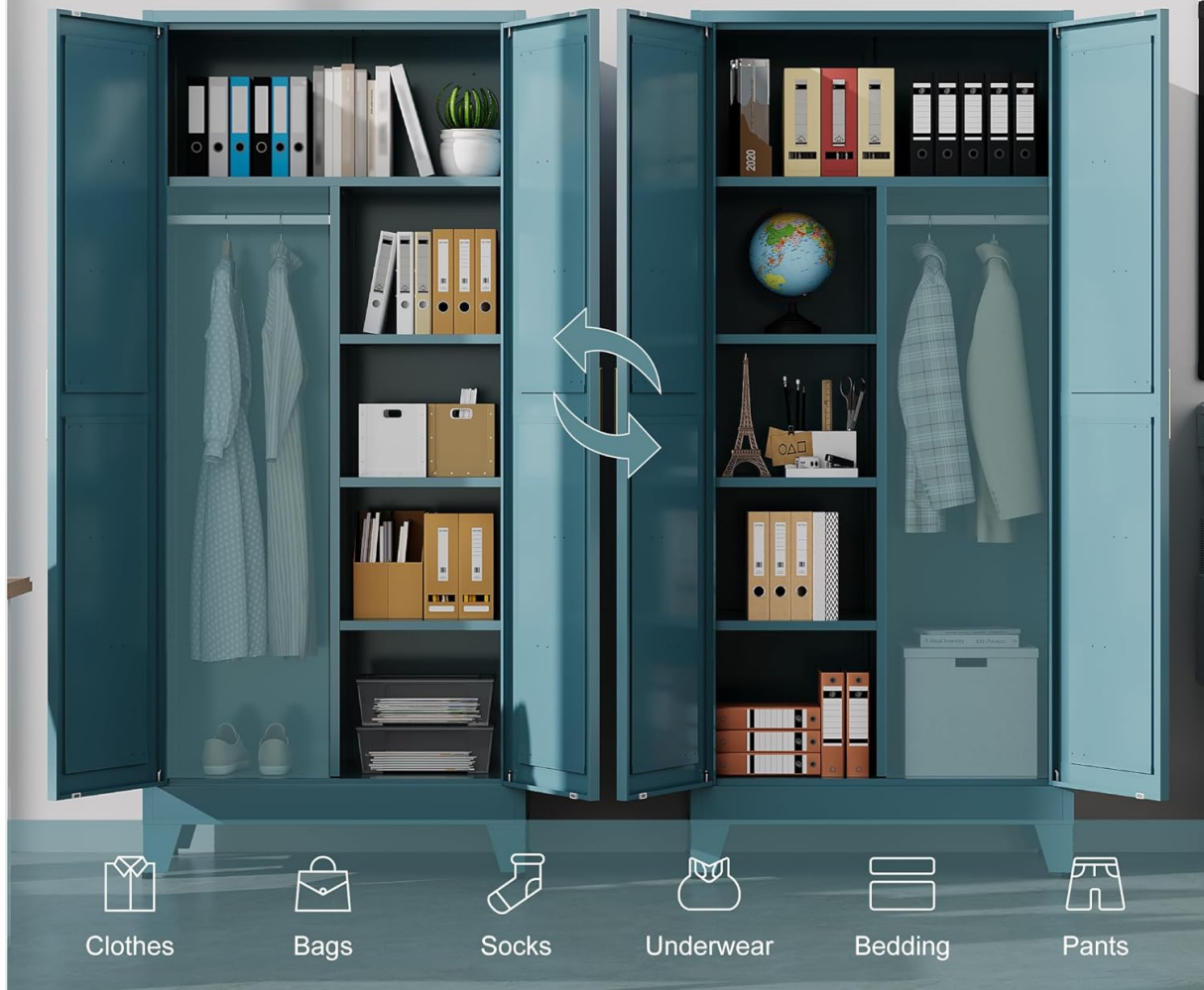
Image 4.2: Illustration of the adjustable shelves, showing how they can be repositioned to accommodate different items like clothes, bags, socks, underwear, bedding, and pants.