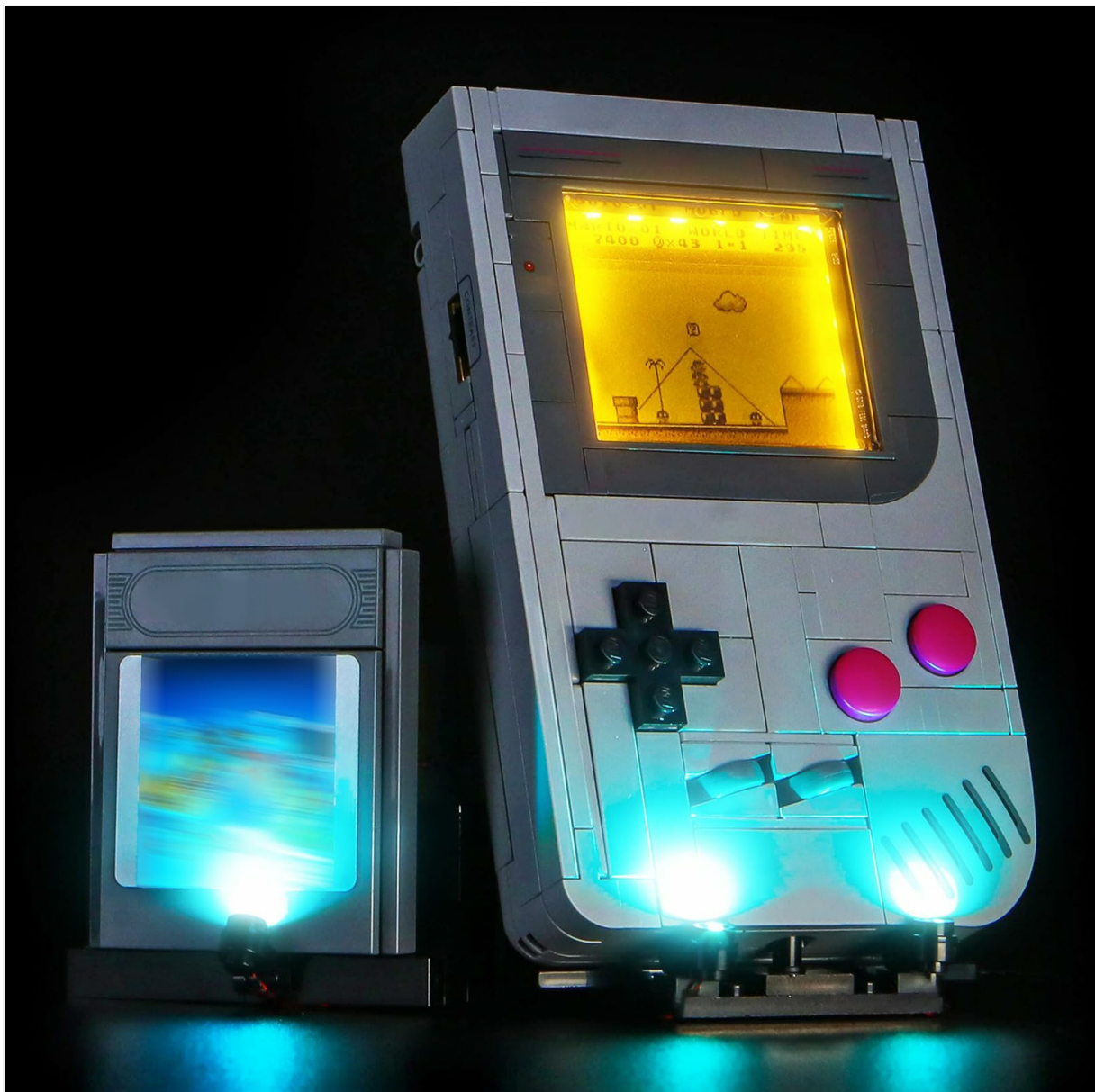
Image: The BrickBling Light Kit installed on a LEGO Game Boy model, showcasing the illuminated display and base lights.

Your browser does not support the video tag.