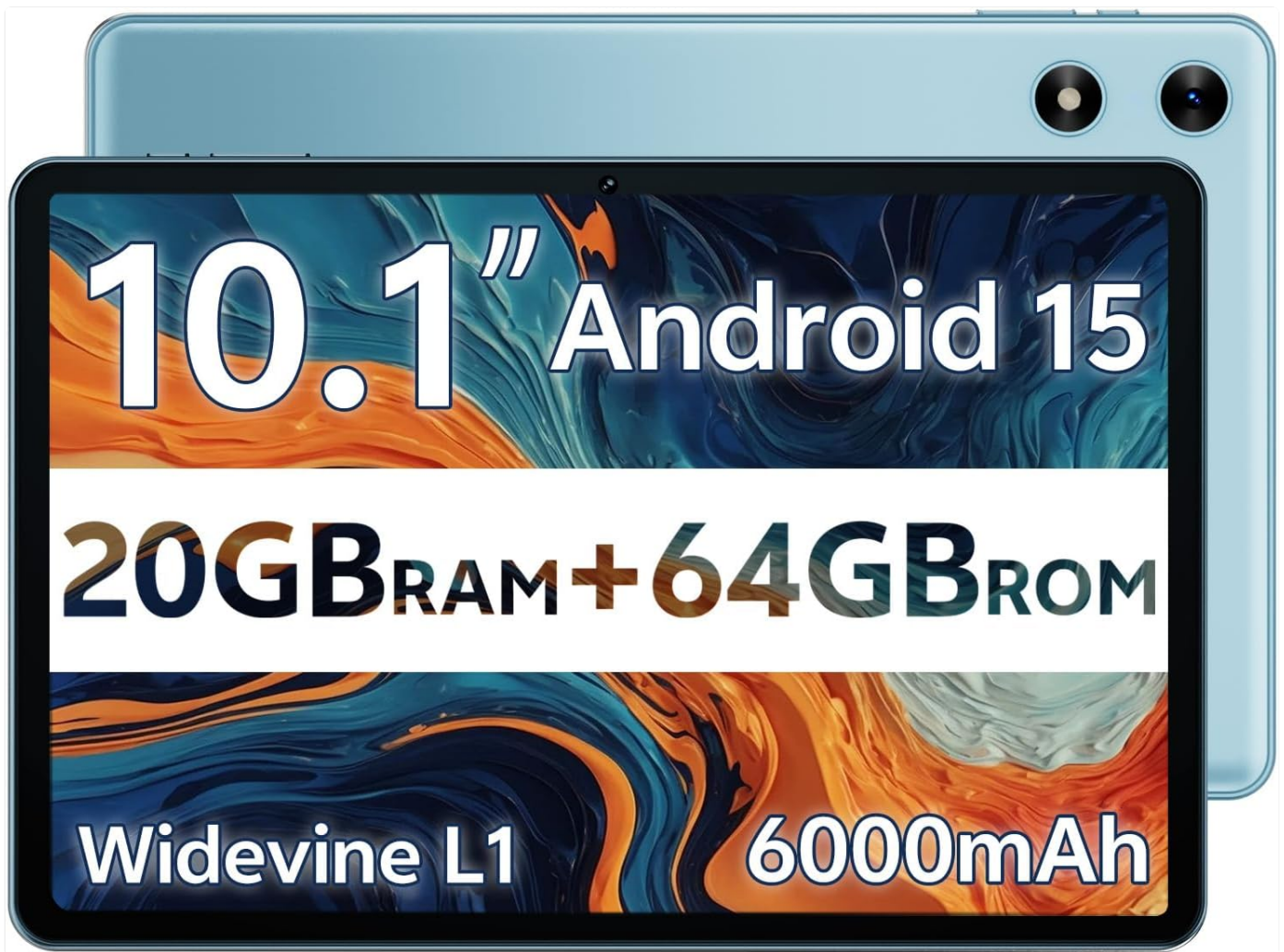
Image 1.1: The SVITOO 10-inch Android Tablet, showcasing its design and included protective case.