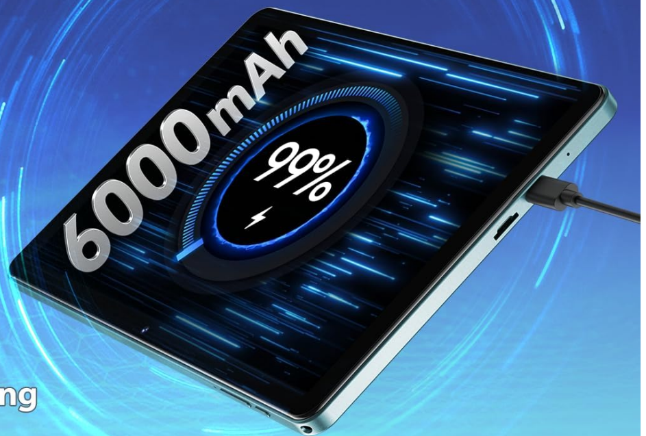
Image 4.1: The tablet connected to a USB-C charger, indicating its charging status.