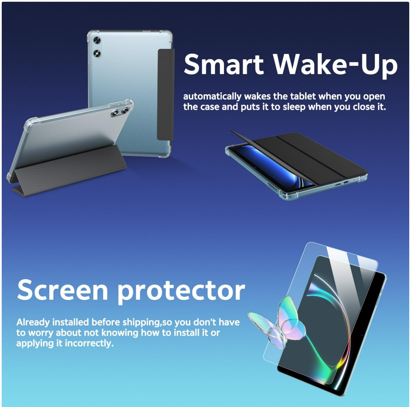
Image 2.2: The tablet with its smart protective case, demonstrating the automatic wake-up function.