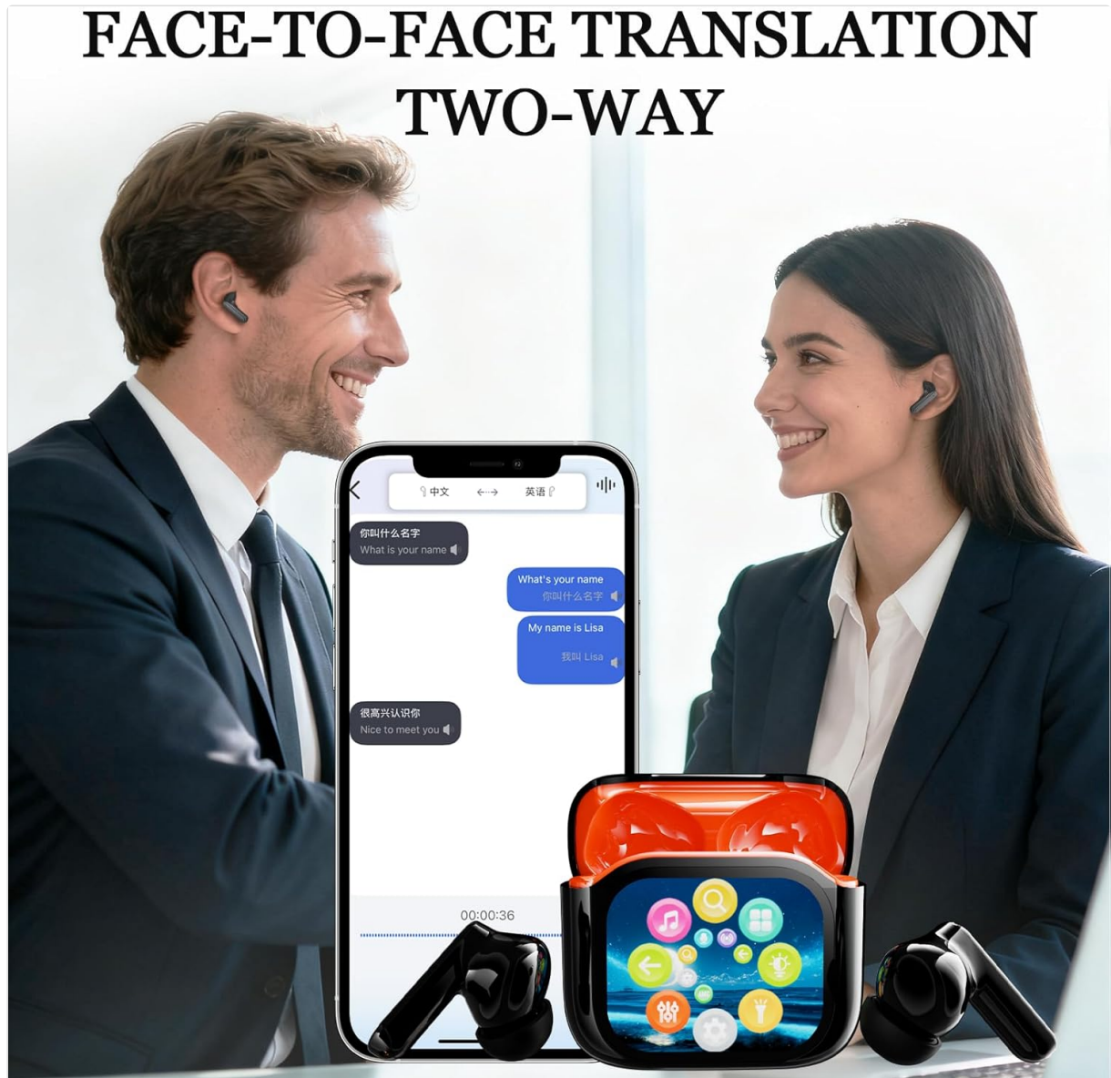
Image: Face-to-Face Two-Way Translation with SANOTO BY16 Earbuds. This image shows two individuals communicating with the help of the earbuds, demonstrating the real-time, two-way translation feature on a smartphone screen.