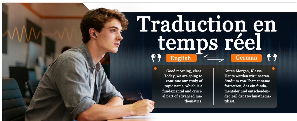
Image: Real-time Translation Example with English and German. A person is shown studying, with a visual representation of English text being translated into German, highlighting the real-time translation capability.