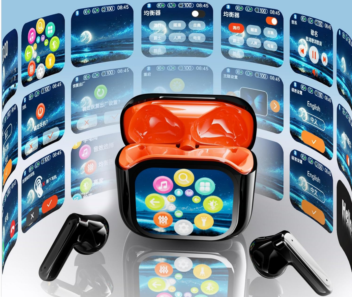
Image: SANOTO BY16 Earbuds and Charging Case with Display. The image shows the two earbuds placed inside their charging case, which features a small screen displaying various icons. This illustrates the main components of the product.

No need for a phone, operation is just a touch away