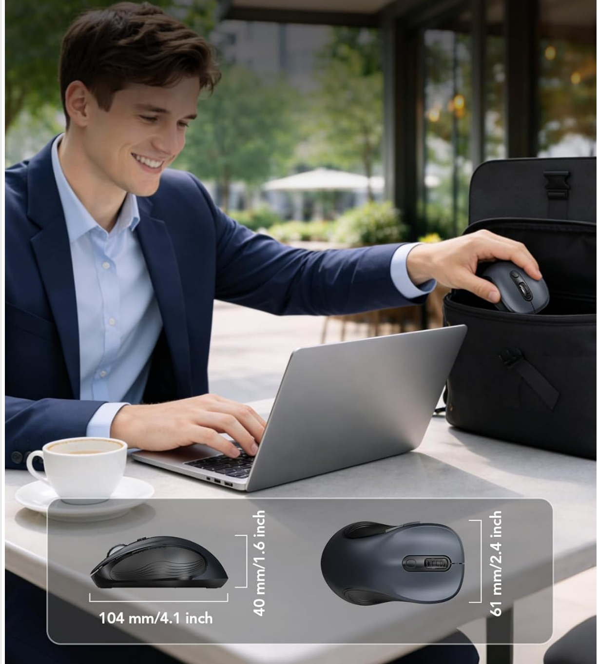
Figure 5: Lightweight and Portable. This image shows the mouse being easily stored in a bag, emphasizing its lightweight design for portability.