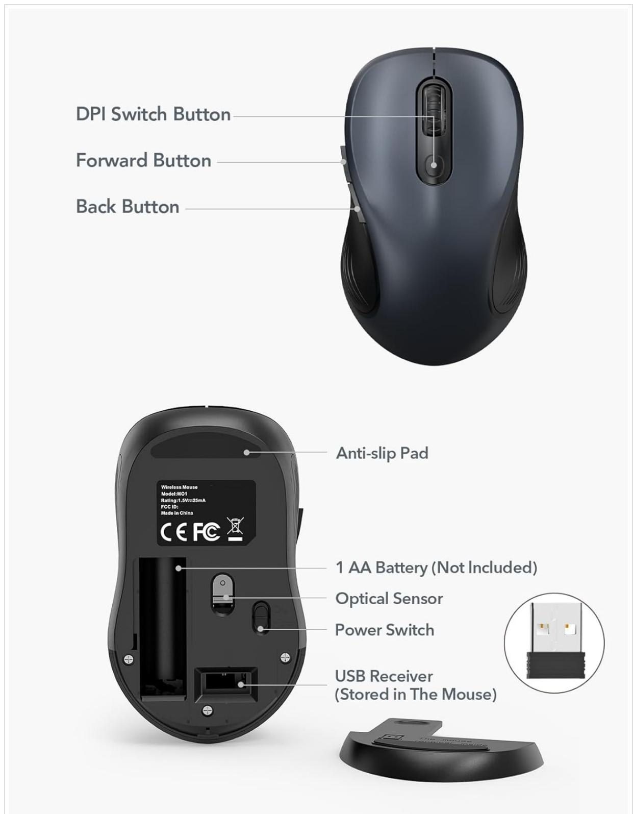
Figure 6: Battery and USB Receiver Location. This image illustrates the battery compartment and the storage slot for the USB receiver on the underside of the mouse.