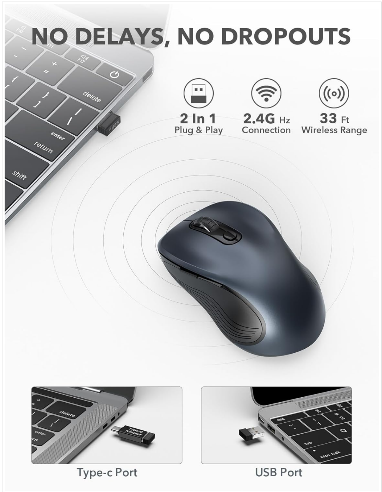
Figure 7: USB Receiver Connection. This image demonstrates how to connect the 2.4GHz USB receiver to both a standard USB-A port and a USB-C port using the provided adapter.