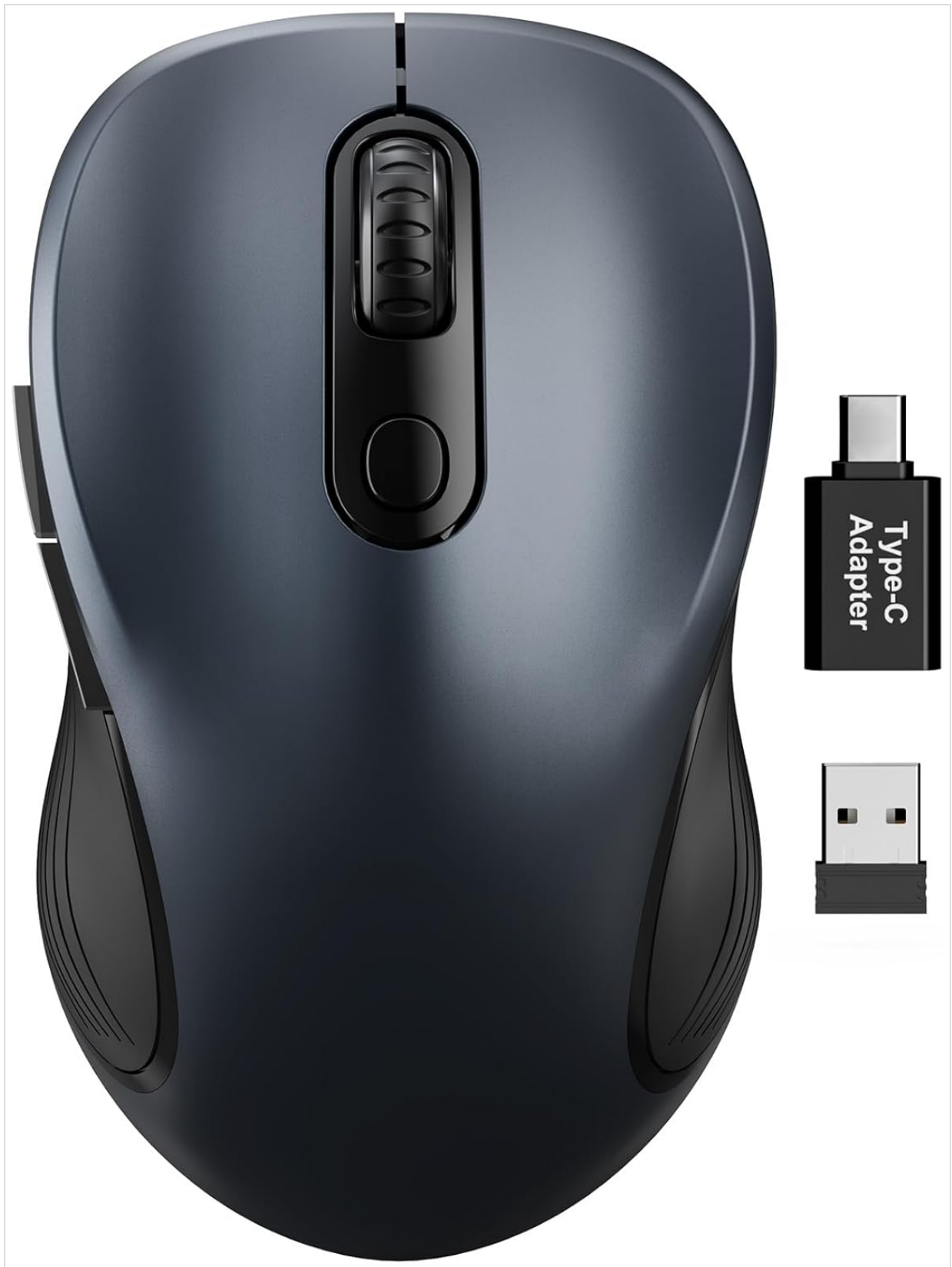
Figure 1: Trueque Wireless Mouse. A general view of the Trueque Wireless Mouse in Space Gray.