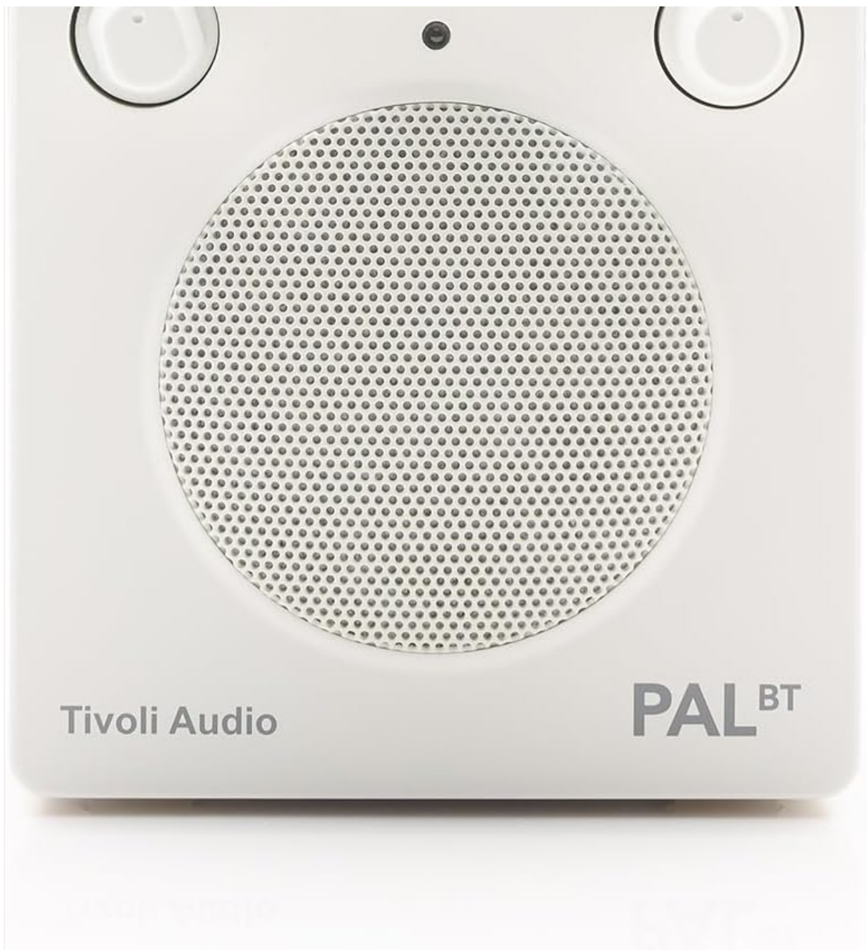
Image: The Tivoli Audio PAL BT (Gen 3) radio, showcasing its compact design and front controls.