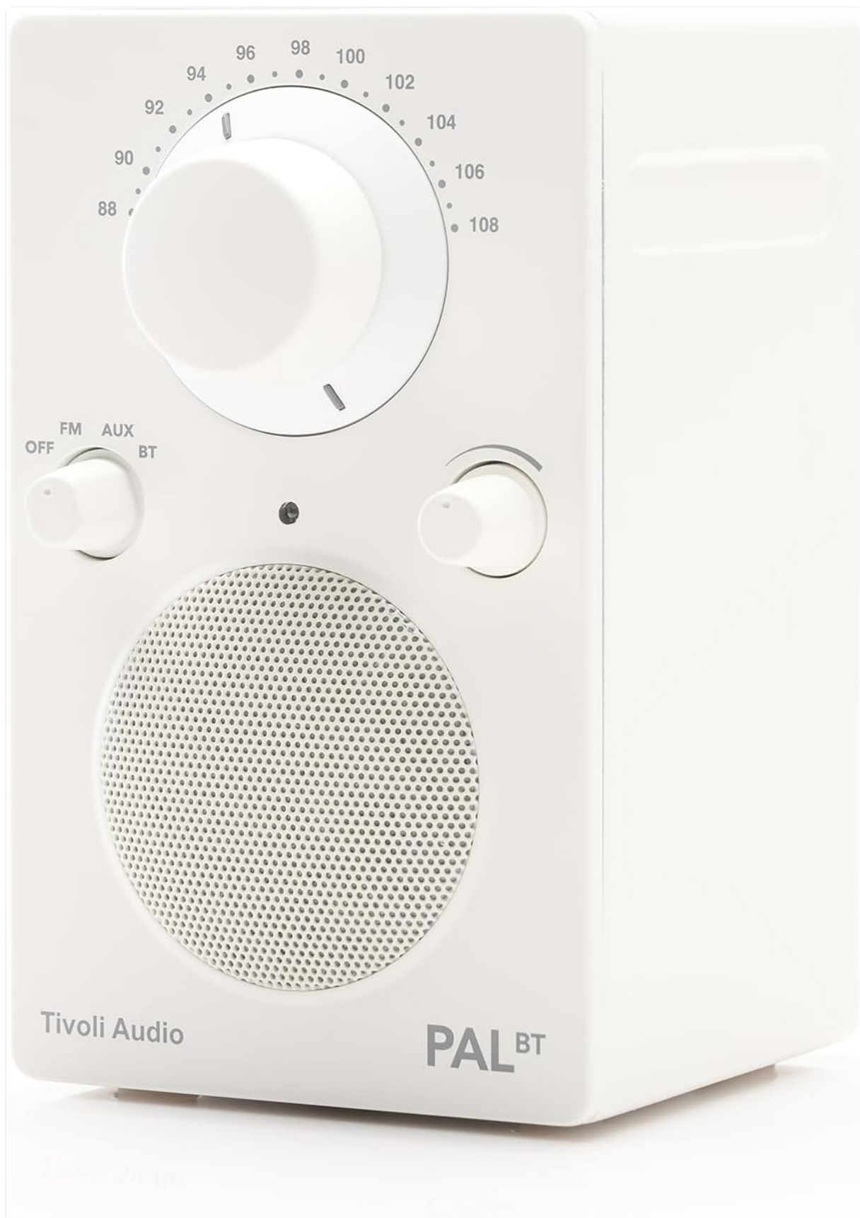
Image: Front view of the PAL BT (Gen 3) highlighting the control knobs and FM frequency dial.