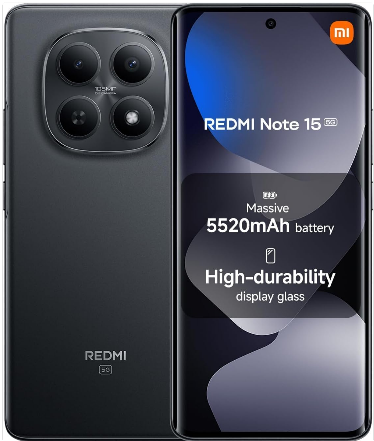
Figure 3.1: Front and back view of the Redmi Note 15 5G AI smartphone, showcasing its sleek design and camera module.