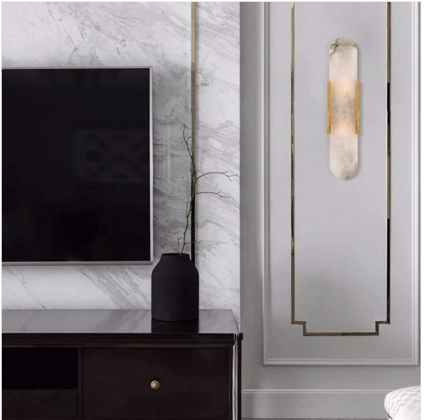
Image: The wall light integrated into a living room design, positioned near a television.