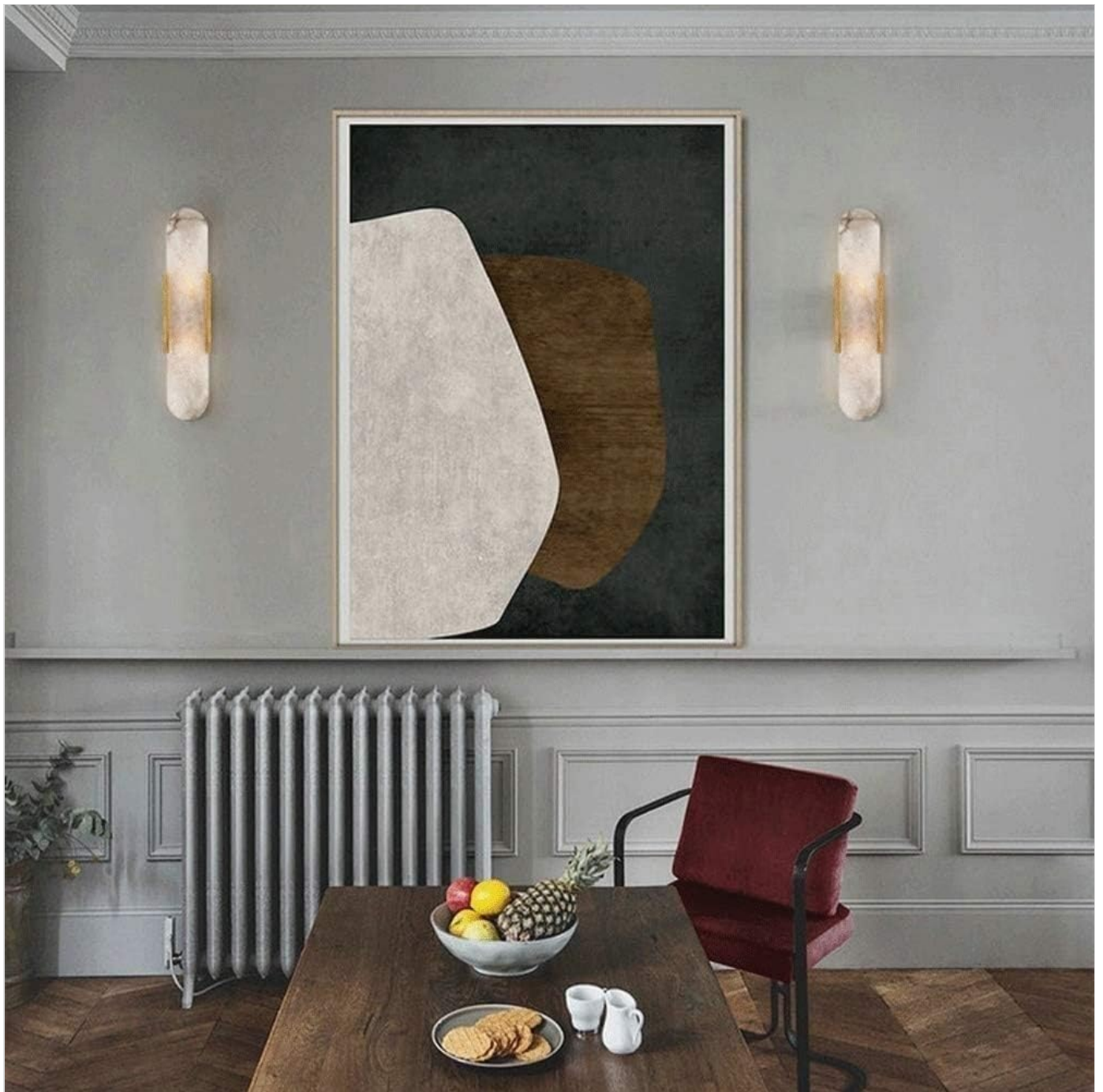
Image: Two wall lights enhancing the decor of a dining space, positioned symmetrically.