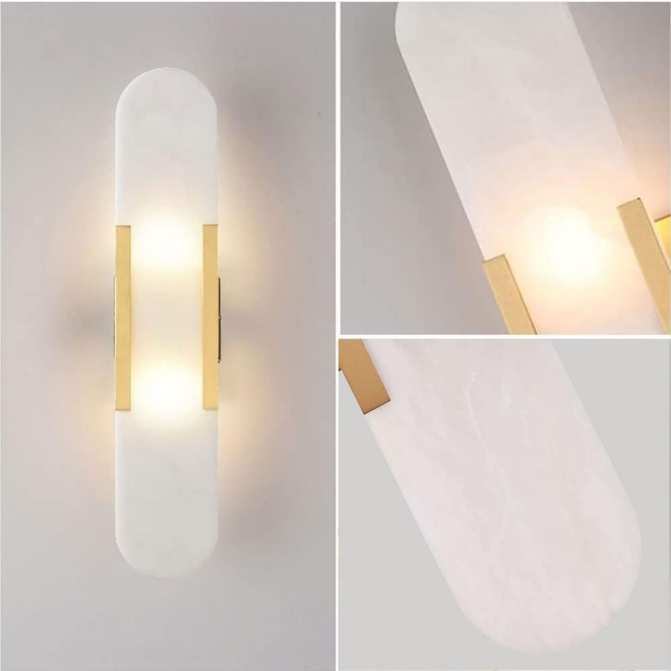
Image: Detailed view of the wall light, showcasing the natural marble pattern and the metallic frame.