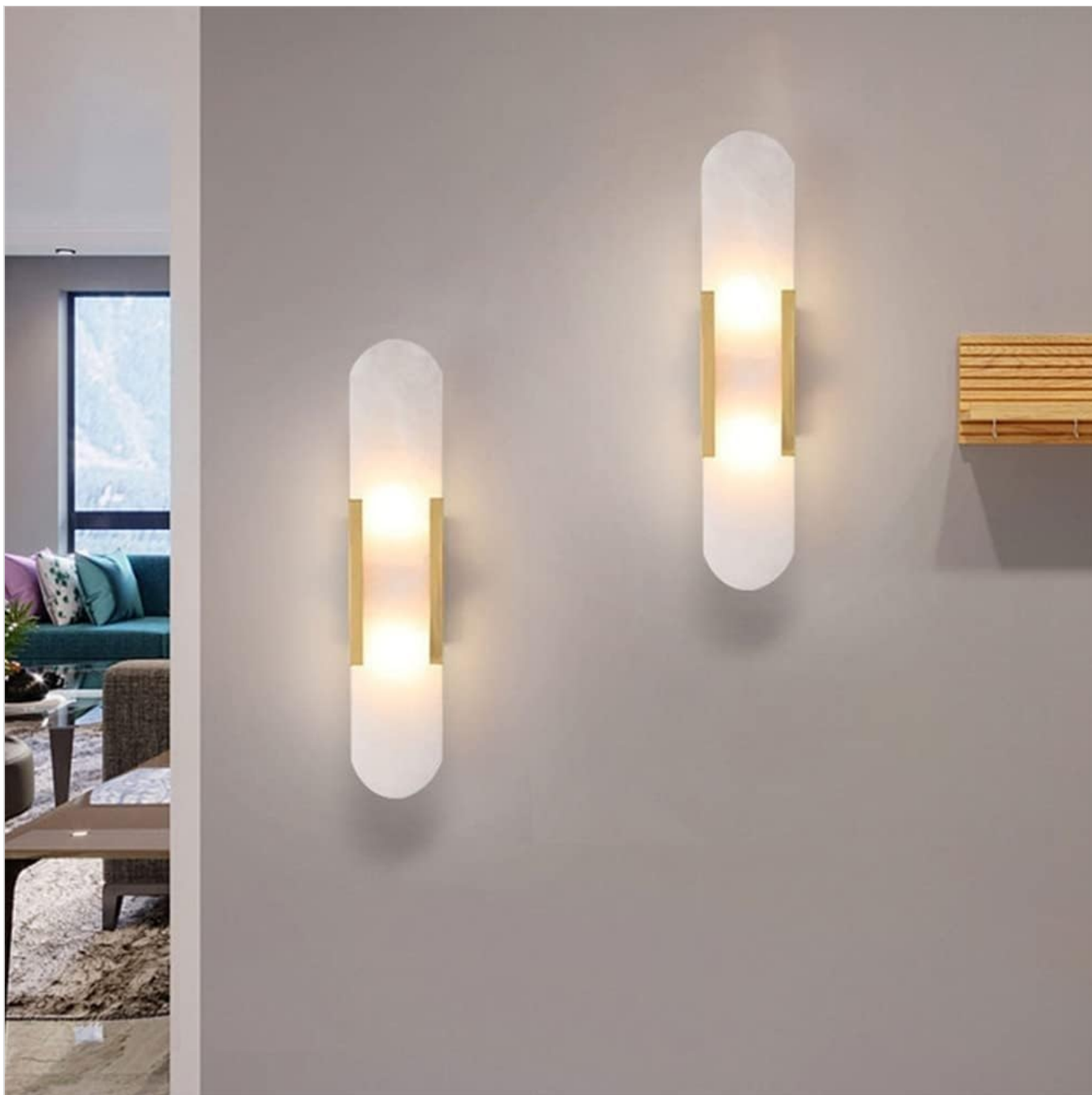
Image: A pair of wall lights illuminating a hallway, demonstrating their light distribution.