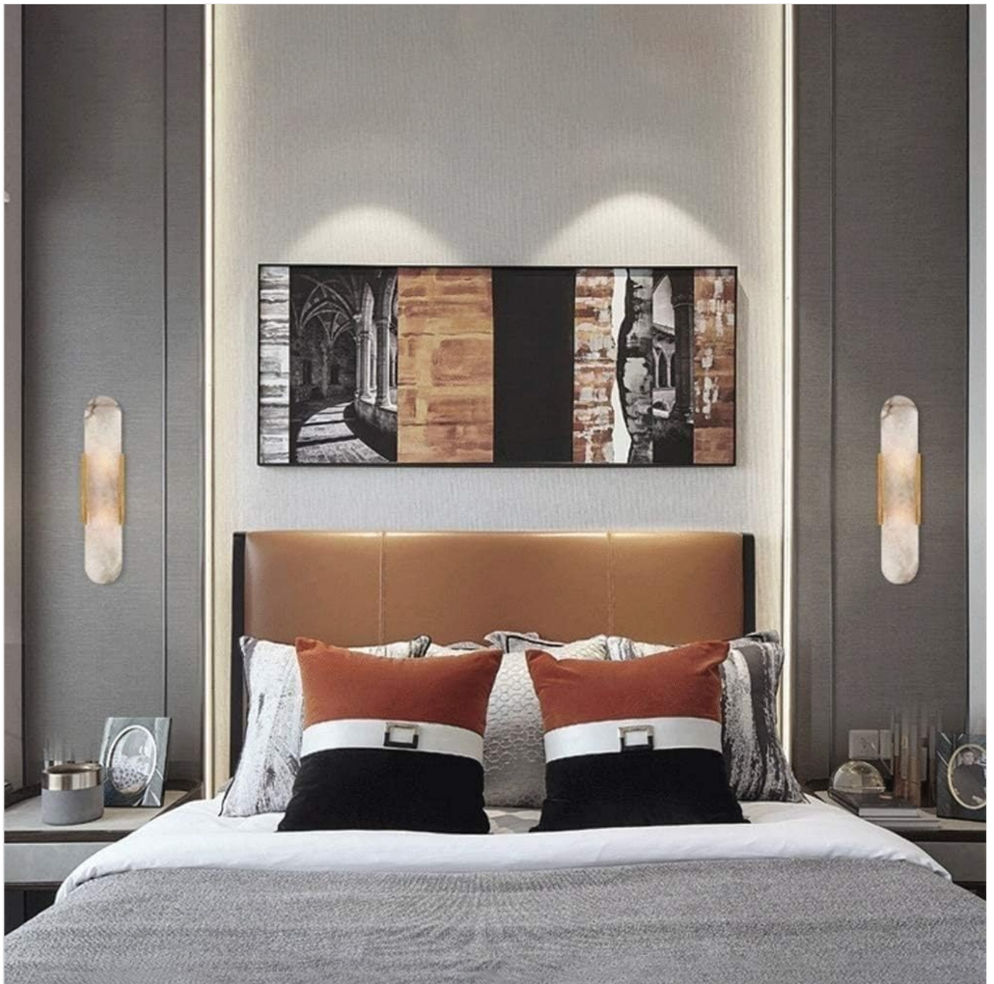
Image: Wall lights providing soft illumination in a bedroom setting, mounted beside the bed.