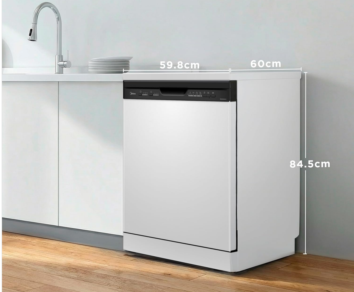
Image: Diagram showing the dimensions of the Midea dishwasher (Depth: 60cm, Width: 59.8cm, Height: 84.5cm).

Conoce las medidas de nuestro lavavajillas