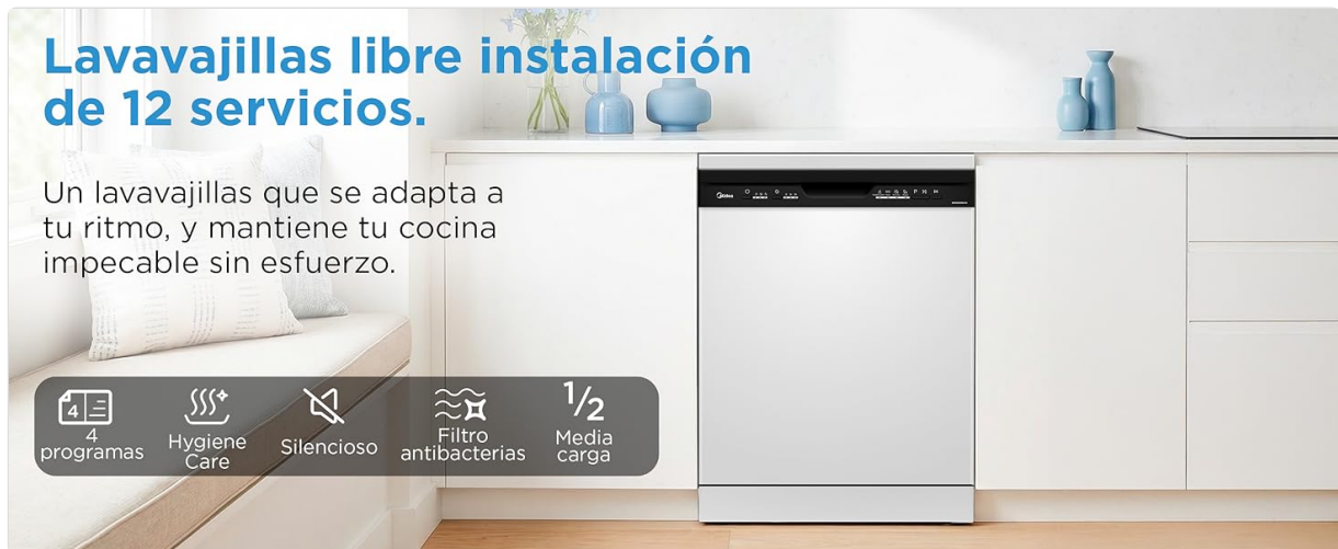
Image: The dishwasher installed in a modern kitchen, highlighting its free-standing design.

This is a free-standing dishwasher. Ensure it is placed on a stable, level surface. Adjustable feet are included to fine-tune the height and ensure stability.