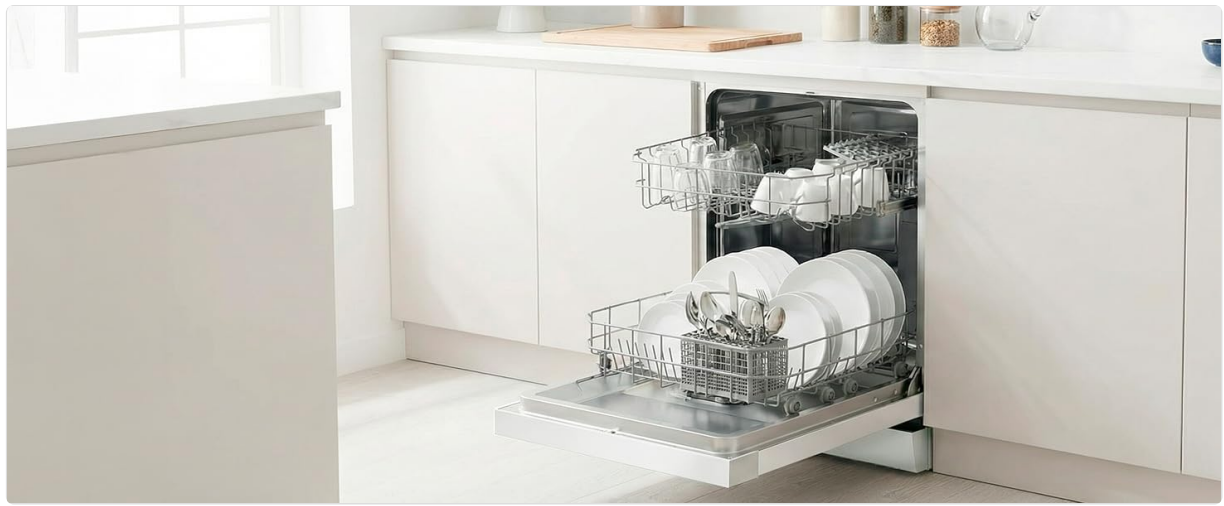
Image: Interior view of the Midea dishwasher showing the upper and lower racks, and cutlery basket, loaded with dishes.

Your browser does not support the video tag.