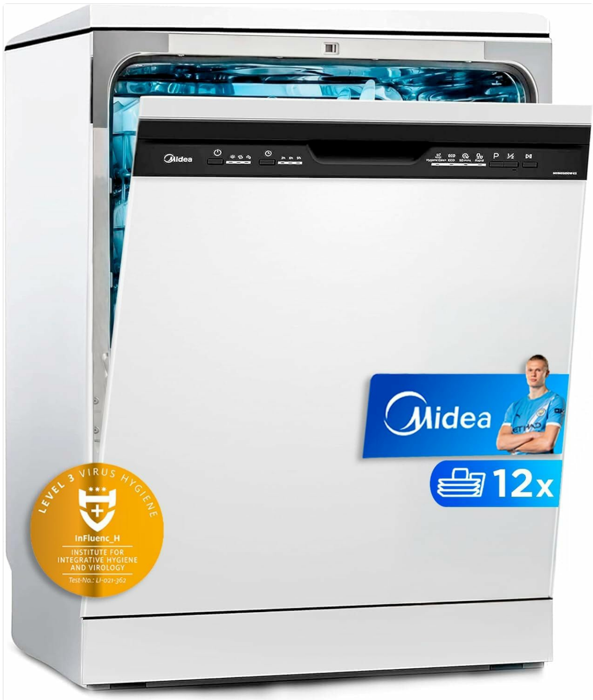
Image: Front view of the Midea 60cm 12-place setting dishwasher.