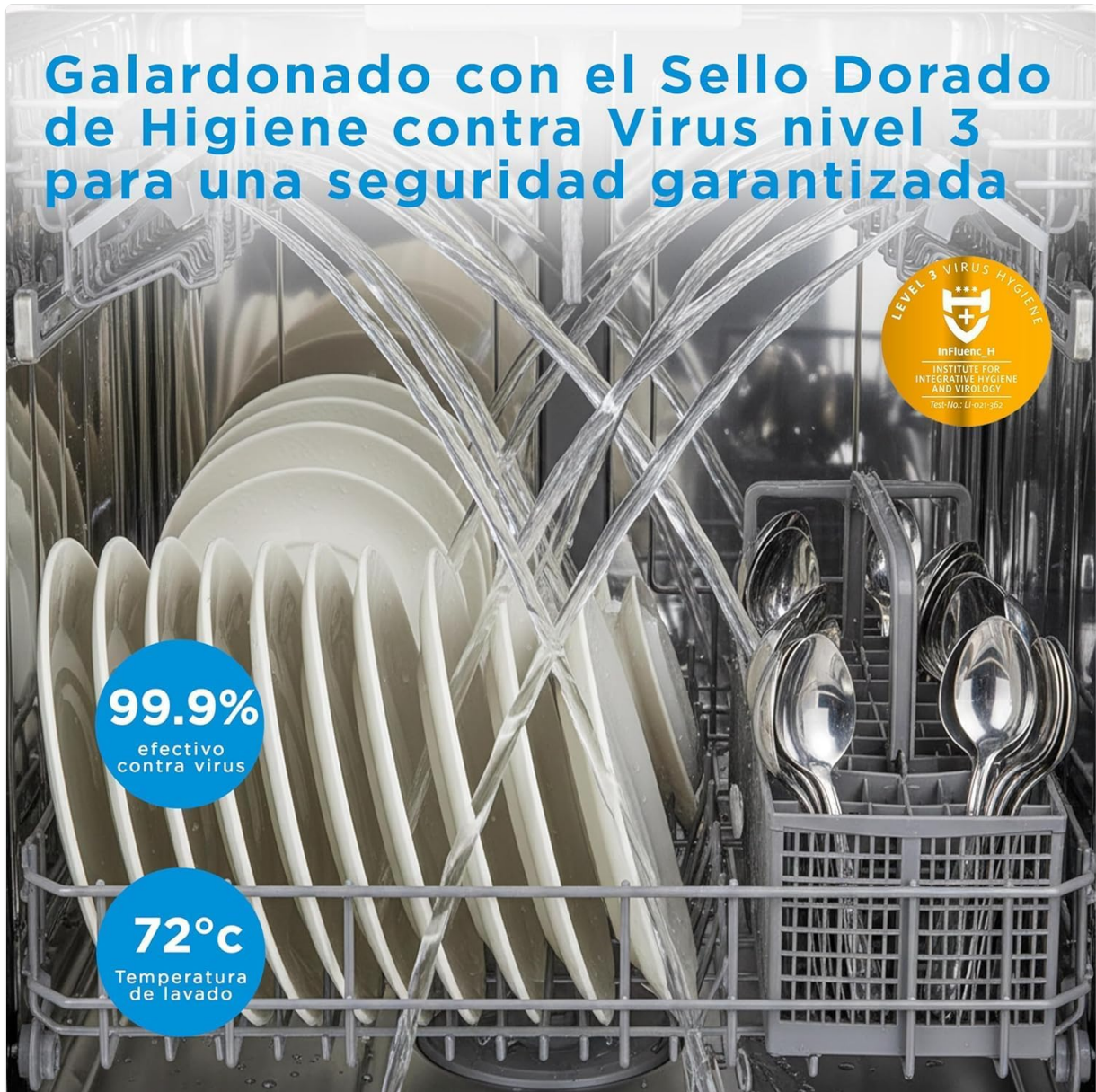
Image: Close-up of the dishwasher interior, highlighting the antibacterial filter and its hygiene benefits.