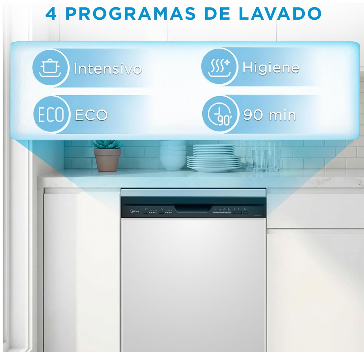
Image: Control panel of the Midea dishwasher showing the selection options for the 4 wash programs: Intensivo, Higiene, ECO, and 90 min.