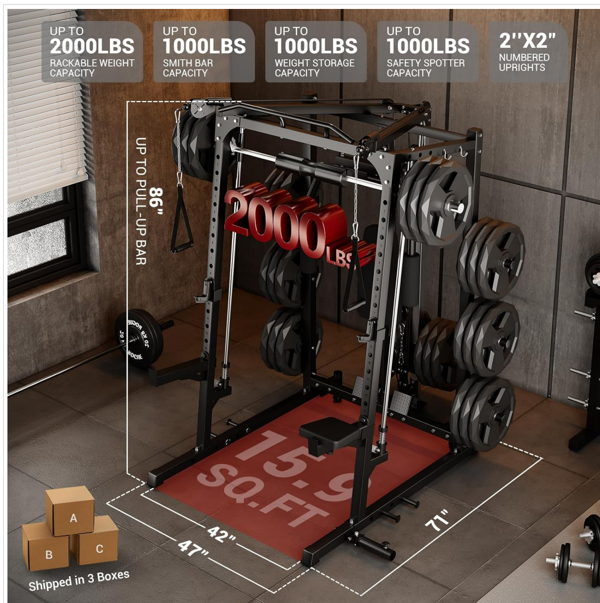
Figure 8: Product dimensions and weight capacities, including rackable weight capacity up to 2000 LBS and Smith bar capacity up to 1000 LBS.

variations. The machine also includes weight storage pins, J-hooks, a removable landmine attachment, footplate, strap pins, and a barbell shoulder pad for a complete workout experience.