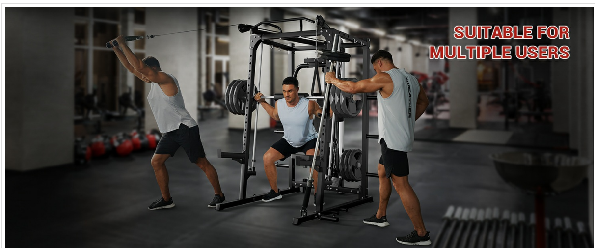
Figure 7: The machine supports a variety of exercises including seat row, butterfly press, cable crossover, pull-up, deep squat, bench press, and lat pulldown.