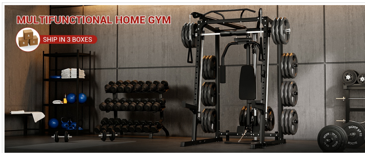
Figure 3: The GarveeLife D2037 Smith Machine is shipped in three boxes.

Important Note: This product does not include weight plates. These must be purchased separately.