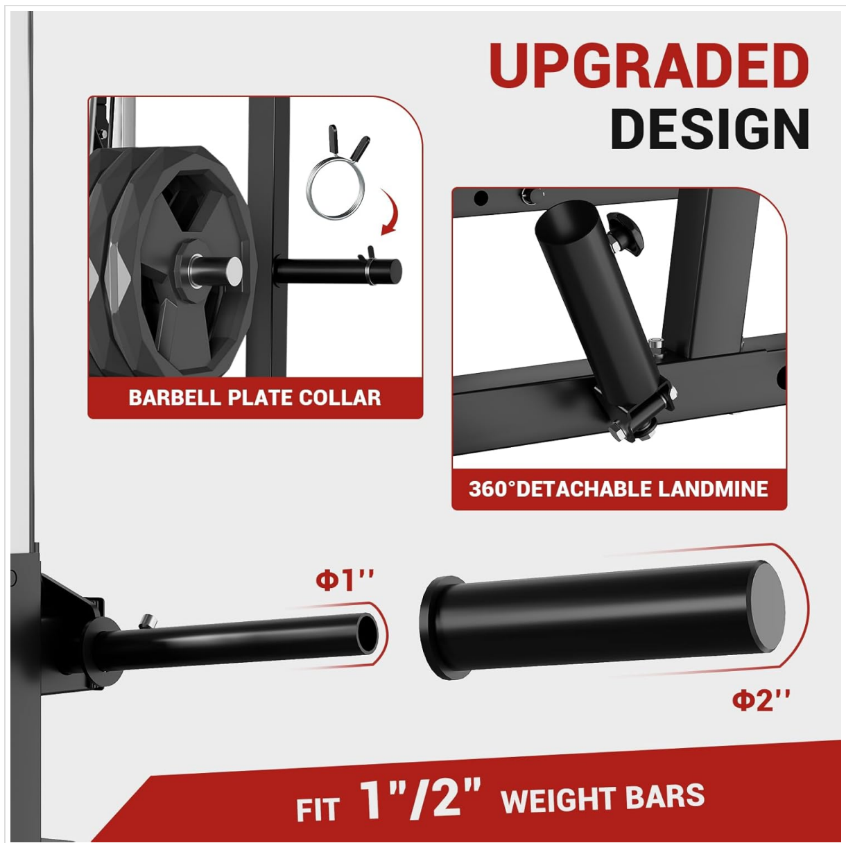
Figure 5: Detail of the barbell plate collar and the 360-degree detachable landmine attachment.