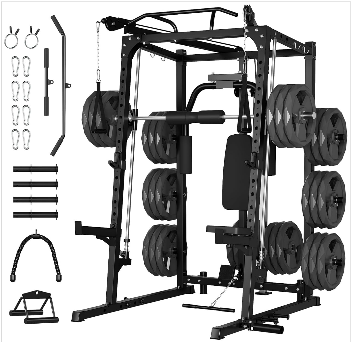
Figure 1: The GarveeLife D2037 Multi-Function Smith Machine with included accessories.