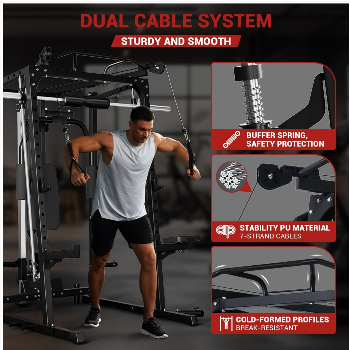
Figure 6: The dual cable system allows for exercises like cable crossovers, featuring buffer springs and stability PU material cables.