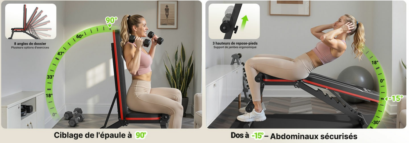
Image: Backrest angles for various exercises, including shoulder presses (90°) and abdominal crunches (-15°).