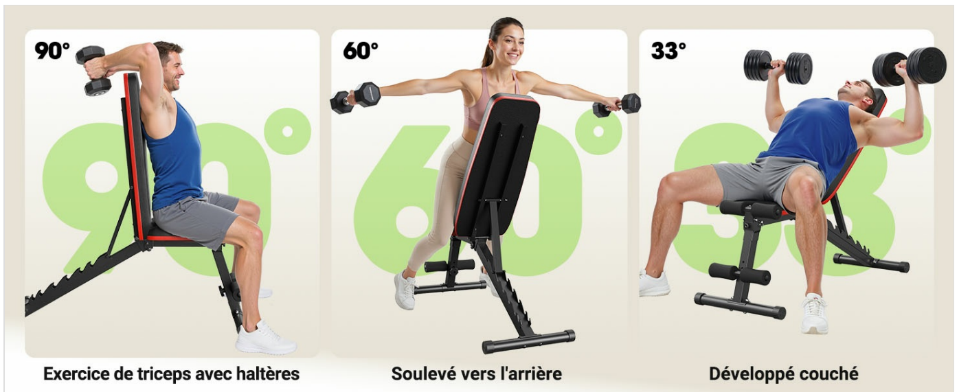
Image: Examples of exercises possible with the adjustable backrest, such as triceps extensions at 90°, lateral raises at 60°, and chest presses at 33°.