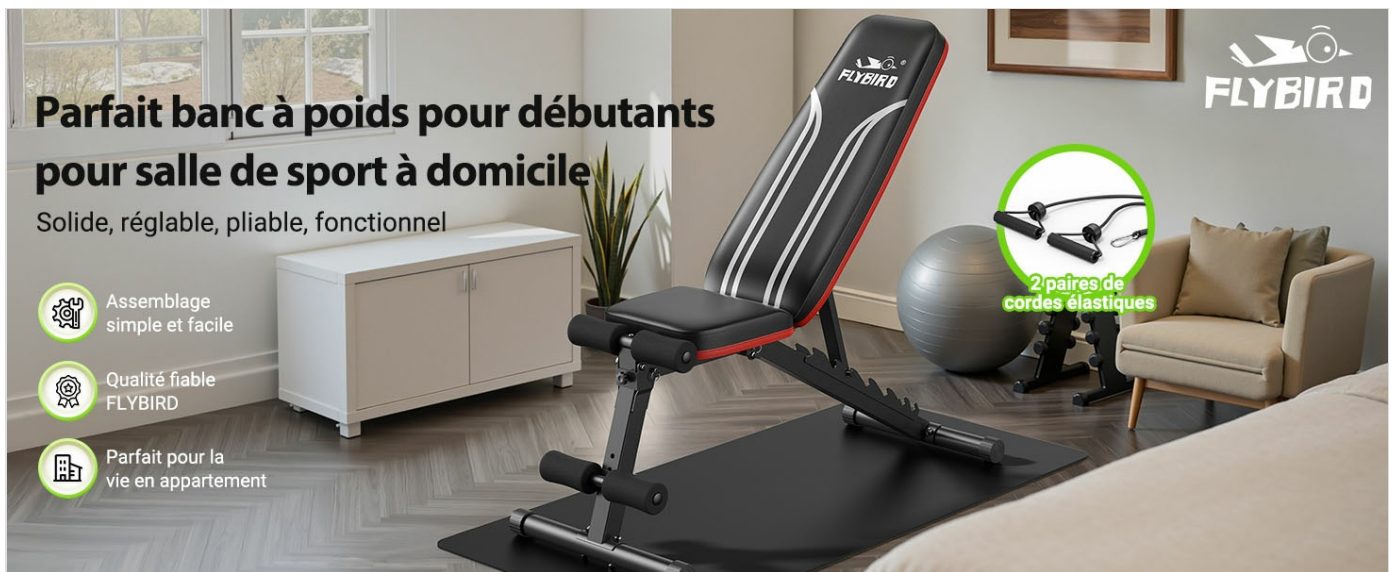
Image: The FLYBIRD bench is designed for easy assembly and is ideal for home use, including apartments.