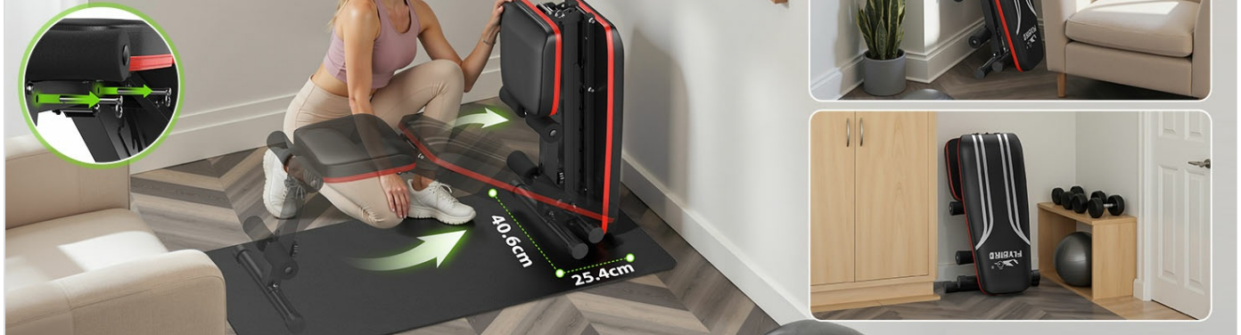
Image: Stable trapezoidal support with 1.5mm thick steel tubing and a 40.6 cm wide base for enhanced stability.

Image: Double-sided gear mechanism provides reinforced support for a heavy load capacity of 318 kg.