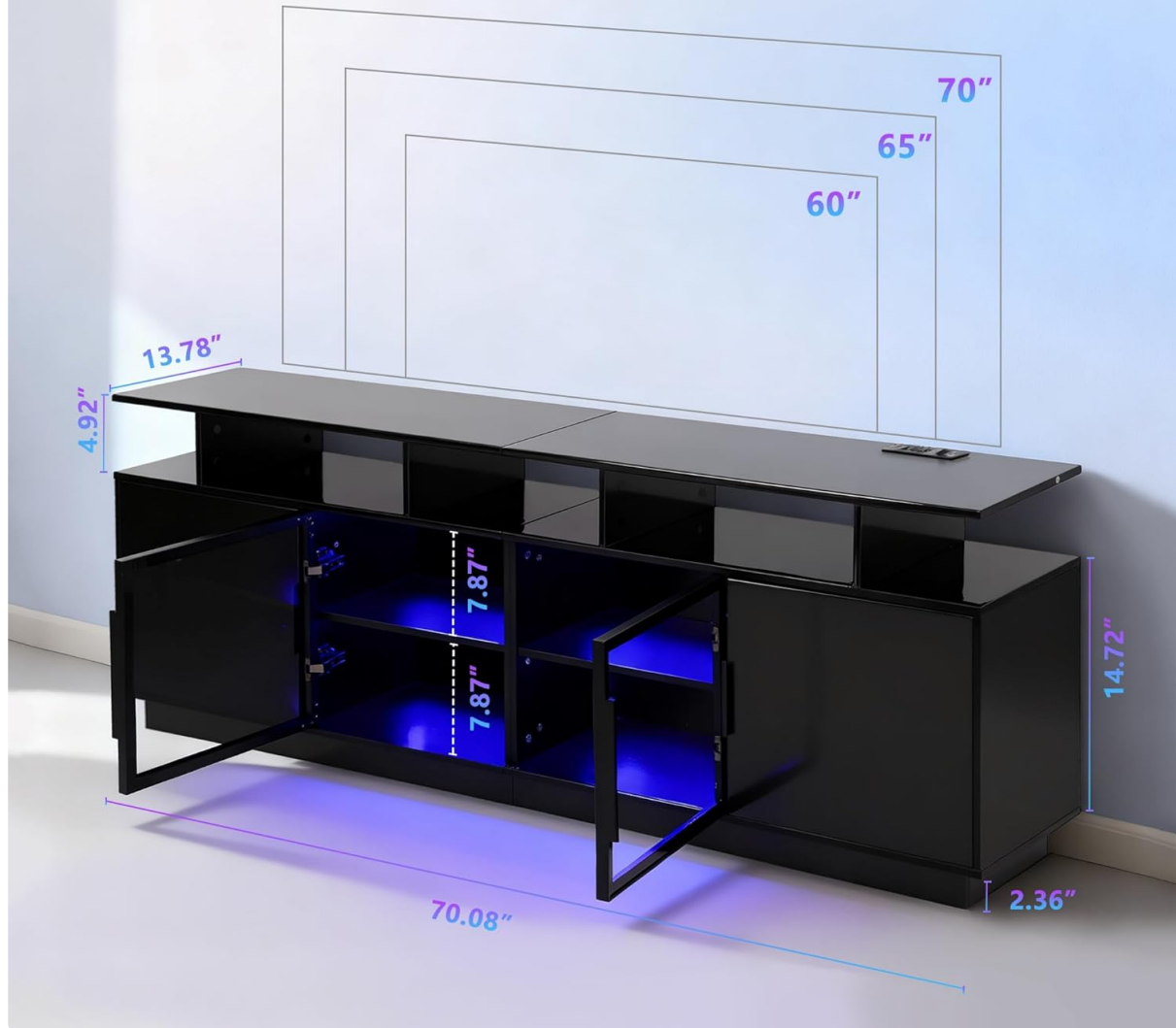
Image: Diagram illustrating the dimensions of the ansefe 70 Inch Black TV Stand.