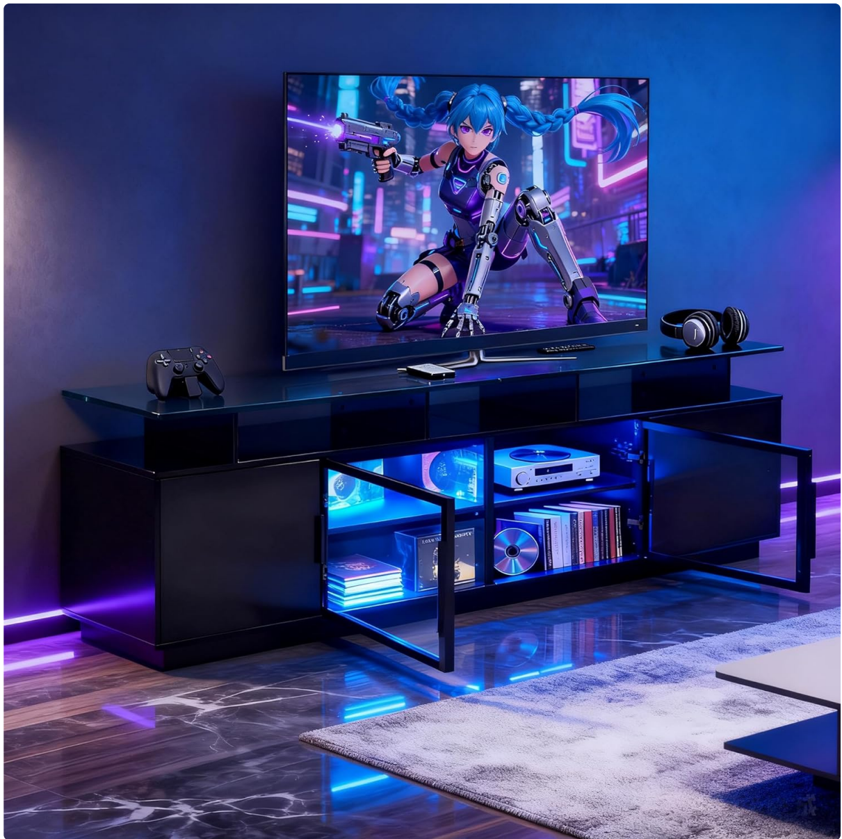
Image: The TV stand integrated into a gaming setup, highlighting the blue LED lighting and storage for consoles and accessories.