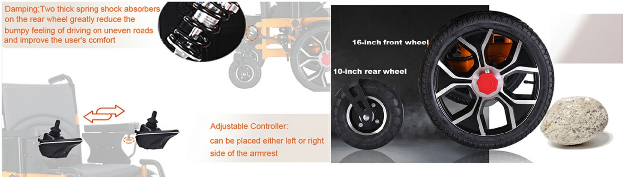
Figure 3: Adjustable controller placement for left or right-hand use.

Video 3: Demonstrates the various operating modes and controller functions of the electric wheelchair.