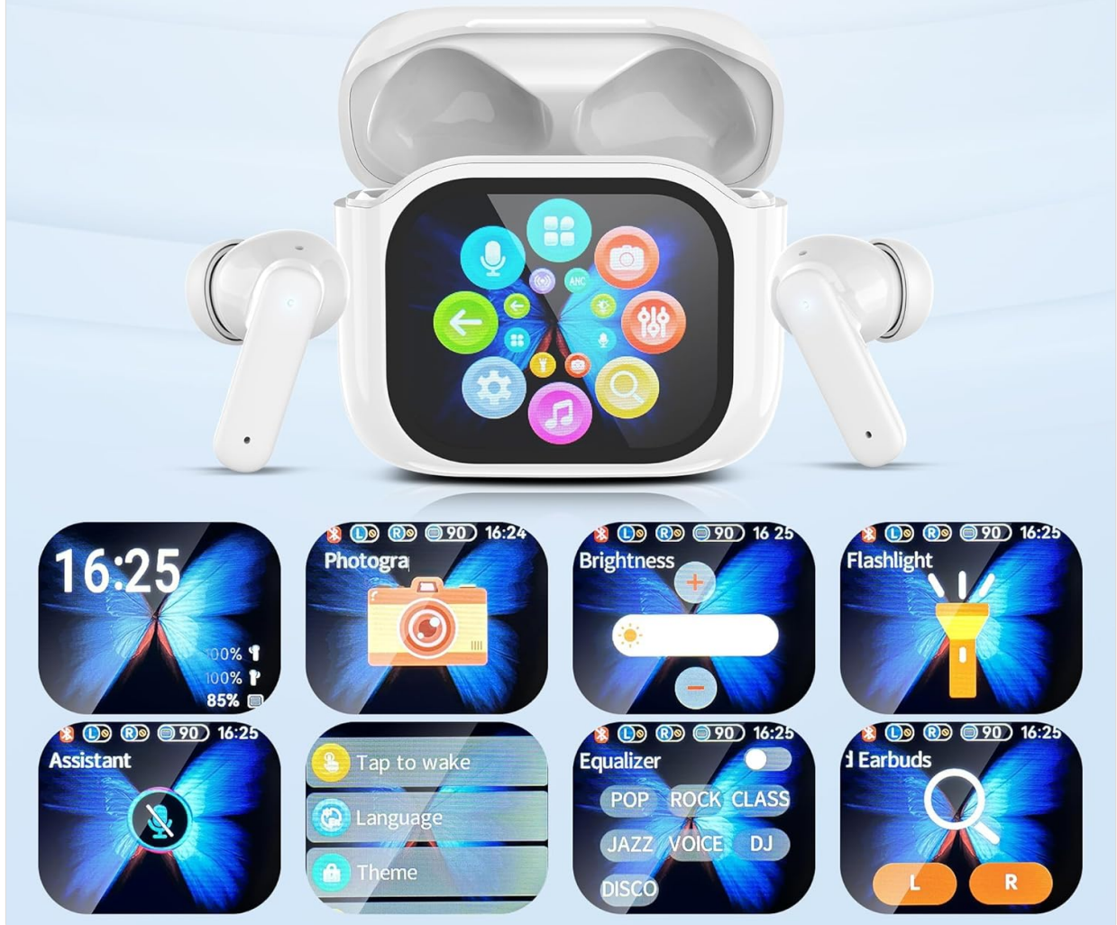
Figure 2: Charging case with LED Full-Color Touch Screen displaying various features like photography, brightness, flashlight, assistant, language, and equalizer settings.