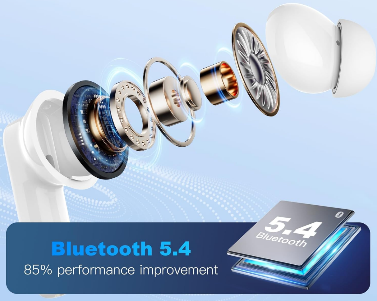
Figure 7: Highlighting Hi-Fi Audio for immersive stereo surround sound and intelligent noise reduction, powered by Bluetooth 5.4 for 85% performance improvement.

immersive stereo surround sound, intelligent noise reduction