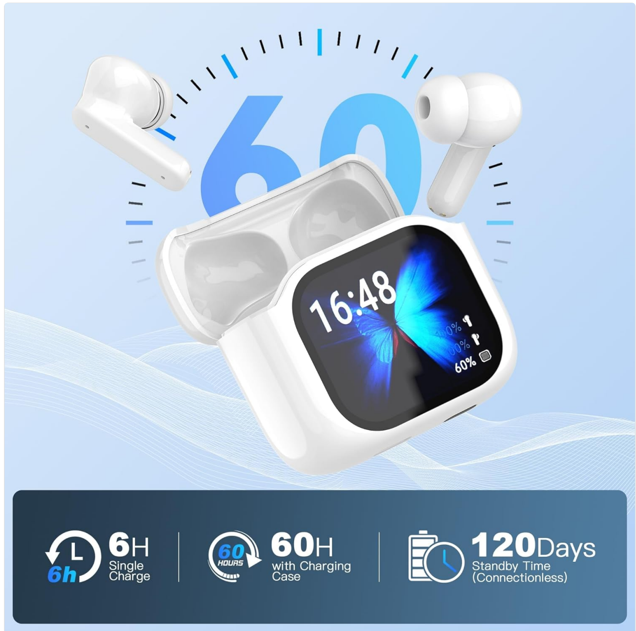
Figure 6: Visual representation of the earbuds' battery life, showing 6 hours on a single charge, 60 hours with the charging case, and 120 days of standby time.

The earbuds provide up to 6 hours of single charge use, and up to 60 hours with the charging case. The charging case itself can be fully charged in approximately 1.5 hours via the USB-C port. The LCD screen displays the battery status of both earbuds and the case.