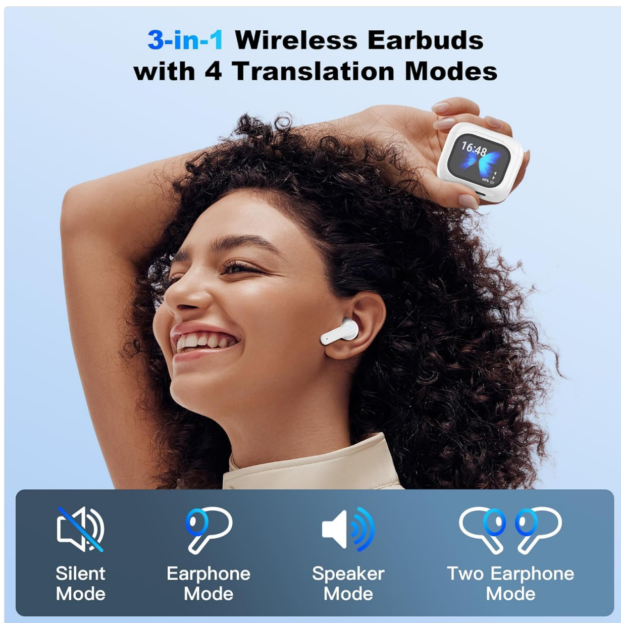
Figure 4: Illustration of the four translation modes: Silent Mode, Earphone Mode, Speaker Mode, and Two Earphone Mode.