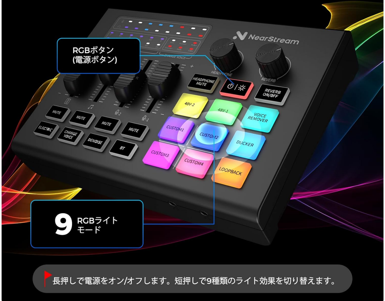
Image: The AMIX20U showcasing its vibrant RGB lighting, with an overlay indicating the 9 available light modes that can be controlled via the RGB button.

スイッチを制御するだけでなく、モードを切り替えることで、音と光が調和した没入感のある配信空間を実現します。