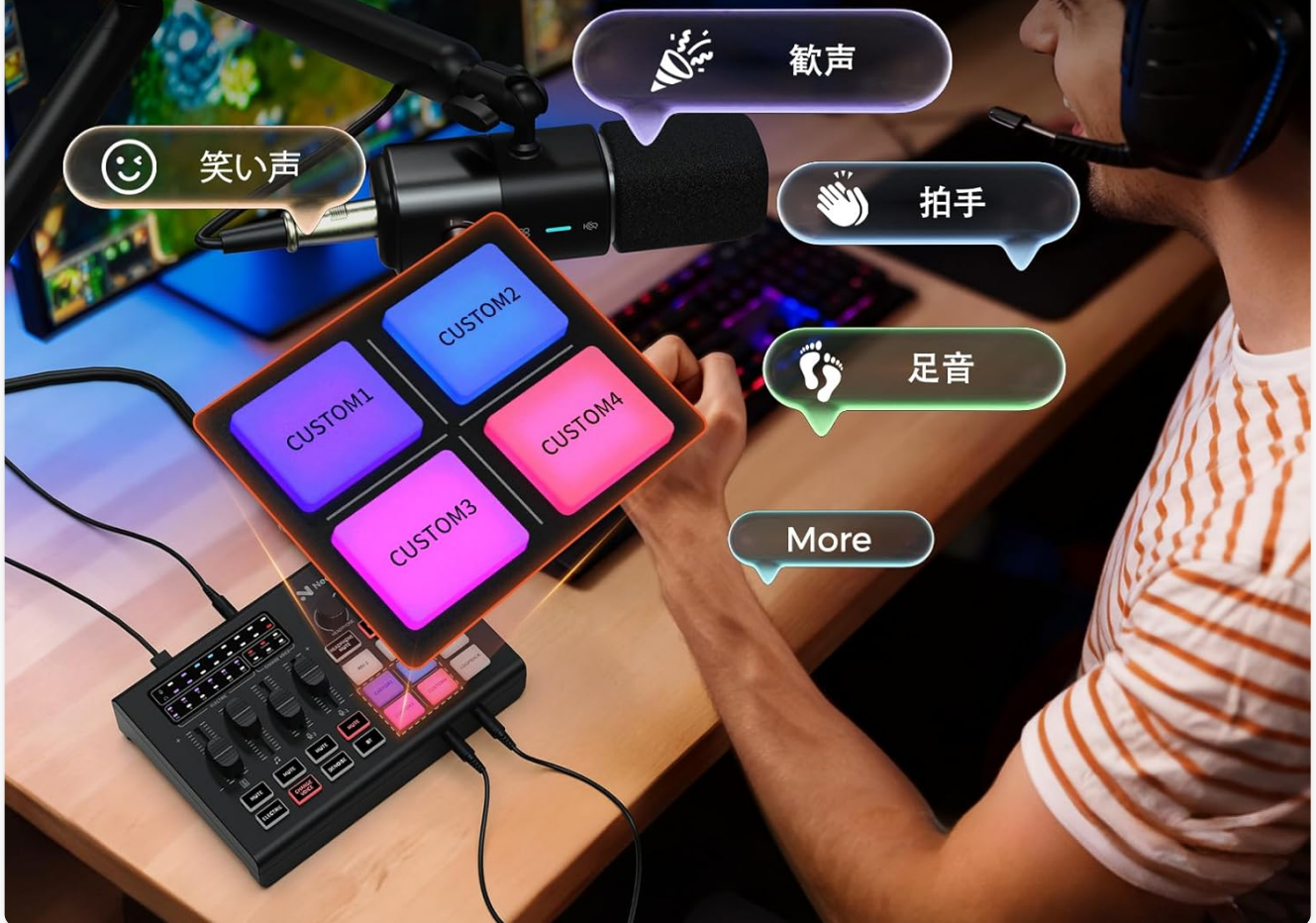
Image: A user interacting with the AMIX20U's customizable sound pads, demonstrating how pre-recorded effects like laughter, applause, and footsteps can be triggered during a broadcast.

4つのパッドそれぞれに最大15秒の効果音をあらかじめ登録できます。ワンタップで即座に再生し、あなたの配信をより豊かにしましょう。