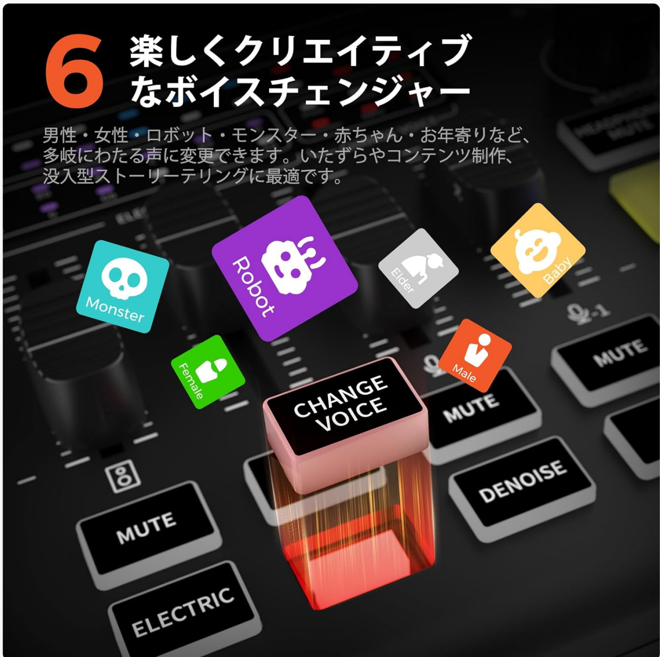
Image: A detailed view of the AMIX20U's voice changer section, illustrating the different voice modification options available for creative content creation.

Activate these modes using the dedicated buttons on the interface to add creative effects to your audio.