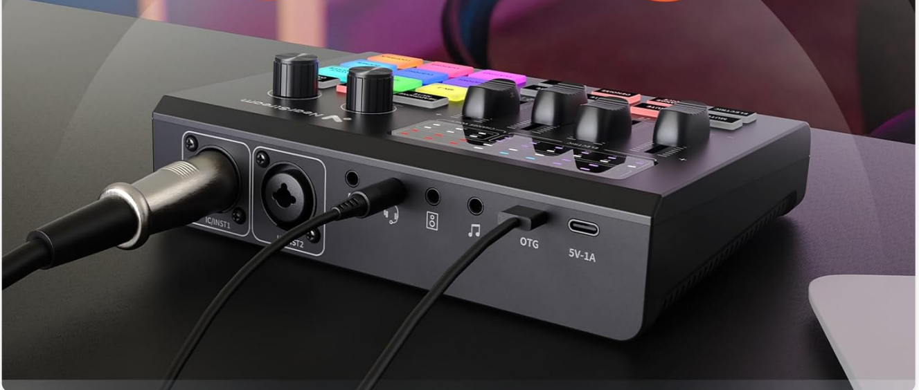
Image: The AMIX20U demonstrating its wide compatibility with different operating systems (Windows, Mac, Android, iOS) and popular streaming/recording applications.