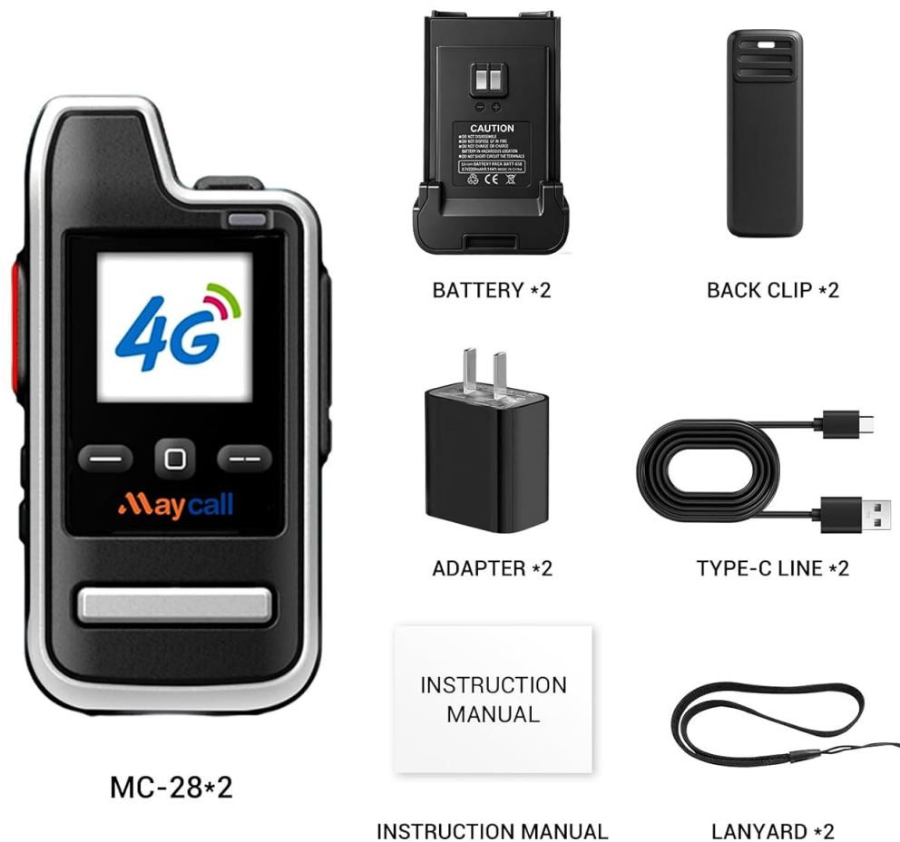
Figure 1: Package Contents