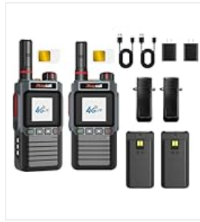
Figure 6: Charging Options