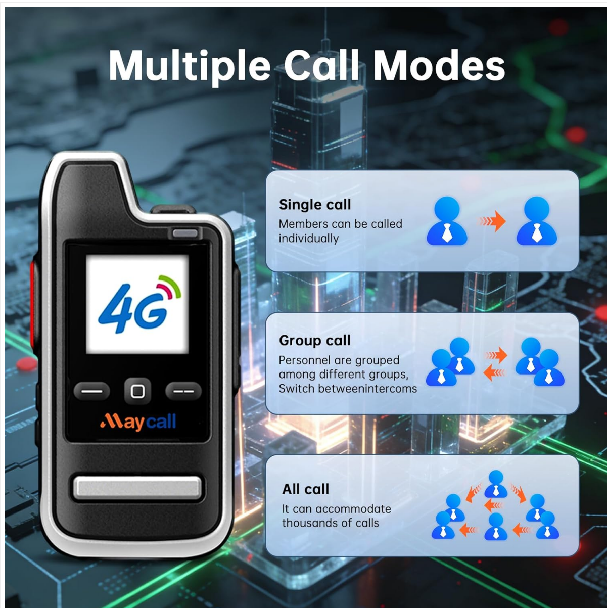
Figure 4: Multiple Call Modes