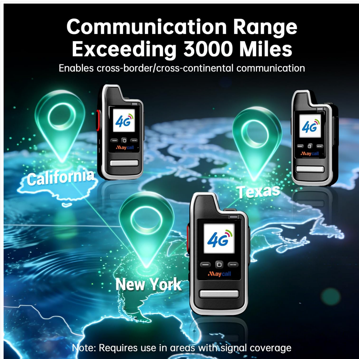
Figure 5: Communication Range

exceeding 3000 miles. This allows for communication across vast distances by seamlessly switching between traditional walkie talkie frequencies and cellular networks. Operation requires cellular signal coverage in the area of use.