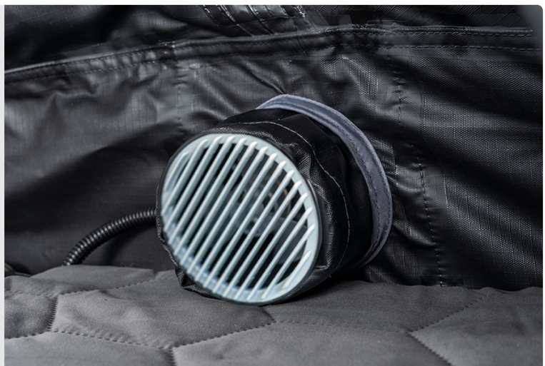
Figure 6: AC duct hole for climate control.

The CapeTop's AC duct hole fits your hose, keeping bugs and rain outside where they belong.