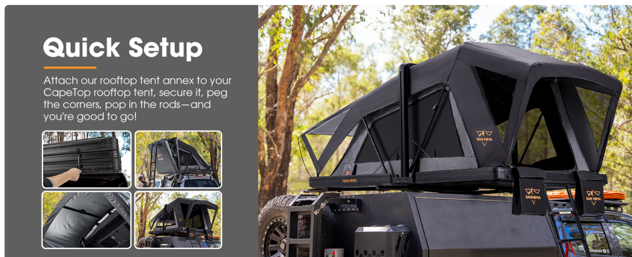
Figure 3: Quick setup process of the CapeTop Rooftop Tent.

Video 2: A review showcasing the setup and features of the SanHima CapeTop Rooftop Tent.