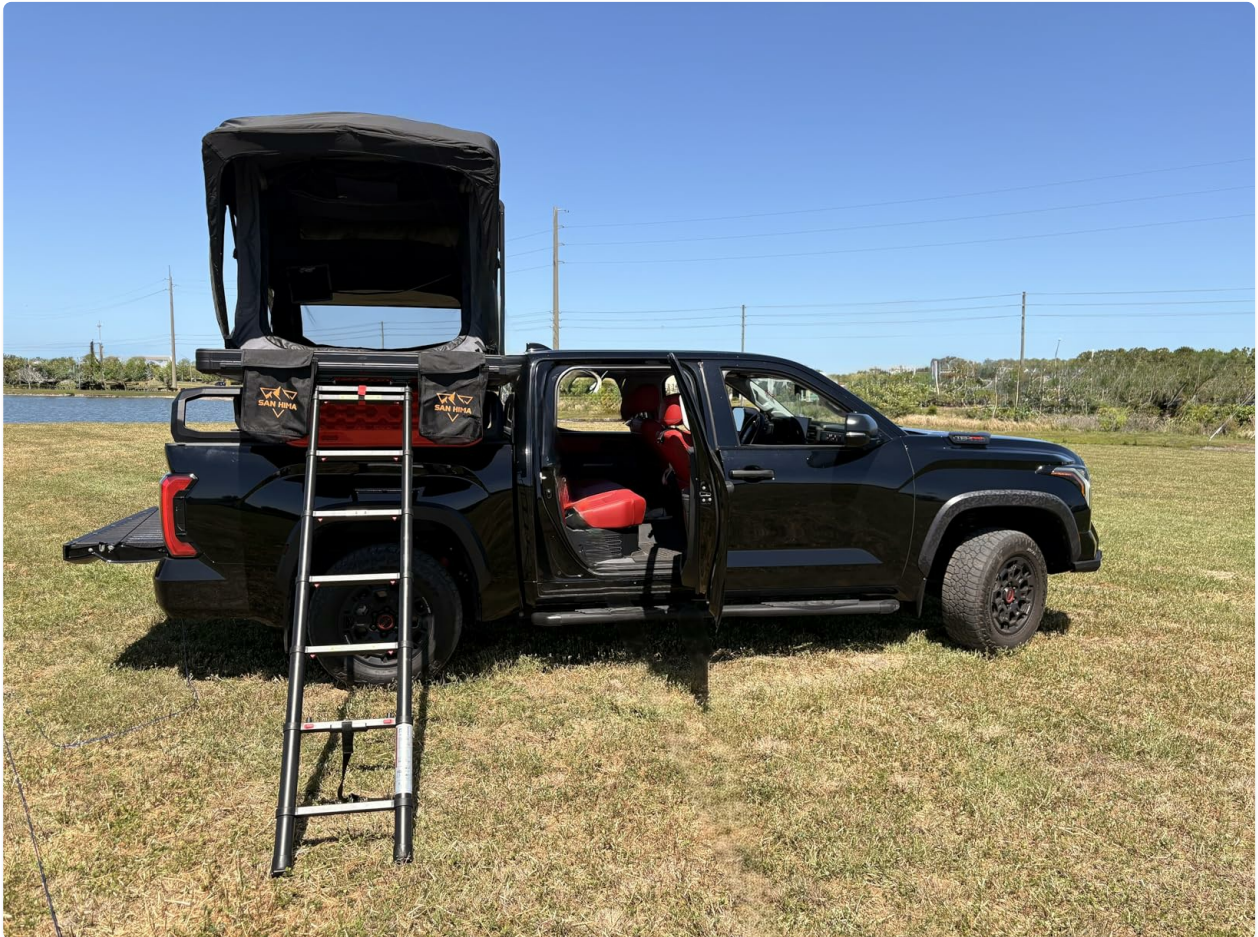
Figure 2: Included components of the CapeTop Rooftop Tent package.