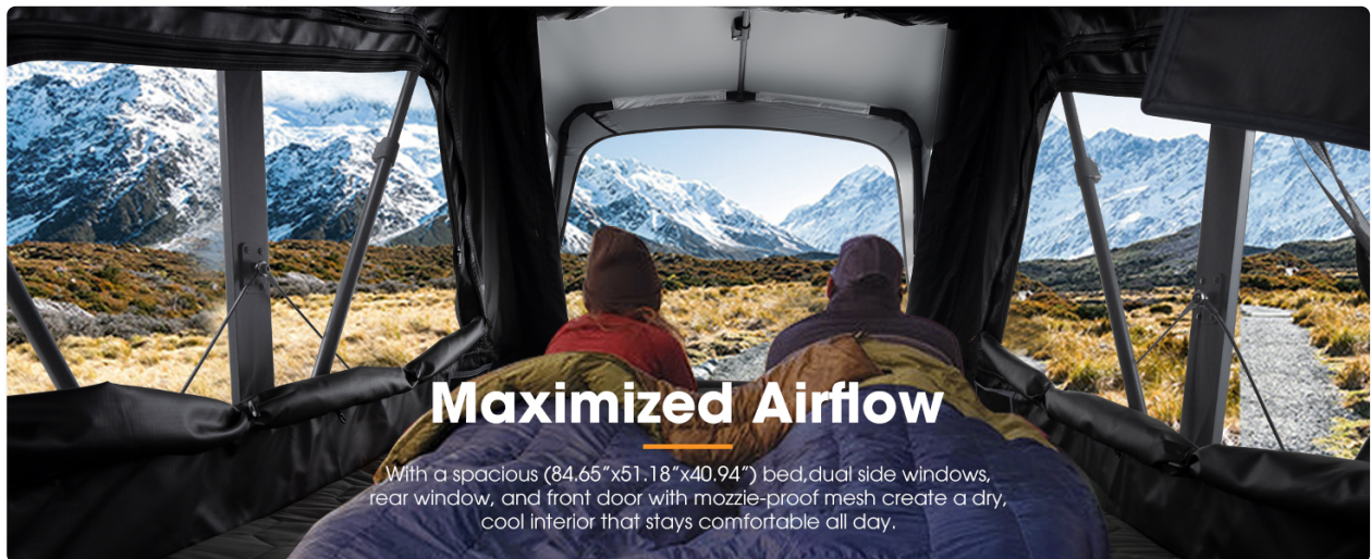
Figure 7: Interior with windows open for maximized airflow.