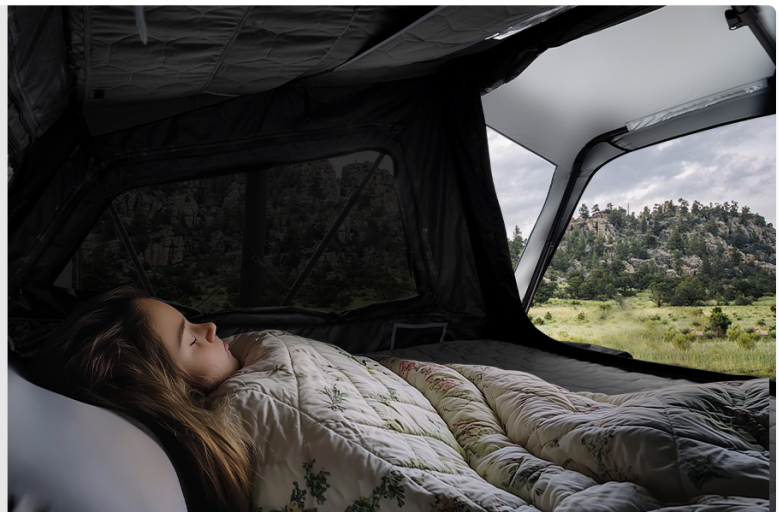
Figure 8: Light shielding technology ensures a dark interior.

The full-coverage canopy features silver lining that keeps the morning sun at bay, ensuring it stays cool and dark until you're ready to greet the day.