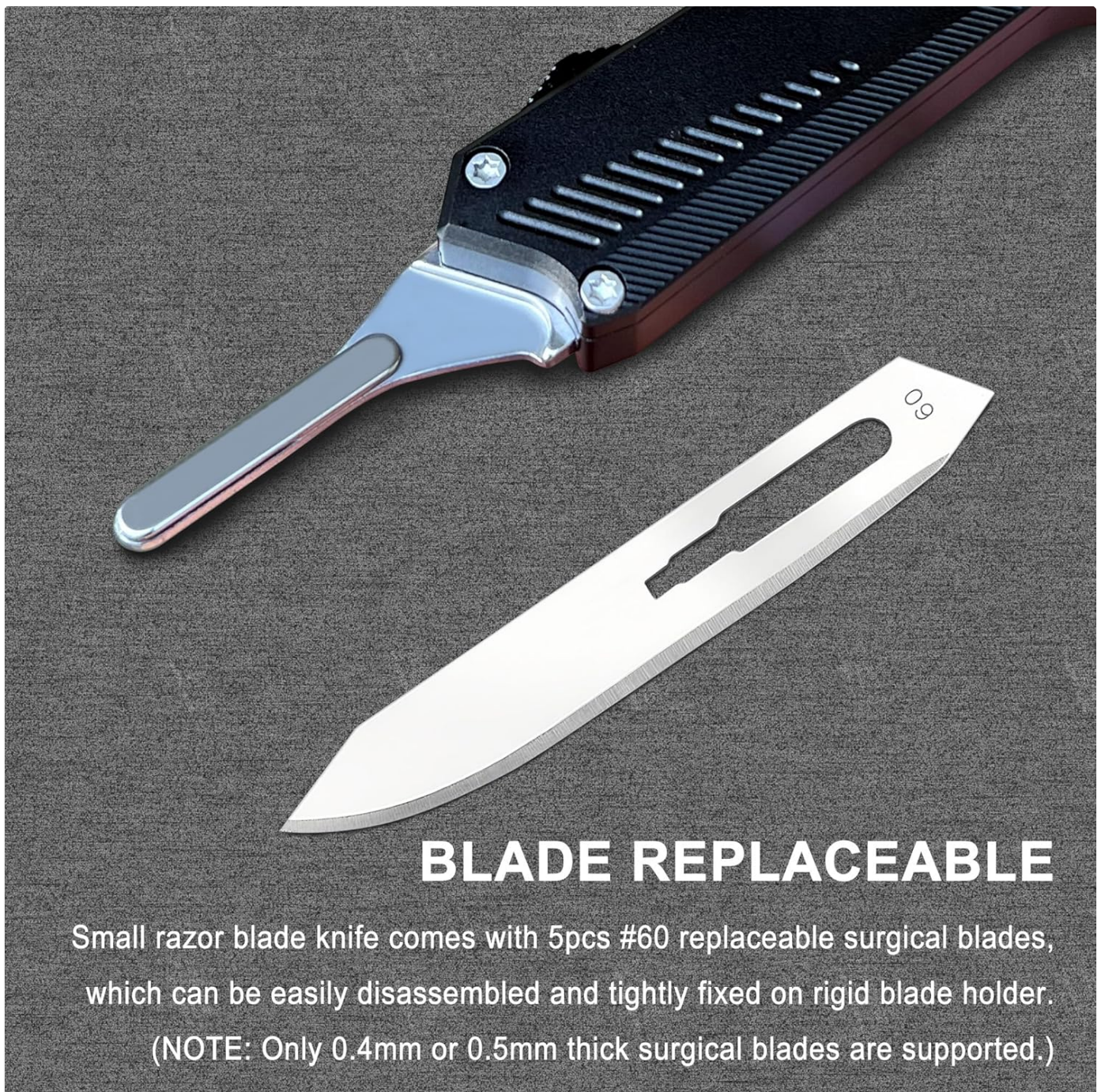
Image 3.1: Illustration of the blade replacement process, showing a #60 scalpel blade and the knife's blade holder.

WARNING: Blades are extremely sharp. Always use appropriate protective gear, such as cut-resistant gloves, when handling blades. Keep out of reach of children.