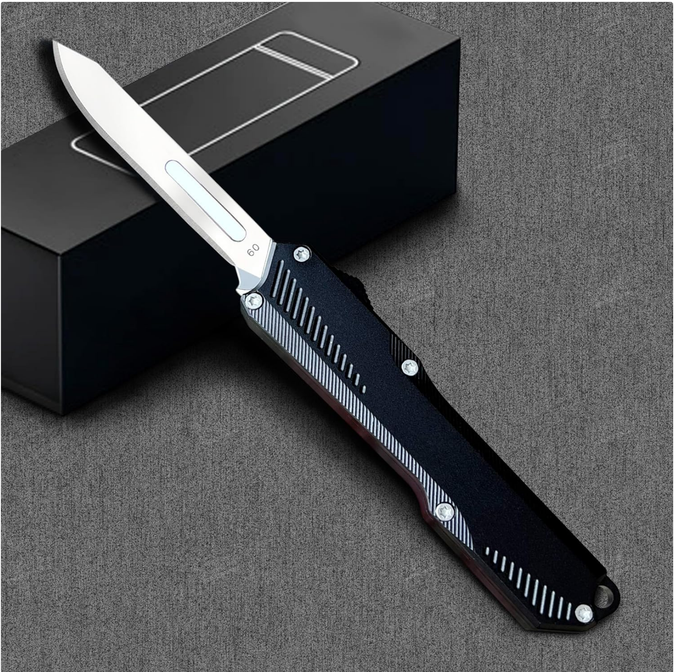
Image 1.1: Caressolove Automatic Scalpel Pocket Knife (Black variant) with its packaging.