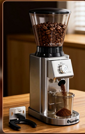
Ground Coffee Container