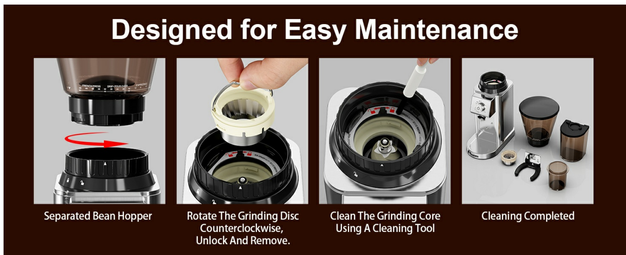
Figure 5.1: Step-by-step guide for disassembling and cleaning the burrs of the coffee grinder.