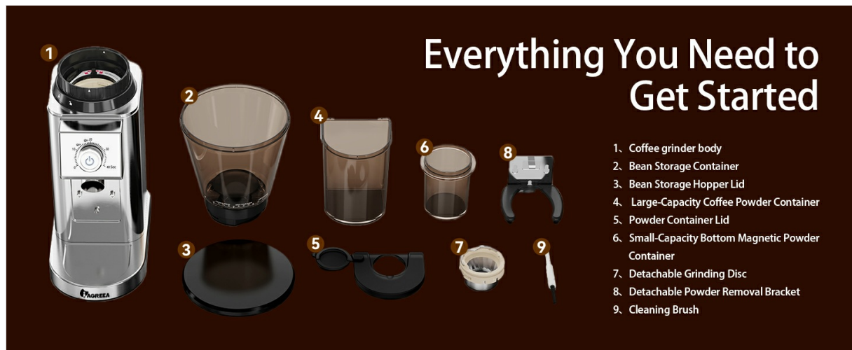
Figure 3.1: Illustration of the conical burr coffee grinder assembly, highlighting the bean hopper and grounds container placement.

6. Power Connection: Plug the power cord into a standard 120V electrical outlet.