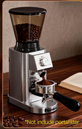
Filter Holder Stand

Universal Portafilter Holder & Dosing Cup