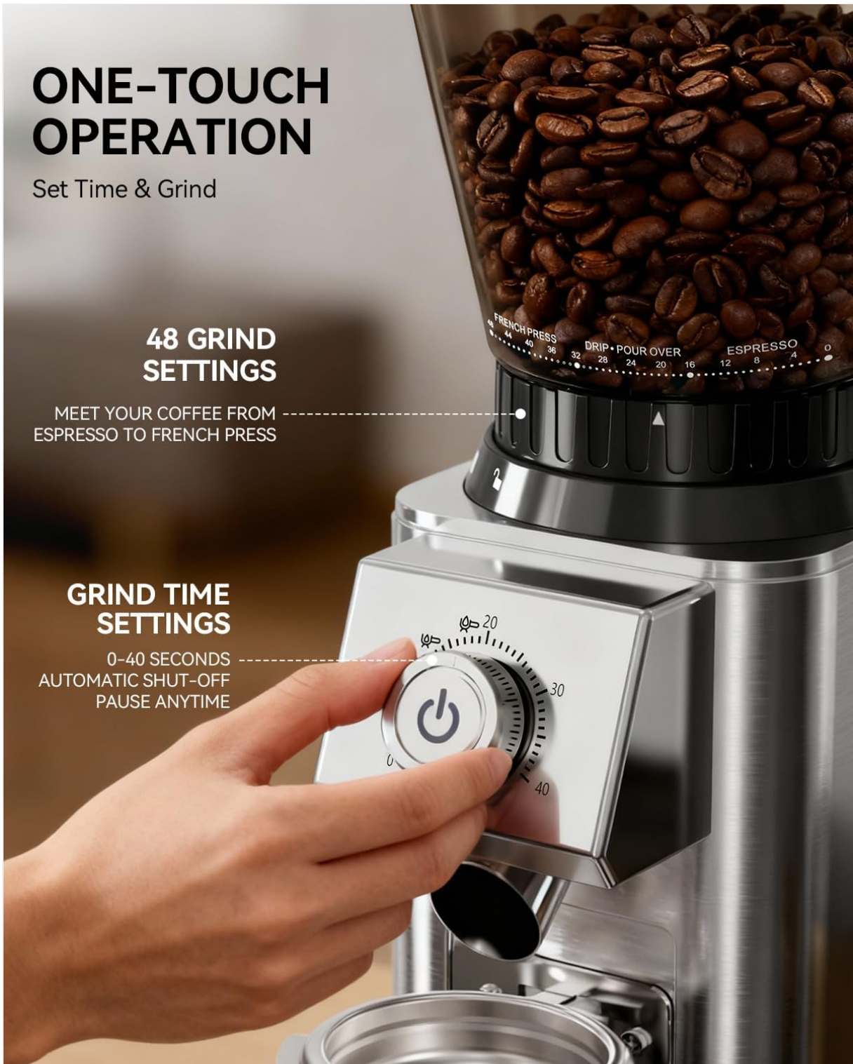
Figure 4.2: Close-up of the control panel showing the one-touch operation button and grind time settings.

0-40 SECONDS AUTOMATIC SHUT-OFF PAUSE ANYTIME