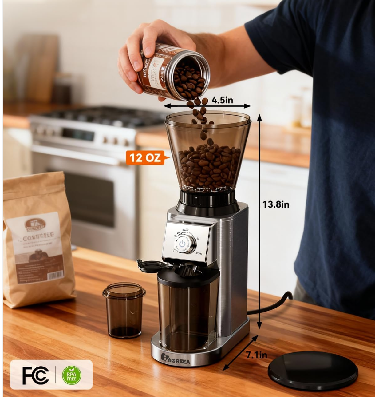
Figure 2.1: The IAGREEA CG208 Conical Burr Coffee Grinder, showcasing its compact design with the bean hopper and grounds container.