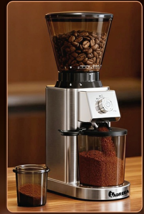
Large-Capacity Powder Container