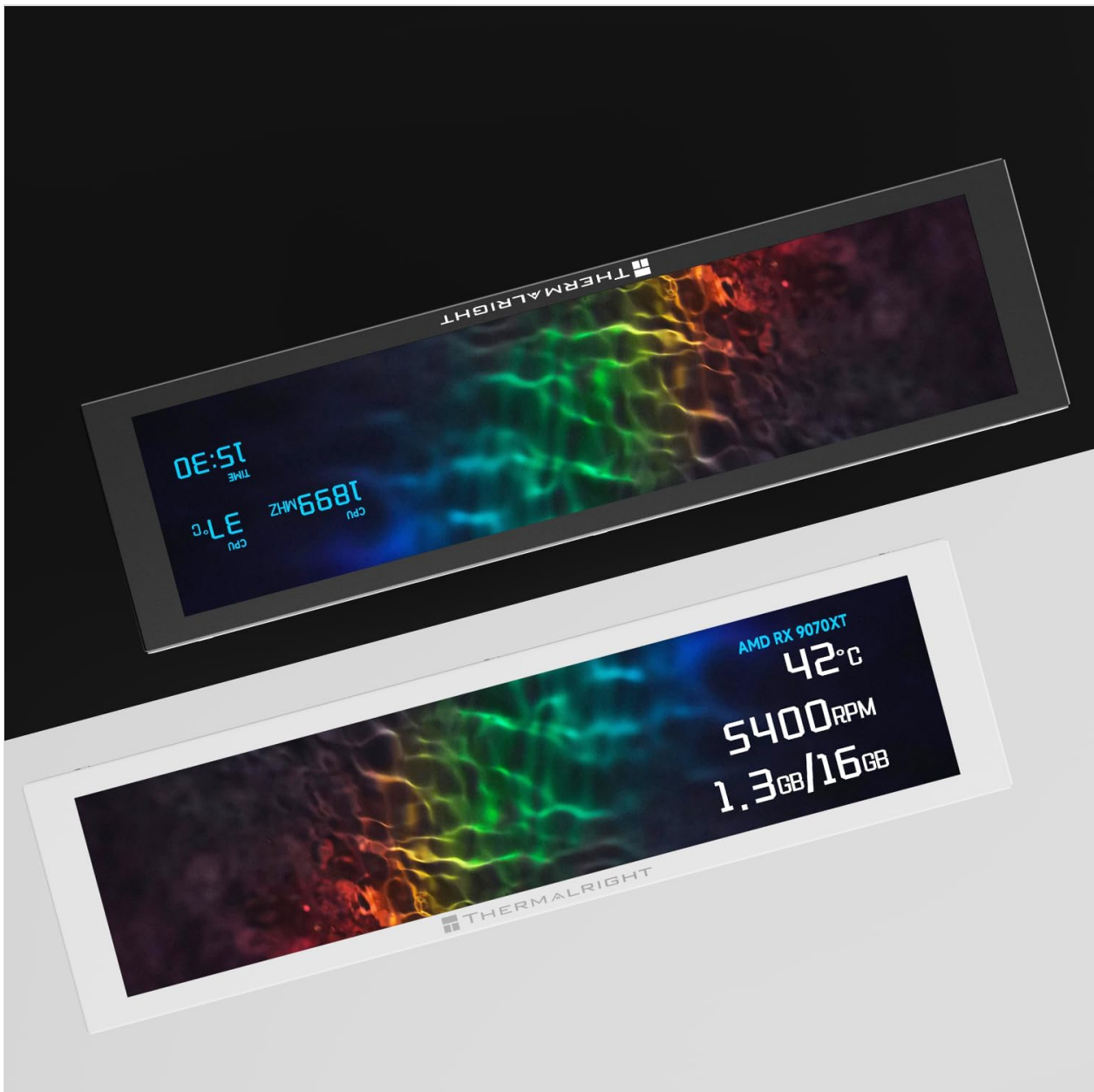
Image: Examples of customizable themes on the Thermalright display, showing system information and dynamic backgrounds.