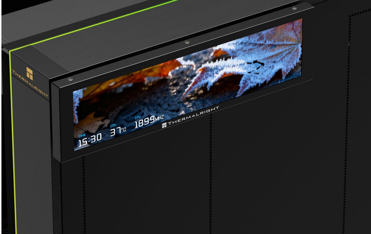
Image: The display shown magnetically attached to the inside of a computer case.