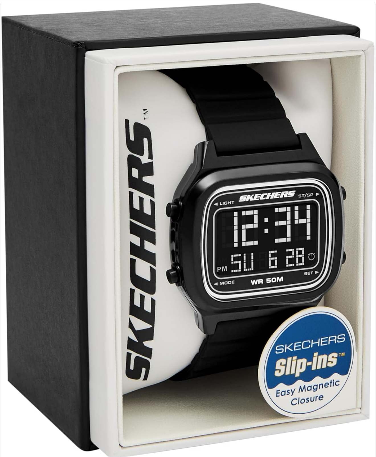
Image: The Skechers Fiske Digital Watch, Model SR5258, presented in its retail packaging. The watch features a black rectangular case and a black silicone strap.