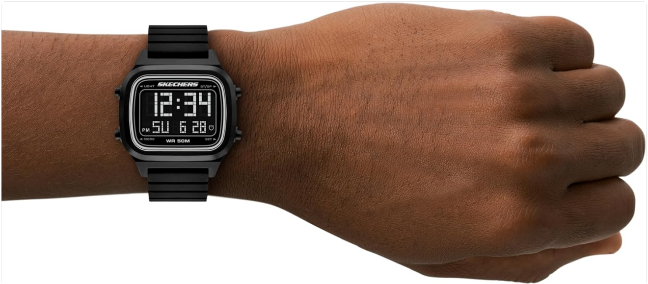
Image: The Skechers Fiske Digital Watch worn on a wrist, displaying the time and date. This illustrates how the watch appears when worn and the digital display.