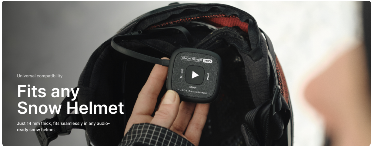
Image: A hand demonstrates inserting one of the ALECK Snow Series Pro speaker units into the padded ear flap of a ski helmet. The speaker is being slid into a pre-formed pocket, highlighting the ease of integration.