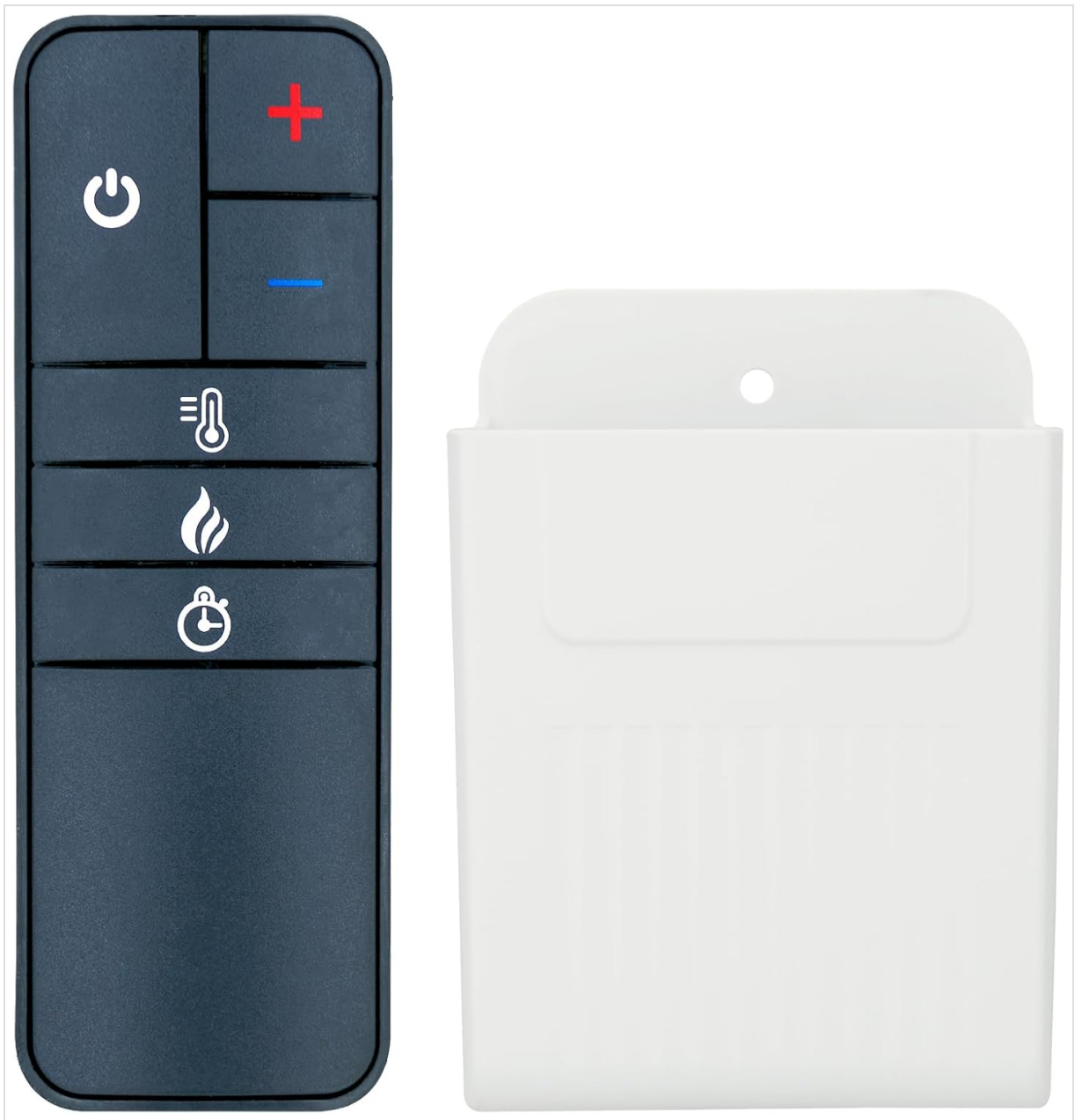
Image: The GAIGAICHONG replacement remote control shown alongside its accompanying wall mounting bracket. The remote is dark gray with white function icons, and the bracket is white.