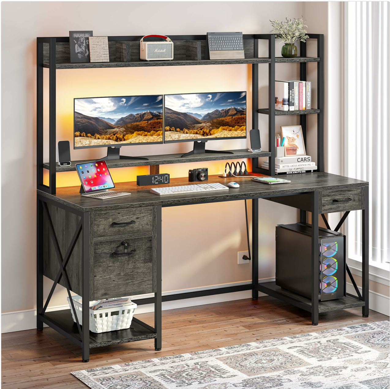
Figure 2.1: The DWVO Computer Desk with Drawers & Hutch.