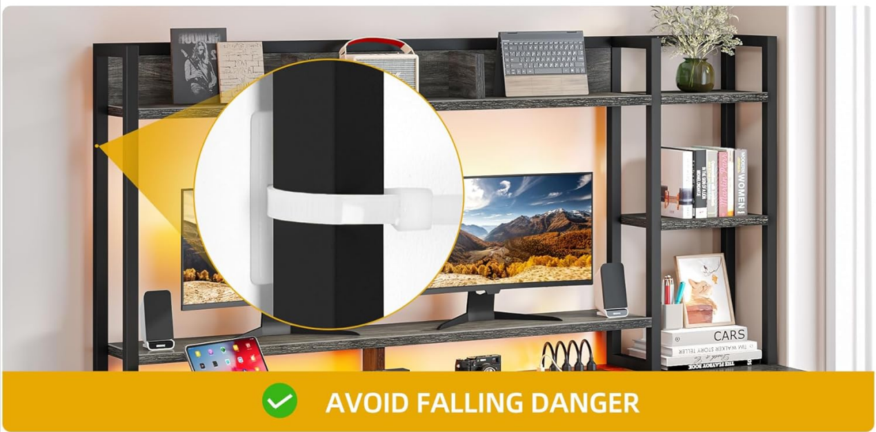
Figure 1.1: Illustration of potential injury from tipping and the use of an anti-tip strap to prevent falling danger.