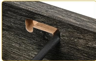
Easy to Adjust Size