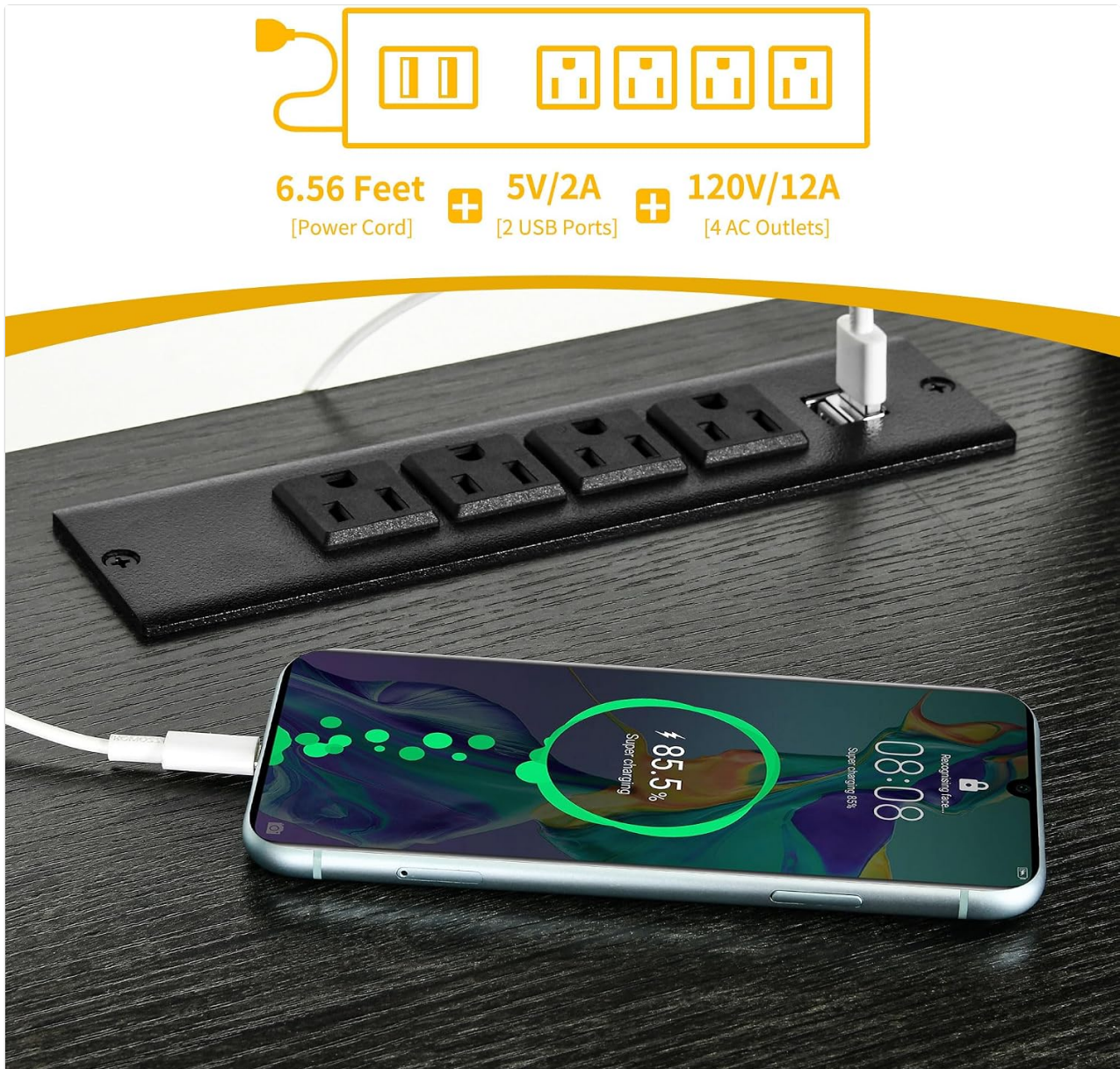
Figure 5.2: Integrated power outlets and USB ports.