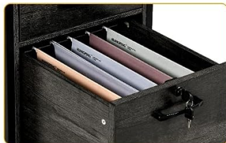
fits multiple document sizes : A4/Letter