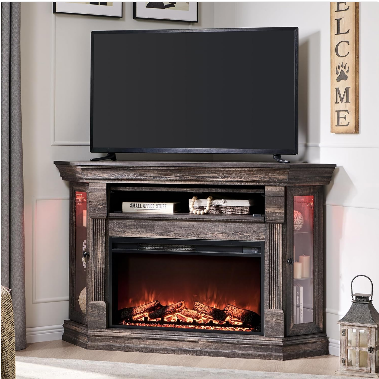
Figure 1: OKD 56-inch Corner Fireplace TV Stand in Dark Rustic Oak.