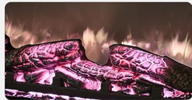
Figure 5: Electric fireplace control panel and various flame color options.