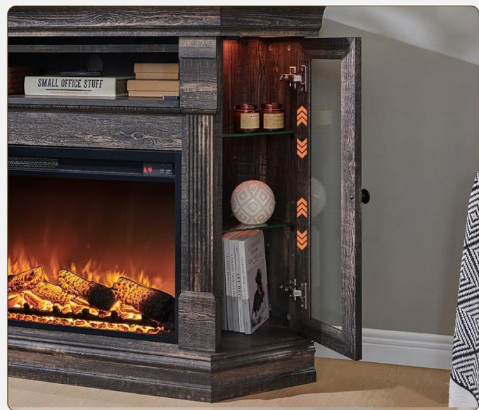
Figure 6: Hidden flip-up storage compartment and glass-door cabinet with LED lights.