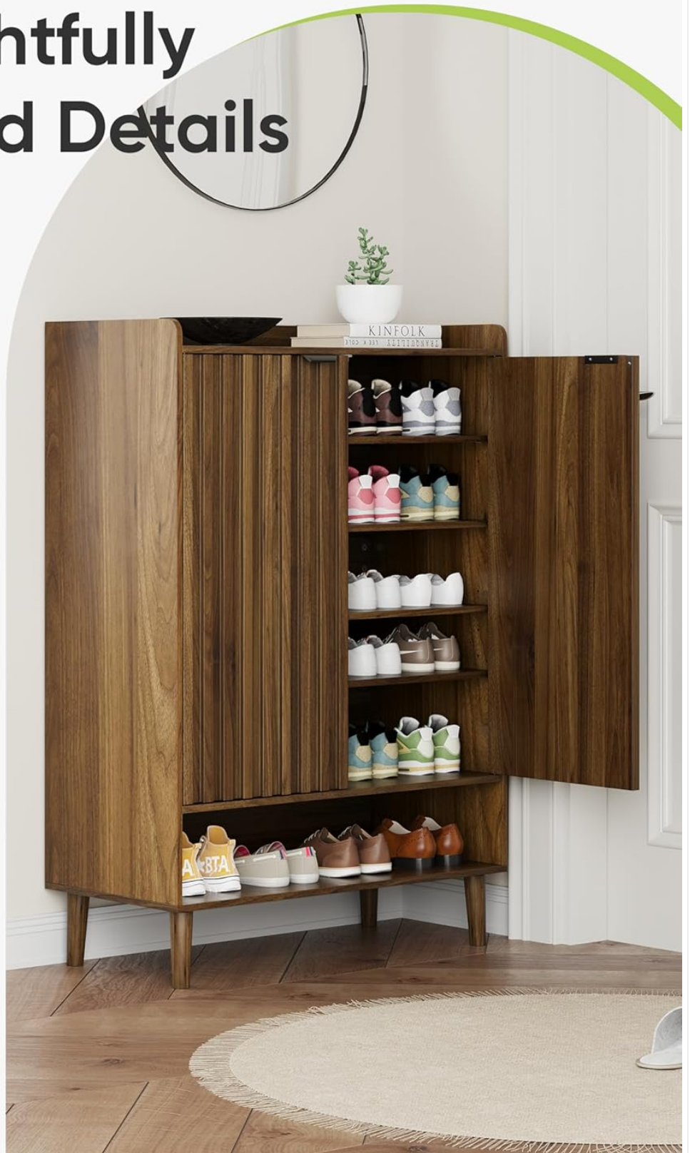
Figure 6.1: Interior view of the cabinet demonstrating shoe storage and slatted door design.