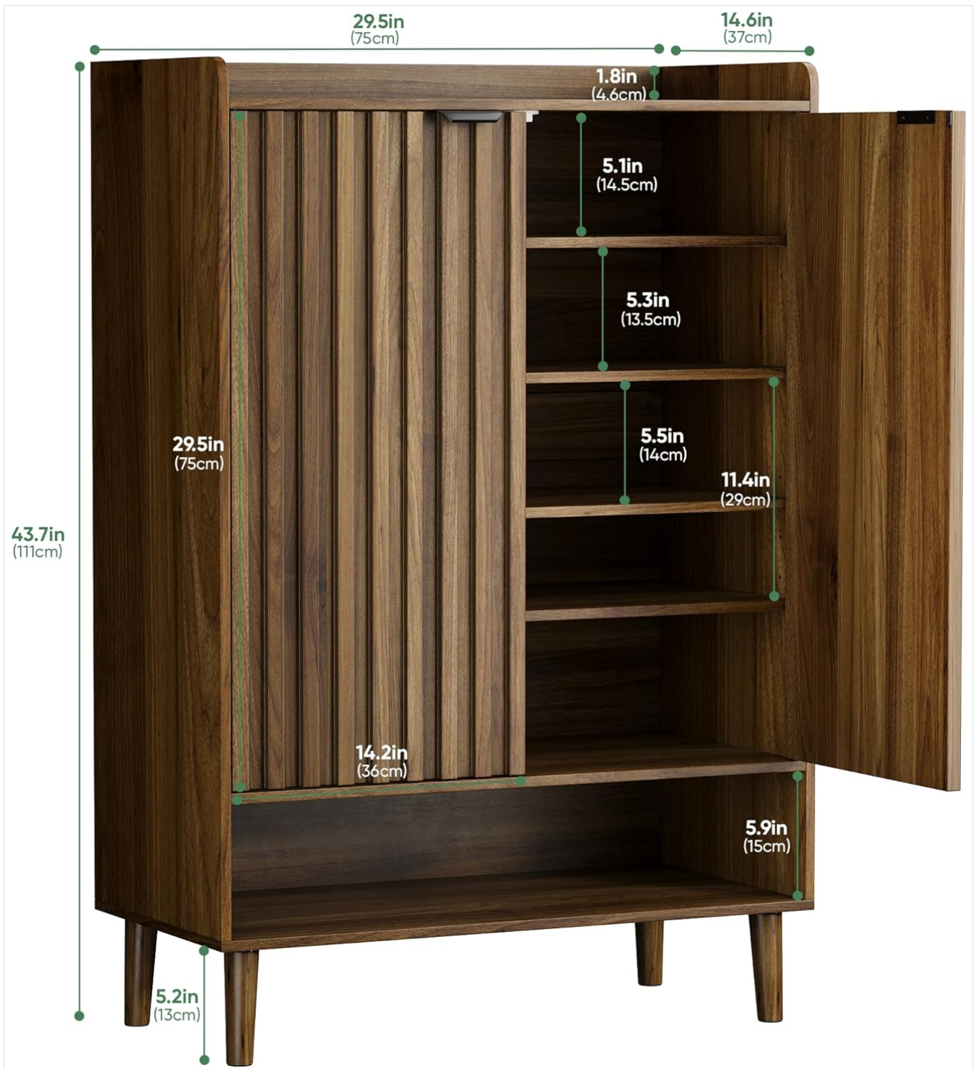
Figure 9.1: Detailed product dimensions.