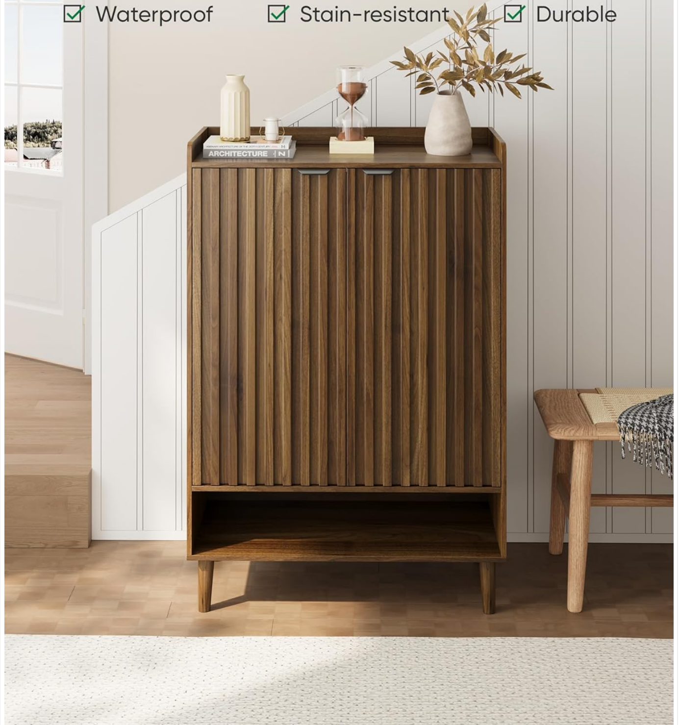
Figure 7.1: The cabinet's construction features high-quality, durable, waterproof, and stain-resistant materials.