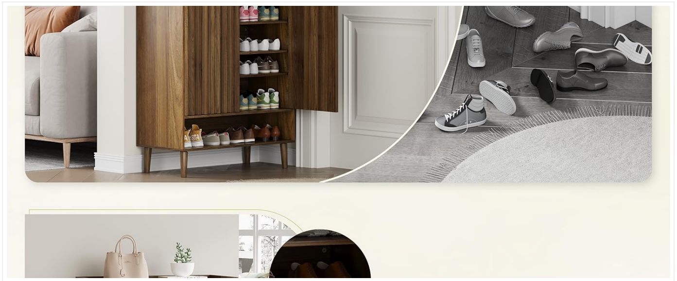
Figure 6.2: Illustration of adjustable and removable shelves for customized storage.