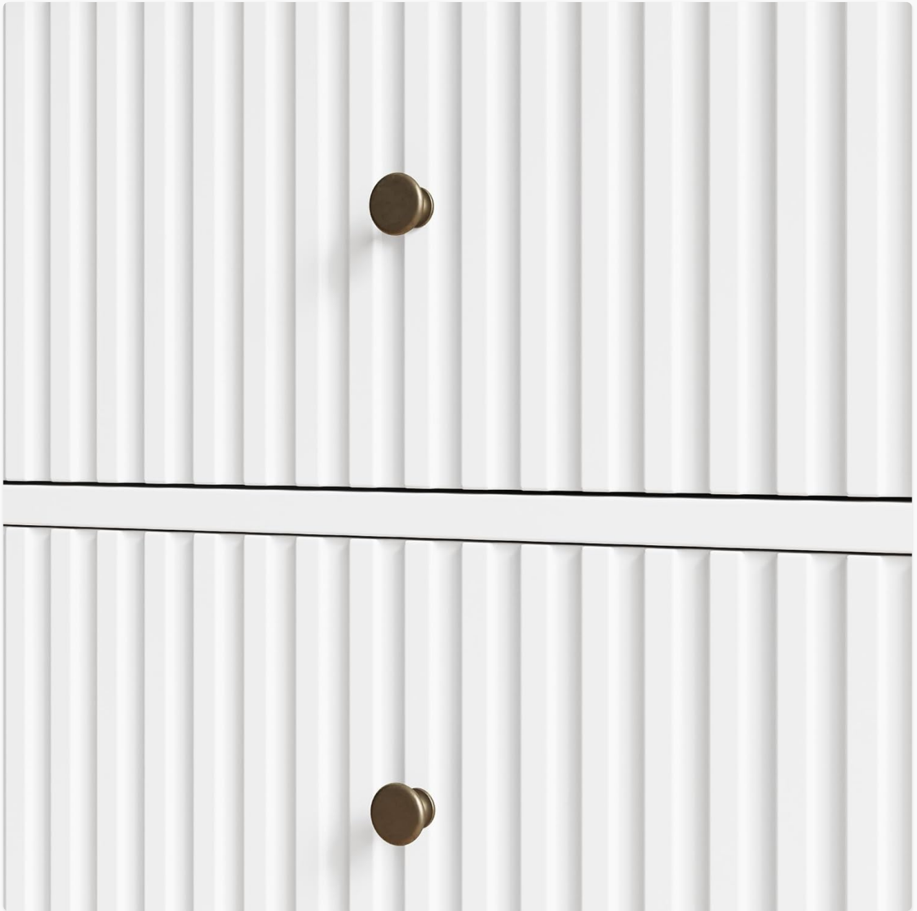
Image: A detailed view of the fluted texture on the drawer front and the elegant brass knob, highlighting the design and tactile quality.