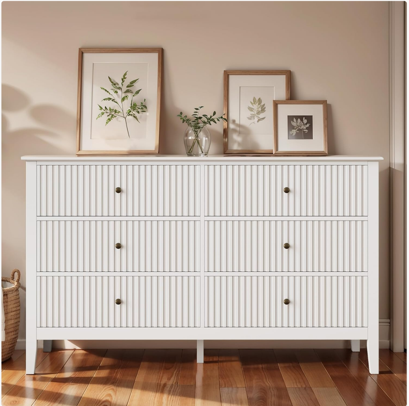
Image: The RoyalCraft Fluted 6-Drawer Dresser, Model ZSC029, displayed in a bedroom setting, showcasing its modern design and white finish.