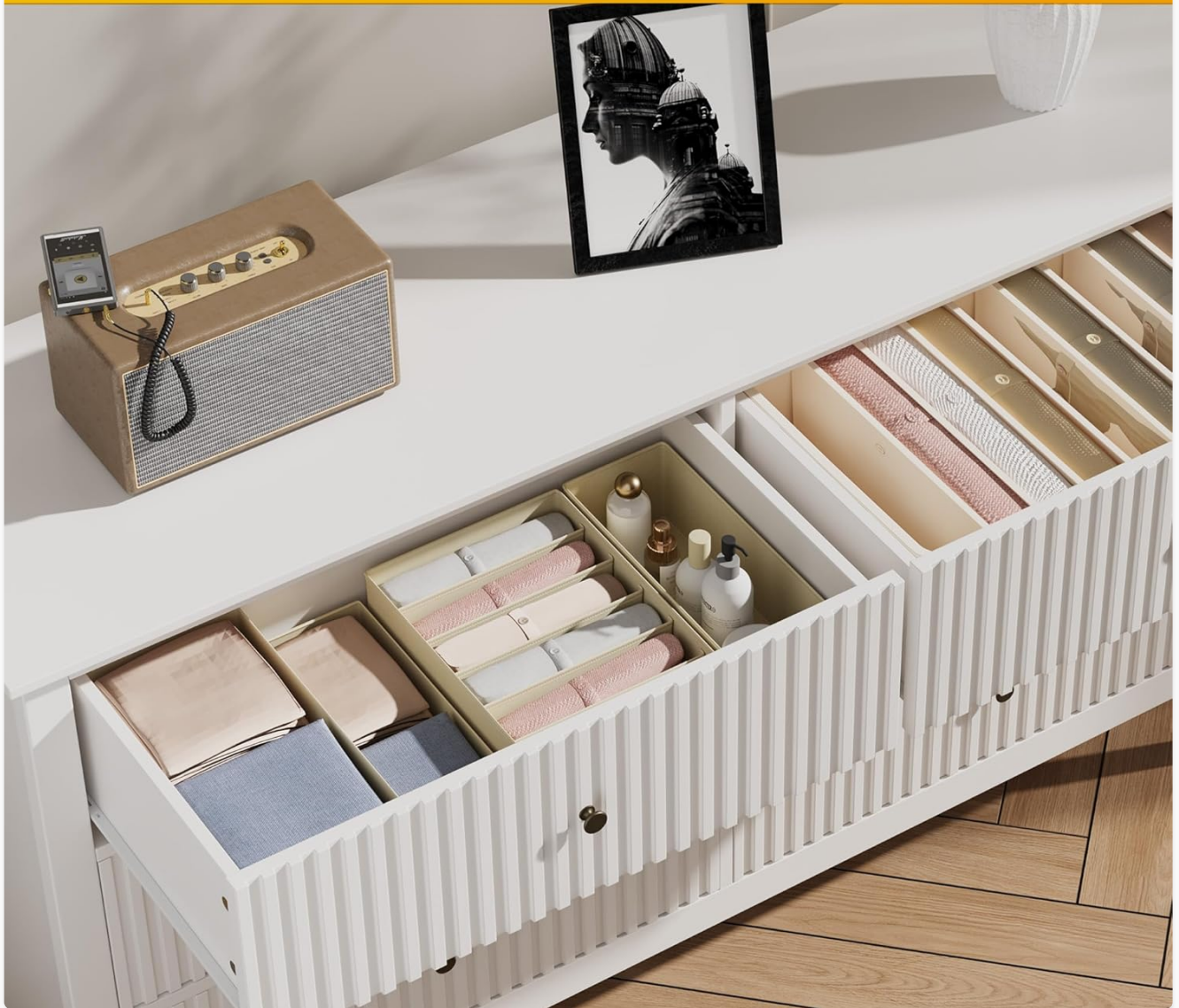
Image: The dresser with drawers partially open, illustrating the ample storage capacity and the smooth operation of the drawer slides.