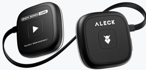
Aleck Snow Series Core