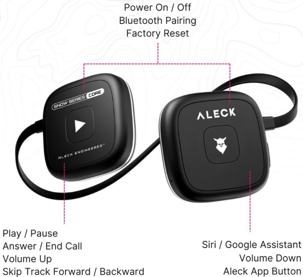
Image: Diagram of ALECK Snow Series Core button controls.