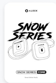
Image: Contents of the ALECK Snow Series Core package.